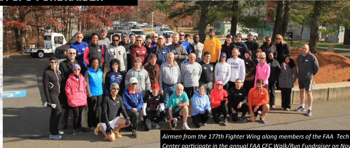
Airmen from the 177th Fighter Wing along members of the FAA Tech Center participate in the annual FAA CFC Walk/Run Fundraiser on Nov. 20, 2013.

For more awards photos, check out the 177th Fighter Wing Facebook page!