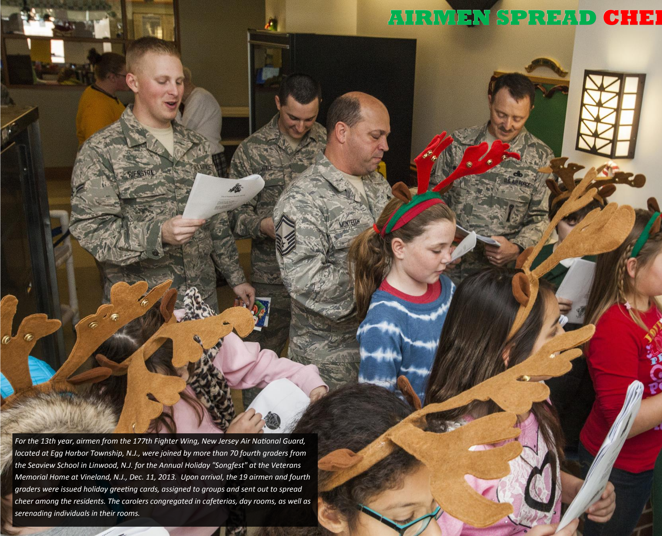
For the 13th year, airmen from the 177th Fighter Wing, New Jersey Air National Guard, located at Egg Harbor Township, N.J., were joined by more than 70 fourth graders from the Seaview School in Linwood, N.J. for the Annual Holiday "Songfest" at the Veterans Memorial Home at Vineland, N.J., Dec. 11, 2013. Upon arrival, the 19 airmen and fourth graders were issued holiday greeting cards, assigned to groups and sent out to spread cheer among the residents. The carolers congregated in cafeterias, day rooms, as well as serenading individuals in their rooms.