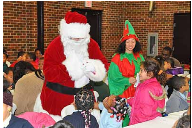
Santa Claus and his trusted elf make the rounds with young boys and girls.