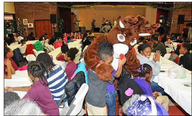
Children love visiting with Rudolph the Red-Nosed Reindeer - another featured guest at this year's party.