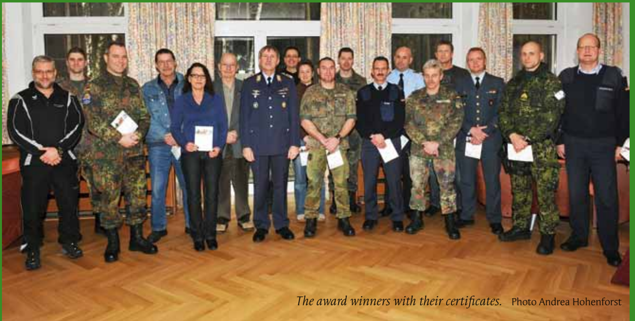
The award winners with their certificates.

Individuals have several choices of events within the categories, but basically they must achieve satisfactory results in swimming, throwing, jumping, a long distance run and a fast run (sprint), based on their age and gender. The only category without an option is the 200 metres swim, which all must complete.