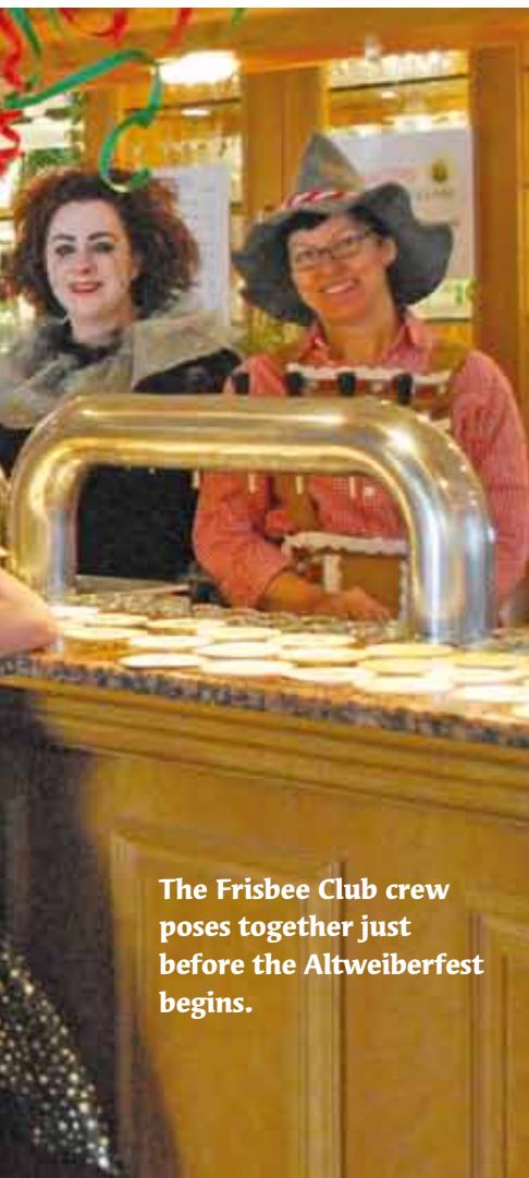
The Frisbee Club crew poses together just before the Altweiberfest begins.

As the crew get up from the tables to go off to their posts, two of them are wearing T-shirts showing the words "Adieë Wa", Limburg dialect for "See you again (some day)."