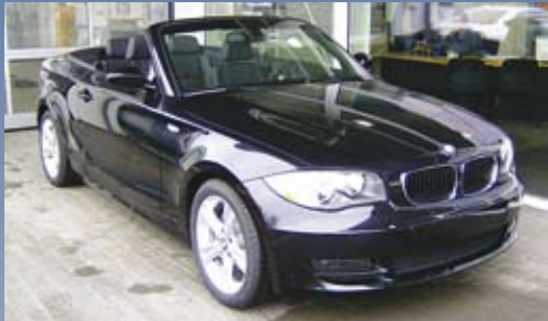
2008 BMW 128i Convertible (VJ73810)

Black Sapphire metallic, Black Boston Leather, Black soft top, Light Burl Walnut wood trim, Steptronic Automatic, Premium Package, Sport Package, Comfort Access, Heated Front Seats, I POD Adapter (without cable), Paddle Shifters, etc.