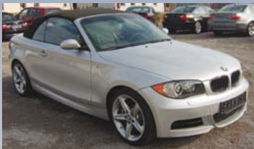
2008 BMW 135i Convertible (VE94403)

Titanium Silver metallic, Black Boston Leather, High Gloss Black interior trim, 6 speed manual transmission, Sport Package, Cold Weather Package, Comfort Access, I POD Adapter (without cable), Power front seats w driver memory, Park Distance Control, etc.