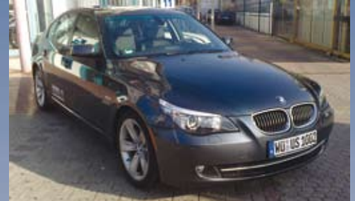
2009 BMW 528i Sedan (C118516)

3,479 miles, Platinum Gray metallic, Black Dakota leather, 4 Doors, Automatic, Premium Package, Sport Package, Cold Weather Package, I POD Adapter, GPS Navigation, Park Distance Control, Xenon Lights, etc.