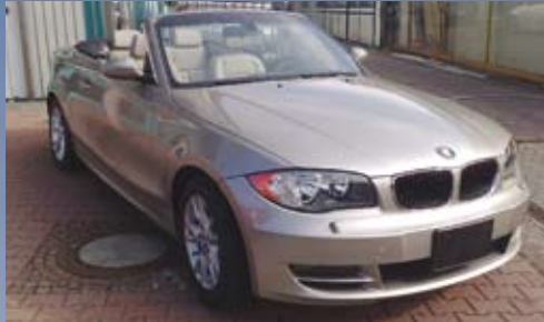
2009 BMW 128i Convertible (VJ74324)

Cashmere Silver metallic, Beige Boston Leather, Gray Poplar wood trim, Steptronic Automatic, Taupe soft top, Premium Package, Cold Weather Package, Comfort Access, I POD Adapter (without cable), Navigation, Park Distance Control, etc.