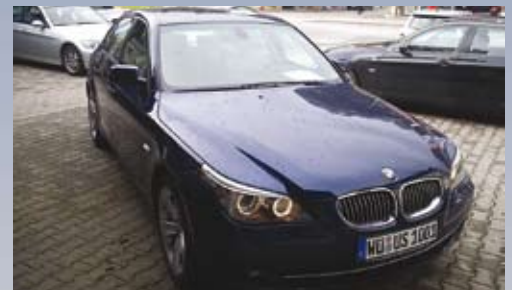
2009 BMW 528i Sedan (C118501)

640 miles, Deep Sea Blue metallic, Cream Beige Dakota leather, Dark Poplar wood trim, Steptronic Automatic, Premium Package, Sport Package, Cold Weather Package, Comfort Access, I POD Adapter (without cable), Navigation, Park Distance Control, Xenon Lights, etc.