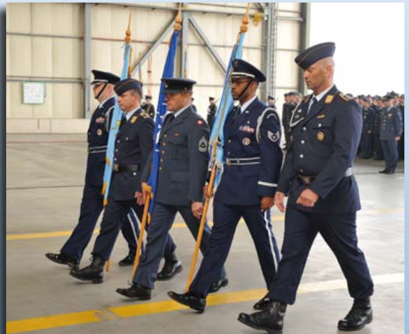
Presenting the Colours during the ceremony.