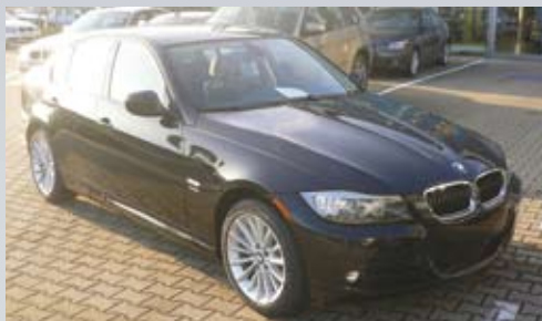
2009 BMW 328i xDrive Sedan (A452780)

658 miles, Black Sapphire metallic, Black Dakota Leather, Aluminum Interior Trim, Steptronic Automatic, Premium Package, Sport Package, Cold Weather Package, Comfort Access, HD-Radio, I POD Adapter (without cable), Navigation, Park Distance Control, Paddle Shifters, Xenon Lights, etc.