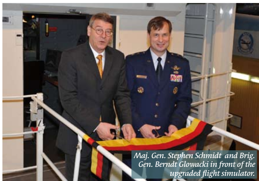
Maj. Gen. Stephen Schmidt and Brig. Gen. Berndt Glowacki in front of the upgraded flight simulator.

Last year, all the squadrons used and flew the flight simulator for more than 3,000 hours. This figure reflects not only flight crew training but also training for maintenance technicians. The flight simulator is in use for 16 hours a day, five days a week. The installation of the second weather radar and third Control Display Unit for the FMS gives navigators the possibility to train individually or in a crew concept.