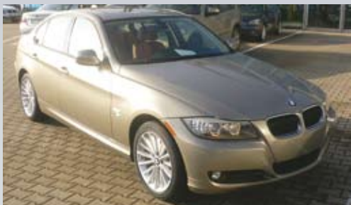
2009 BMW 328i xDrive Sedan (A452779)

702 miles, Platinum Bronze metallic, Chestnut Brown Dakota Leather, Light Burl Walnut trim, Steptronic Automatic, Premium Package, Sport Package, Cold Weather Package, Comfort Access, HD-Radio, I POD Adapter (without cable), Navigation, Park Distance Control, Paddle Shifters, Xenon Lights, etc.