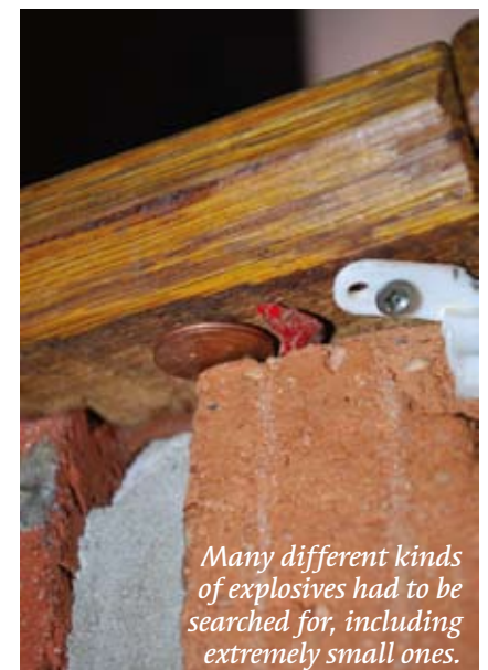
Many different kinds of explosives had to be searched for, including extremely small ones.

“The dog never lies,” says Brands, “but it can't provide a 100% guarantee. Right now it's the best help that you can find on the market.”