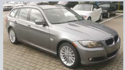
2009 BMW 328i xDrive Sport Wagon (A540138)

1,839 miles, Space Gray metallic, Black Dakota Leather, Dark Burl Walnut wood trim, Steptronic Automatic, Premium Package, Sport Package, Cold Weather Package, Comfort Access, I POD Adapter (without cable), Navigation, Park Distance Control, Paddle Shifters, Xenon Lights, etc.