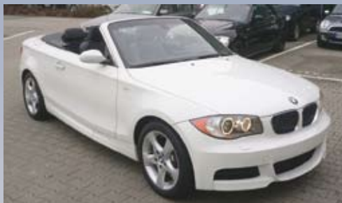
2008 BMW 135i Convertible (VE94468)

Alpine White exterior, Black Boston Leather, High Gloss Black interior trim, 6 speed manual transmission, Premium Package, Cold Weather Package, I POD Adapter (without cable), Navigation, Park Distance Control, etc.