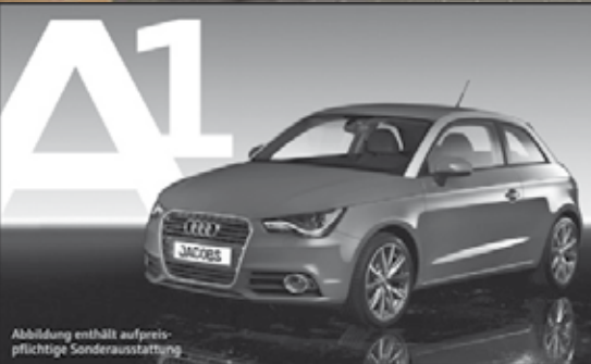
Abbildung enthält aufpreis-pflichtige Sonderausstattung