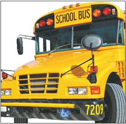
School Bus Schedules