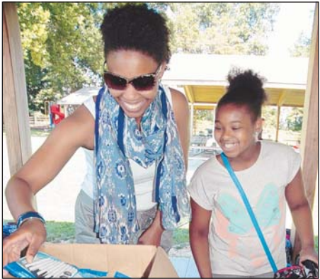
Back to School Brigade