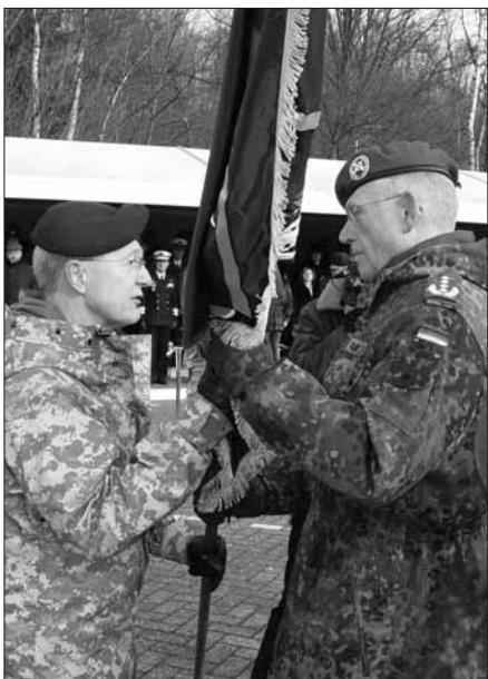
General Craddock hands over the JFC Brunssum flag to General Ramms during the Change of Command Ceremony.

How can you do that? Well, one key to managing "complexity" is to make a bottom-up analysis, with modularity in mind. Breaking down big problems into little ones makes it possible for you to do things in an efficient manner. Another key is collaboration, so, do not be afraid to talk to your peers and collaborators about the problems you have encountered, whether or not they are close to you or on the other side of the world, because nowadays, this former "complexity" has changed to "simplicity."