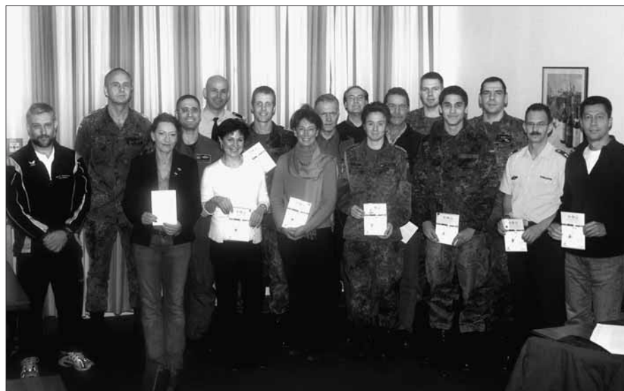
The 2007 German Sports Award winners proudly present their certificates.