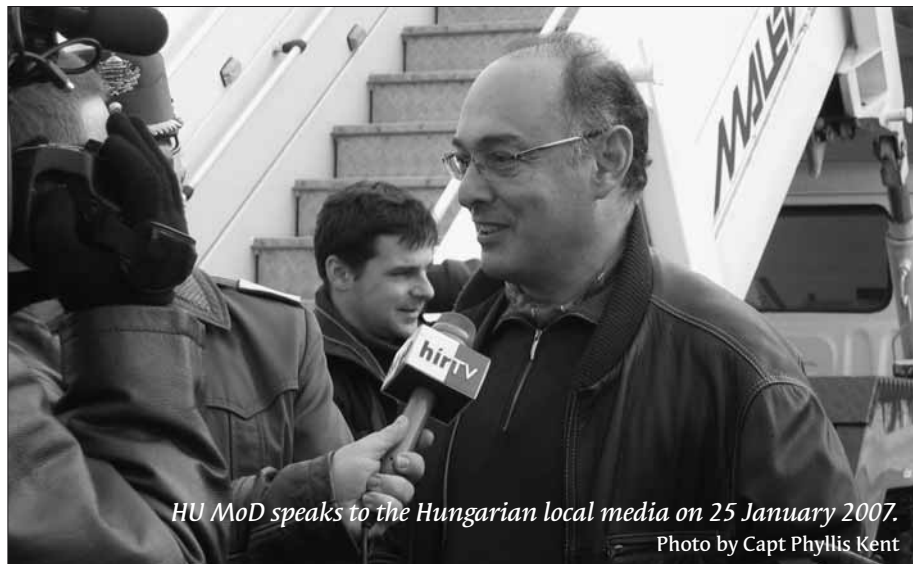
HU MoD speaks to the Hungarian local media on 25 January 2007.

Hungary has been a member of the European Union since 1 May 2004 and is the newest NATO member to contribute personnel to the NATO E-3A Component. Both the Component and Hungary look forward to many future deployments and the inclusion of additional Hungarian service members to NATO AWACS to contribute to the continued success of the NATO E-3A Component.