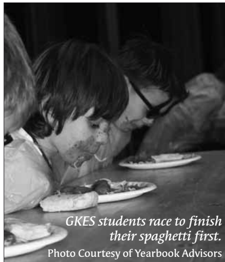
GKES students race to finish their spaghetti first.