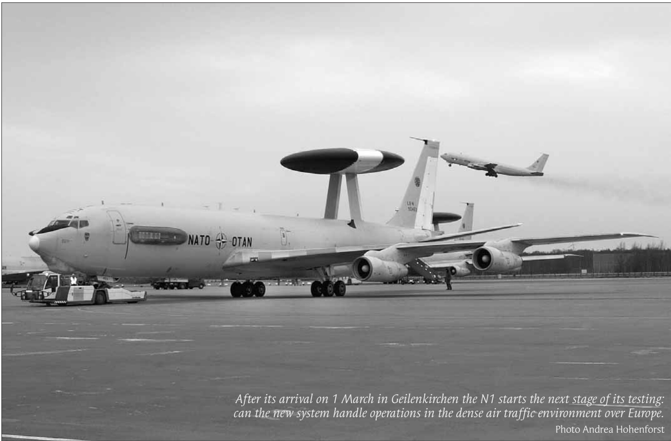
After its arrival on 1 March in Geilenkirchen the N1 starts the next stage of its testing: can the new system handle operations in the dense air traffic environment over Europe.

After Boeing completed its testing, the Bunker crew was given the opportunity to conduct an Operational