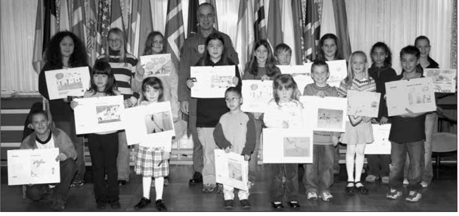
The proud winners posing with E-3A Component Commander Brig. Gen. Axel Tüttelmann, showing their selected drawing.

If you are interested in buying this safety calendar, please contact the Safety Office, ext. 2465 or 2460.