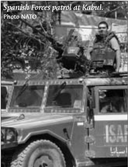
Spanish Forces patrol at Kabul.

secure environment in Afghanistan. Throughout the country, the process is now 82% complete and some 7,360 operational and repairable heavy weapons are under lock and key in guarded compounds. The programme is an initiative of the Afghanistan Ministry of Defence. ISAF endorses, supports and facilitates the cantonment of the weapons, including providing logistic support for the collection and transport of the weapons. (Information from NATO news release)