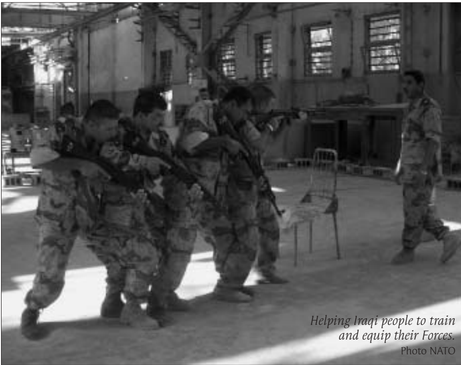
Helping Iraqi people to train and equip their Forces.

The NATO School in Oberammergau now has new facilities that will double the student capacity of the school and give students access to cutting-edge educational tools. The new facilities were given their first test during the 2005 NATO Defence Planning Symposium. The event, held at the school from 17 to 19 January, was attended by 27 high level speakers, with a keynote address by the NATO Secretary General, Jaap De Hoop Scheffer. New facilities for future requirements The enlargement of the school includes two large classrooms, several small class and syndicate rooms, multimedia tools and space for additional faculty and support staff. These new capabilities will include