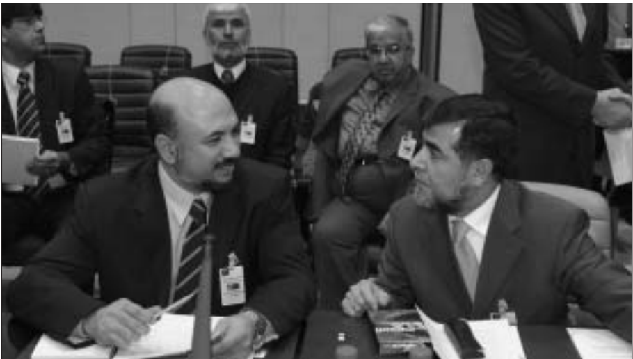
Habibullah Qaderi (left), Afghan Minister for Counter Narcotics speaking with Mohammed Haider Reza, Afghan Deputy Foreign.

Speaking at the Foreign Ministers meeting SACEUR said he was finalising the details of some of the offers, but that the outcome had been very positive, "It means we are really on track to execute training inside Iraq,