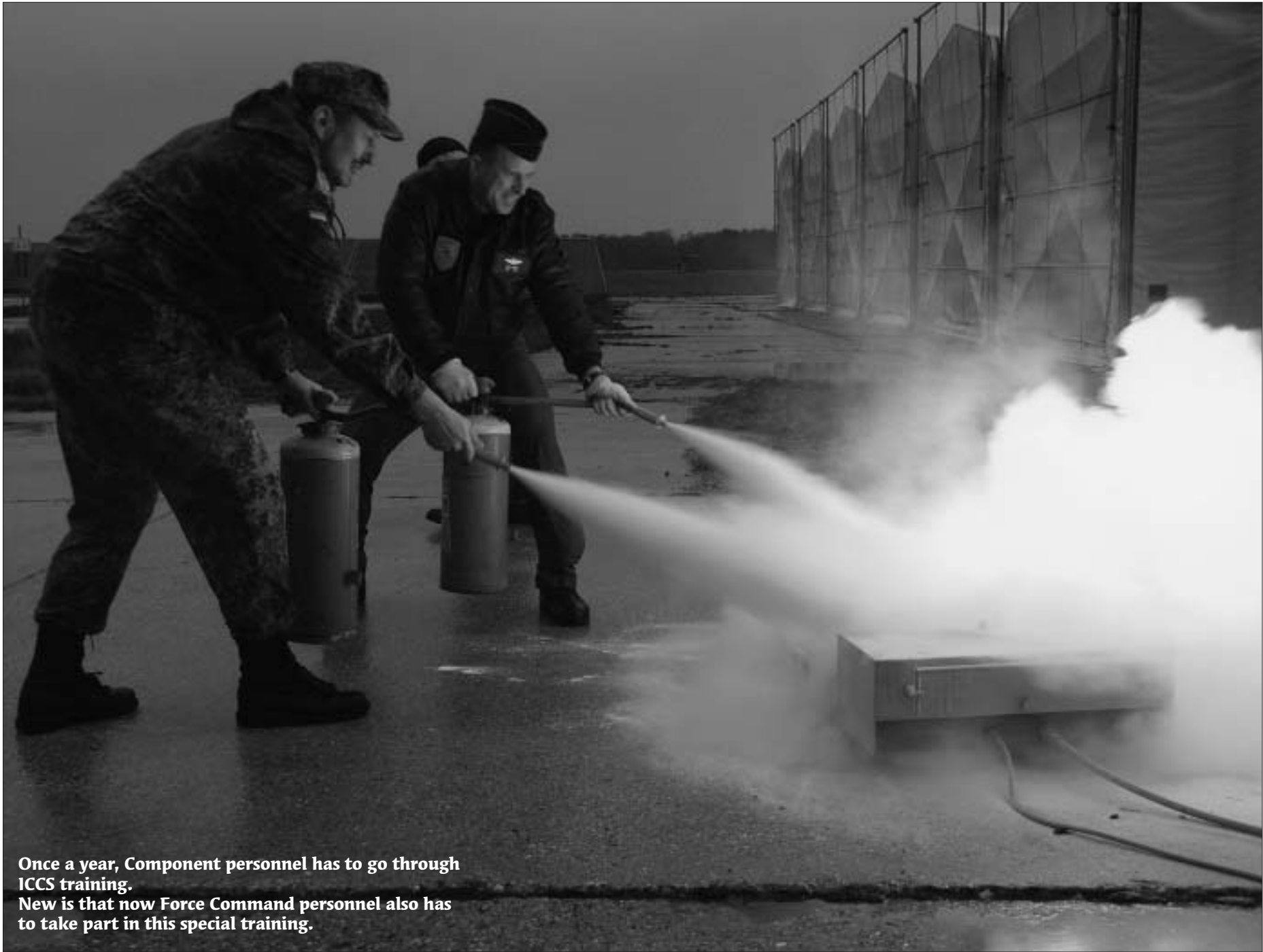
Once a year, Component personnel has to go through ICCS training. New is that now Force Command personnel also has to take part in this special training.