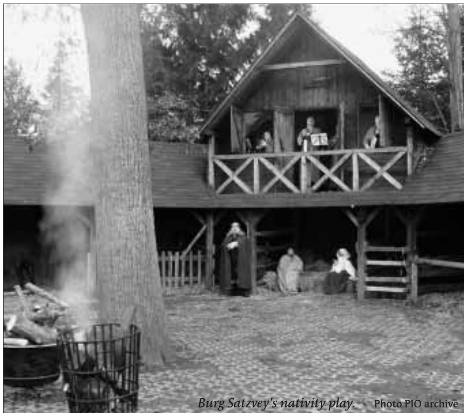
Burg Satzvey's nativity play.

Heinsberg, 22 November till 19 December, daily 1100 till 2000.