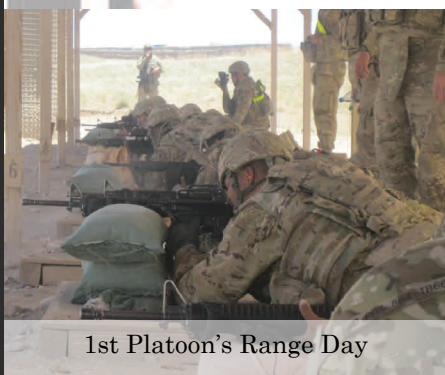
1st Platoon's Range Day

1 st Platoon recently completed the construction of a combined motorpool and construction materials storage yard. In a project with several changes while construction was ongoing, the Soldiers stayed disciplined under the guidance of the NCOs, to include two new section sergeants, and took the opportunity to get extra experience with the construction equipment. The platoon has since moved back to Sharana to prepare equipment for the next mission. They are currently readying themselves for a deconstruction project as well as training on basic Soldier skills, showcasing the flexibility that all Animal Soldiers demonstrate on a daily basis.