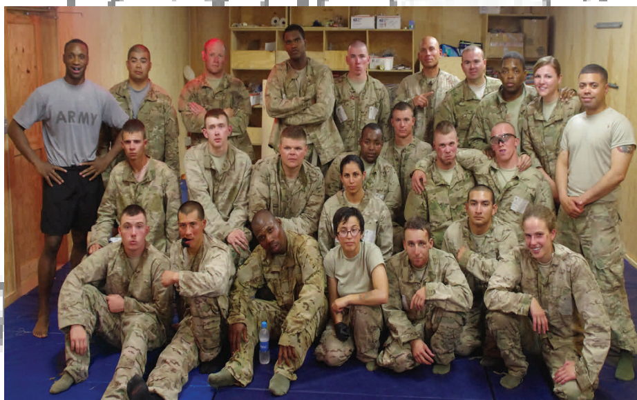
Graduates of the Combatives Level I class.