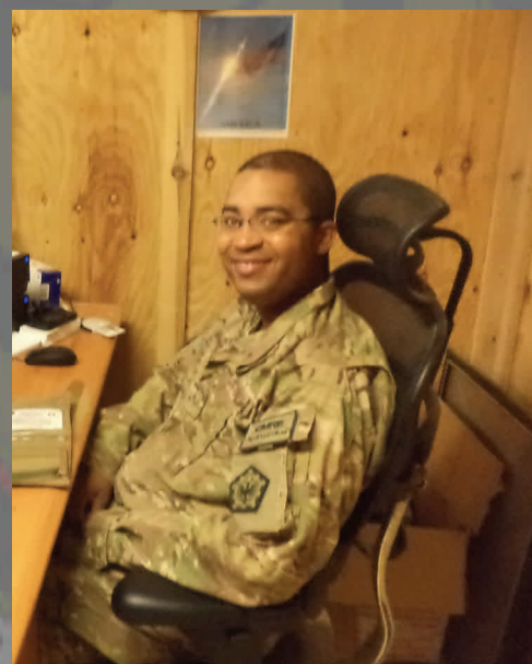
Working hard, every day.