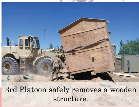
3rd Platoon safely removes a wooden structure.