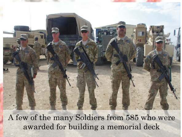
A few of the many Soldiers from 585 who were awarded for building a memorial deck