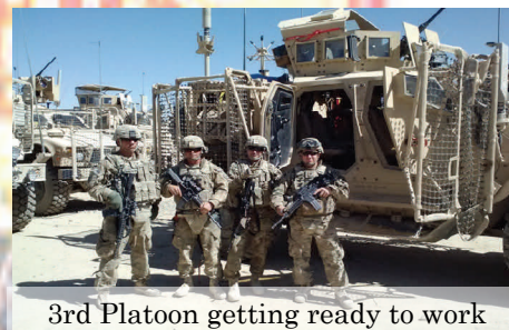
3rd Platoon getting ready to work

Over the last month the Gravediggers have been preparing to move between FOBs. As the platoon closed out deconstruction on FOB Sharana, we immediately began preparing for movement. We have been packing up all of our tools and shipping our equipment to our new base.