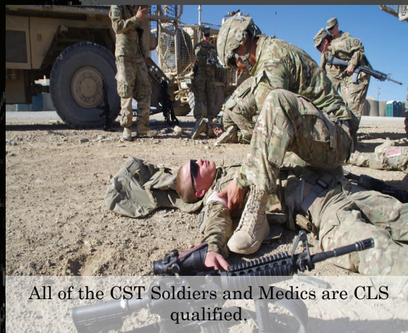
All of the CST Soldiers and Medics are CLS qualified.

Compared to the training back in the States, the major change was the training environment.