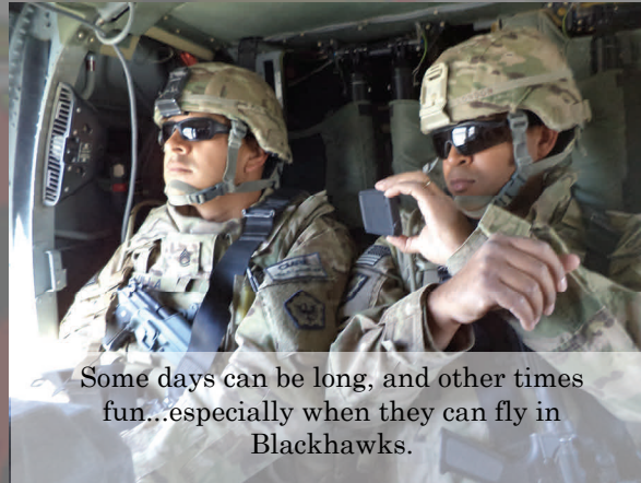
Some days can be long, and other times fun...especially when they can fly in Blackhawks.