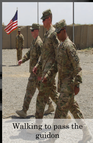
Walking to pass the guidon