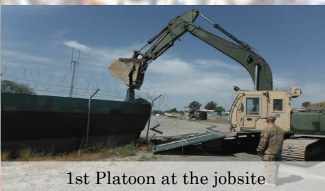
1st Platoon at the jobsite

After completing their first major deconstruction mission, 1st PLT was sent out ahead of the Company as an advanced party. 1st Platoon was in charge of making contact with the receiving unit, establish a new command post, preparing the equipment, and beginning the initial phases of the mission. Thank you very much to all the Trailblazer friends and family who have supported us so far, your encouragement has gone a long way.