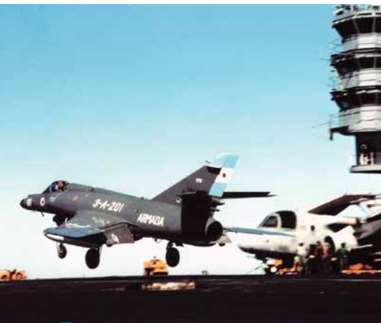
A Super Étendard aircraft of the Argentine navy takes part in touch-and-go landings on the flight deck of the nuclear-powered aircraft carrier USS Abraham Lincoln (CVN 72) in 1990.

such as Just Cause and Desert Shield/Storm, the combatant commands spent the next decade participating in a variety of small but significant military operations across the globe. For SOUTHCOM, this meant a change in focus away from Cold War contingency operations to becoming a partner with other U.S. government agencies and departments to undo the tangle of American policy initiatives dating to the end of World War II. The emphasis on counterdrug efforts continued, and the command implemented a multinational initiative to synchronize Bolivian, Colombian, Ecuadorian, Peruvian, and U.S. counterdrug operations. In 1994, Joint Interagency Task Force-South (a two-star intelligence fusion and planning operation located in Key West, Fla.) was stood up to plan, conduct, and direct interagency counterdrug operations in Latin America.