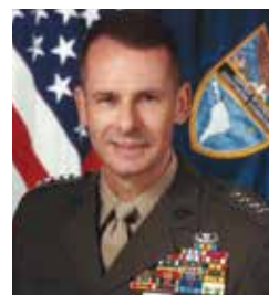
Gen. Peter Pace USMC, Sept. 2000 – Sept. 2001