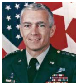
Gen. Wesley K. Clark USA, July 1996 – July 1997