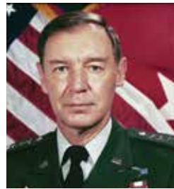
Gen. Frederick F. Woerner USA, June 1987 – July 1989