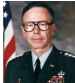
Gen. Maxwell R. Thurman USA, Sept. 1989 – Nov. 1990