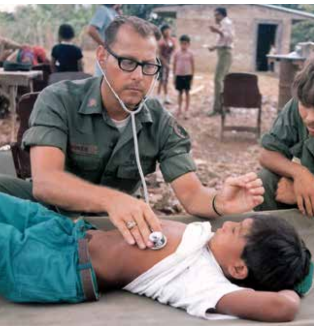
A U.S. medic examines a Panamanian boy during a medical training exercise in Panama, April 1974.

For Panama, the most notable event of the '70s was the signing of the Panama Canal Treaties by U.S. President James E. "Jimmy" Carter and Panamanian Chief of Government Gen. Omar Torrijos in 1977, which arranged for the handover of the canal to Panama in 2000. Implementation began in October 1979, but elsewhere in the region, less peaceful events were taking place. In Nicaragua, the Sandinista uprising began in July 1979, and in October, a civil war began in El Salvador between the civil-military government backed by the United States and a coalition of five leftist guerrilla groups. Around the same time, cocaine cartels began their rise in Colombia as well as in the mountainous regions of Peru and Bolivia. Peru was also combating the rise of the Sendero Luminoso (Shining Path) communist insurgency.