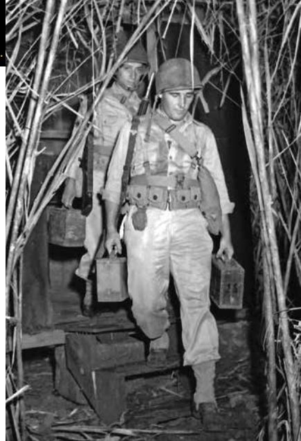
U.S. infantrymen carry ammunition to a machine gun position, Panama, October 1942.

between the country's two major cities, Quito and Guayaquil. The command airlifted 657 tons of relief supplies from the Canal Zone to Ecuador, and established an air bridge between the two cities until U.S. Army combat engineers could clear roadways and repair rail lines. Nearly a year and a half later, in September 1954, CARIBCOM evacuated victims and coordinated delivery and distribution of 50 tons of relief supplies and water purification equipment after flooding from Tropical Storm Gilda destroyed thousands of acres of banana plantations and left 3,000 homeless. In October 1954, the command, coordinating with LANTCOM, delivered