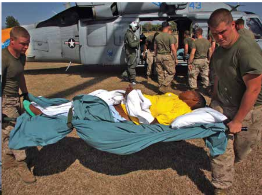
Marines and sailors of Combat Logistics Battalion 24, 24th Marine Expeditionary Unit, offload three Haitian patients from an MH-60 helicopter, Feb. 5, 2010. The patients were transported from USNS Comfort.

Much of the U.S. effort centered around training and supporting a unit of the Colombian National Police force known as Search Bloc. Search Bloc had a single mission – the elimination of Escobar and his organization – and it would be a long and bloody task to bring Escobar to justice. Specialized signals intelligence units from both the United States and Colombia had to be brought in to help hunt down Escobar, who, by this time, was on the run and only communicating via radiotelephone. On Dec. 2, 1993, Search Bloc finally ran down Escobar in a suburb of Medellín. In the gun battle that followed, Search Bloc killed Escobar and a bodyguard, bringing his bloody reign of terror to an end. Sadly, however, the death of