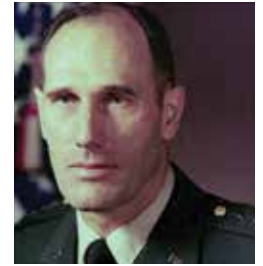
Lt. Gen. Wallace H. Nutting USA, Oct. 1979 – May 1983