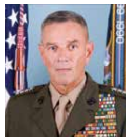
Gen. Charles E. Wilhelm USMC, Sept. 1997 – Sept. 2000