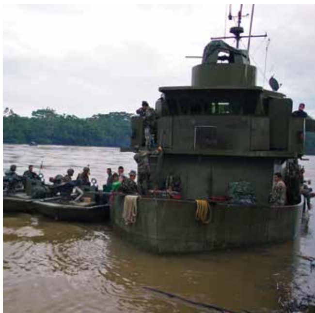
Colombian riverine operations, 1999. The U.S. government supported Colombian state-building efforts through Plan Colombia.

was now authorized not only to make available military equipment and facilities for law enforcement authorities, but also to train equipment maintenance and operation personnel.