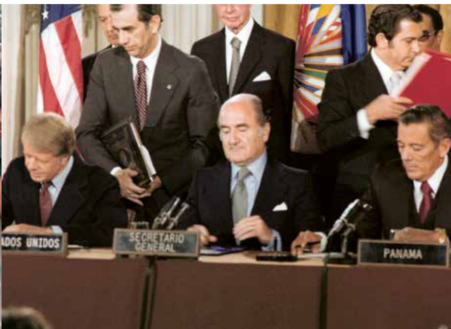
President James E. "Jimmy" Carter, Organization of American States Secretary General Alejandro Orfila, and Gen. Omar Torrijos (far right) sign the Panama Canal Treaties in Washington, D.C., September 1977.

By the early 1980s, the combined importance of these developments removed any remaining thoughts of standing down SOUTHCOM. The Reagan administration, in fact, decided early on to revitalize military