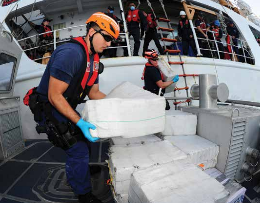
Crew members aboard the Coast Guard Cutter Valiant transfer bales of contraband to a Coast Guard Station Miami 45-foot response boat-medium crew during an at-sea transfer Feb. 19, 2013. In total, the interdiction prevented 935 pounds of cocaine with an estimated wholesale value of more than $11 million from making it to the United States.

• Joint Training/Exercises – Training exercises provide unique opportunities to “put all the pieces together” – to drive the vehicles and shoot the weapons, use the communications gear, employ the sensors, and direct all the moving parts to execute a complex plan. Multinational exercises are even more valuable, because they are an opportunity to see how other militaries perform similar missions. SOUTHCOM sponsors the UNITAS series of annual naval exercises, which, since 1960, have brought together the naval forces of Latin America and the Caribbean. Another series of exercises is PANAMAX, designed to improve the interoperability of the military and civil forces of concerned nations to assist Panama to protect and guarantee safe passage through the canal and ensure its neutrality. The Tradewinds exercises address transnational security threats in the Caribbean. The Fuerzas Comando exercises bring together SOF units from throughout the hemisphere in a demanding counterterrorism and special operations skills competition. Other exercises focus on peace-keeping, humanitarian assistance and disaster relief, and medical readiness. The Beyond the Horizon (BTH) and New Horizons (NH) programs