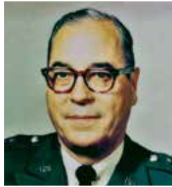
Gen. George V. Underwood USA, Sept. 1971 – Jan. 1973