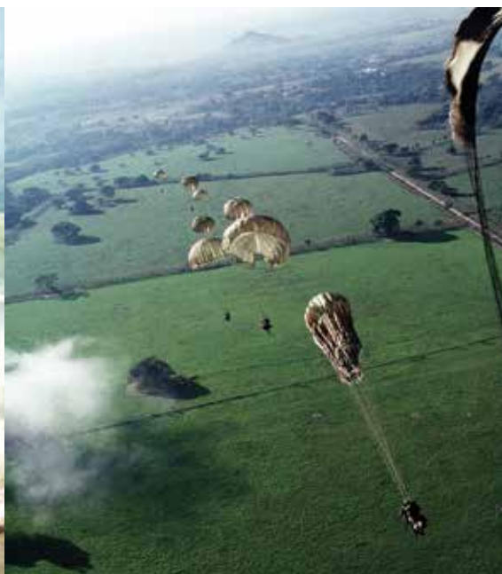
Soldiers of 1st Battalion, 509th Infantry, parachute from a C-130E Hercules aircraft into a drop zone outside the city to conduct operations in support of Operation Just Cause in Panama in 1989.

U.S. Marine Corps, and U.S. Army rapidly took over Panama. Though initially the fighting was intense, overall casualties on both sides were light. Noriega was taken into custody for trial and eventual incarceration for his drug trafficking.