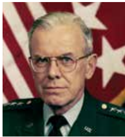
Gen. John R. Galvin USA, March 1985 – June 1987