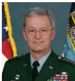
Gen. Bantz J. Craddock USA, Nov. 2004 – Oct. 2006