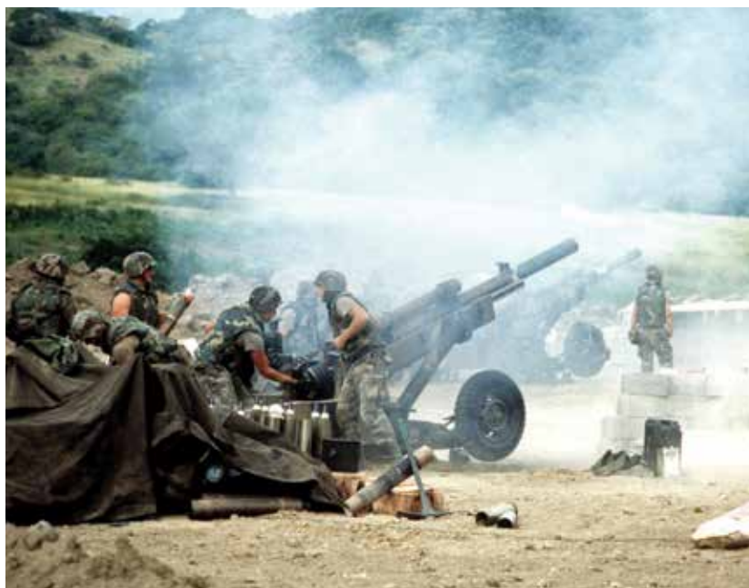
82nd Airborne artillery personnel load and fire M102 105 mm howitzers during Operation Urgent Fury in Grenada.

Taken together with failed missions such as Operation Eagle Claw (Iran, 1980) and the casualties taken from the barracks bombing in Beirut, Lebanon (1982 to 1984), these issues began by the mid-1980s to drive a movement in the Congress for reform of the Department of Defense (DoD) and the military. The result was the Goldwater-Nichols Department of Defense Reform Act (1986) and the Nunn-Cohen Amendment (1987), which reorganized the way America would go to war into the next century.