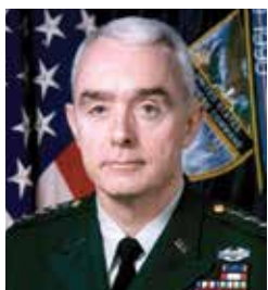
Gen. Barry R. McCaffrey USA, Feb. 1994 – Feb. 1996