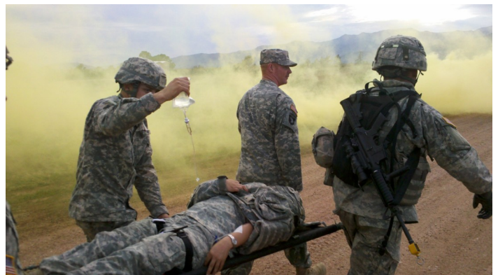
52nd Engineer Soldiers practice medical evacuation during recent training.