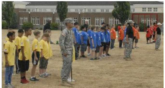
This summer's Kids Deployment Camp was a big hit with Triple Nickel Families.

As Fall arrives here in the Pacific Northwest it means many things to many people. For some they look forward to the changing of the leaves, cool nights by a warm fire, and hearty meals. For others it is the signal that football season is here which means watching the games, snacking on your favorite foods and cheering for your favorite team. For children it means that one of their