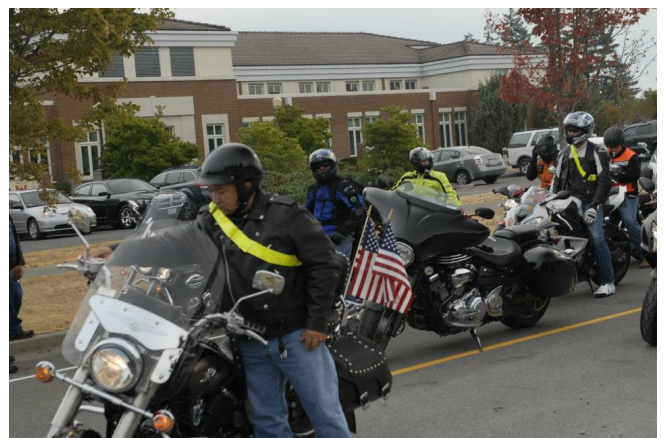
Triple Nickel Soldiers stage in front of Brigade Headquarters for the Fall Motorcycle Ride which focused on reinforcing motorcycle safety.