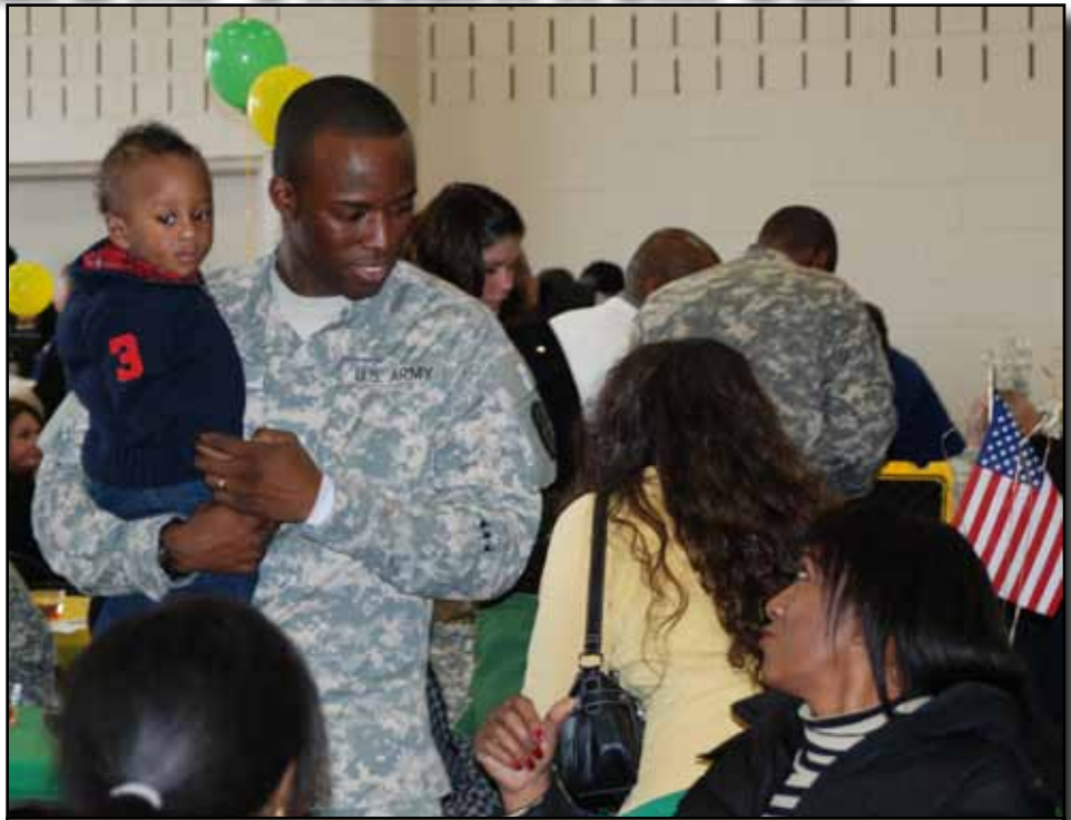
Soldiers from the 727 th Military Police Detachment and their families during the unit deployment ceremony on Nov. 27, 2011.

The New York Army National Guard currently has more than 2,000 soldiers deployed in Afghanistan and Kuwait. ✦