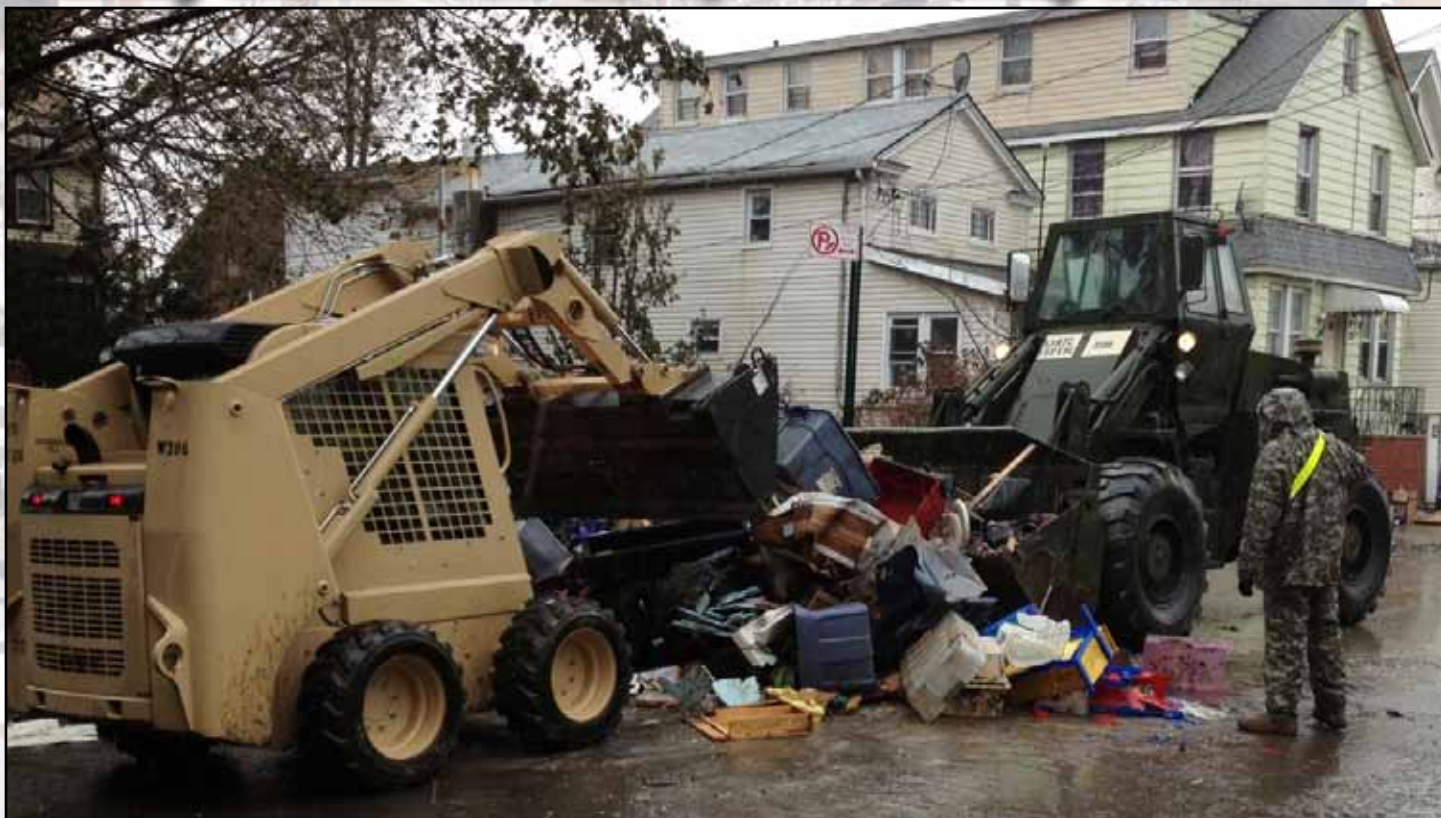
Members of the New York Army National Guard's 204 th Engineer Battalion work to clear streets in Far Rockaway on Nov. 7. The Queens community was battered by Hurricane Sandy when it hit on Oct. 30. The Guard engineer Soldiers have been working to clear debris left by the storm.