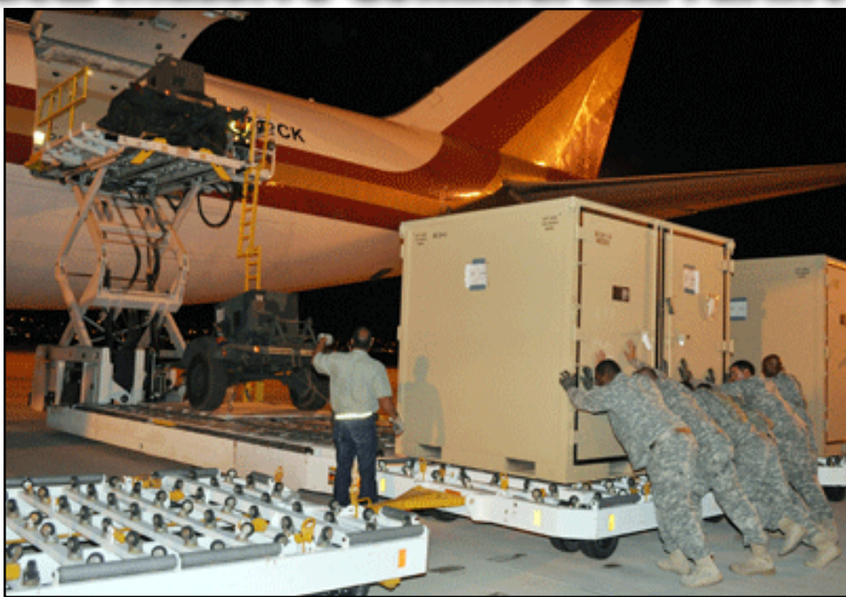
Soldiers of the 101st Expeditionary Signal Battalion work with the Fort Bliss Unit Movement Branch to load the 747 with shipping containers of communications equipment for deployment.