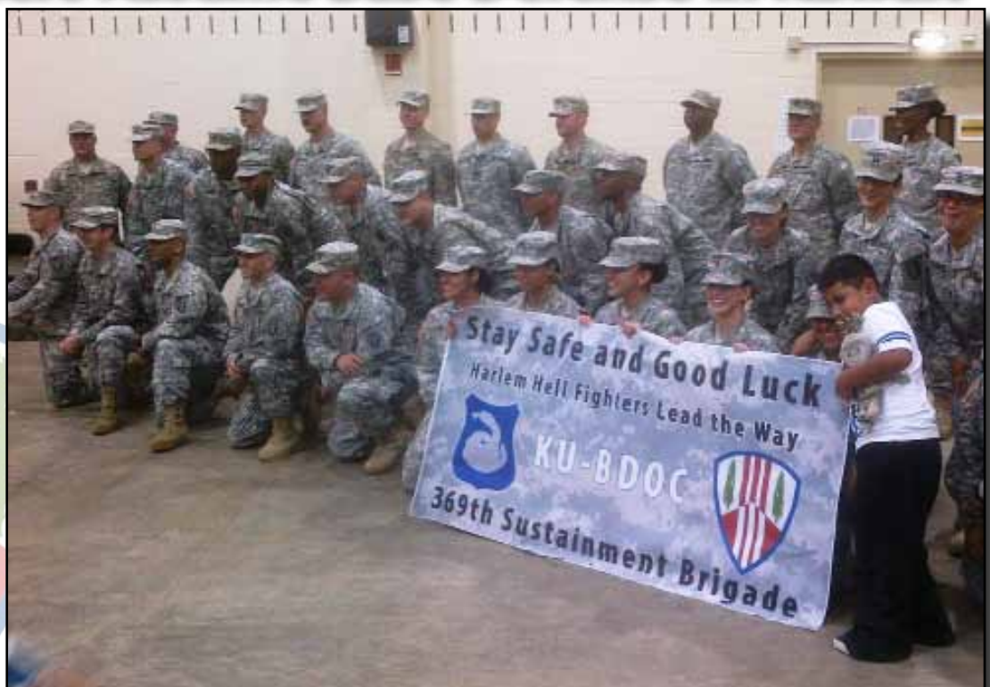
CAMP SMITH--New York Army National Guard Soldiers heading to Kuwait to man a Base Defense Operations Center pose for a photo on Monday, Oct. 8, during their farewell ceremony here. The Soldiers from the 369 th Sustainment Brigade, will be responsible for security at U.S. military facilities in Kuwait.

The New York National Guard currently has more than 2,000 Soldiers and Airmen deployed overseas, while more than 3,000 are involved in Hurricane Sandy response efforts. ✦