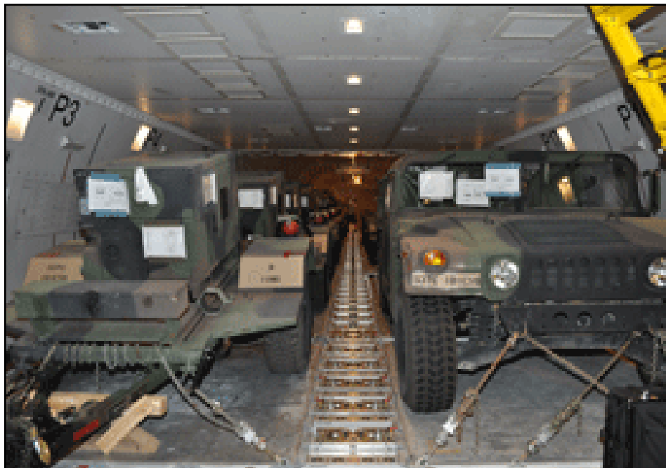
The 101st Expeditionary Signal Battalion unit movement team loads 747 cargo planes to a capacity of 180,000 pounds, including Humvees and generators to conduct a relief in place in Afghanistan.

"It is a big honor to be a part of something so big and make a difference," said Alvarez. ✦