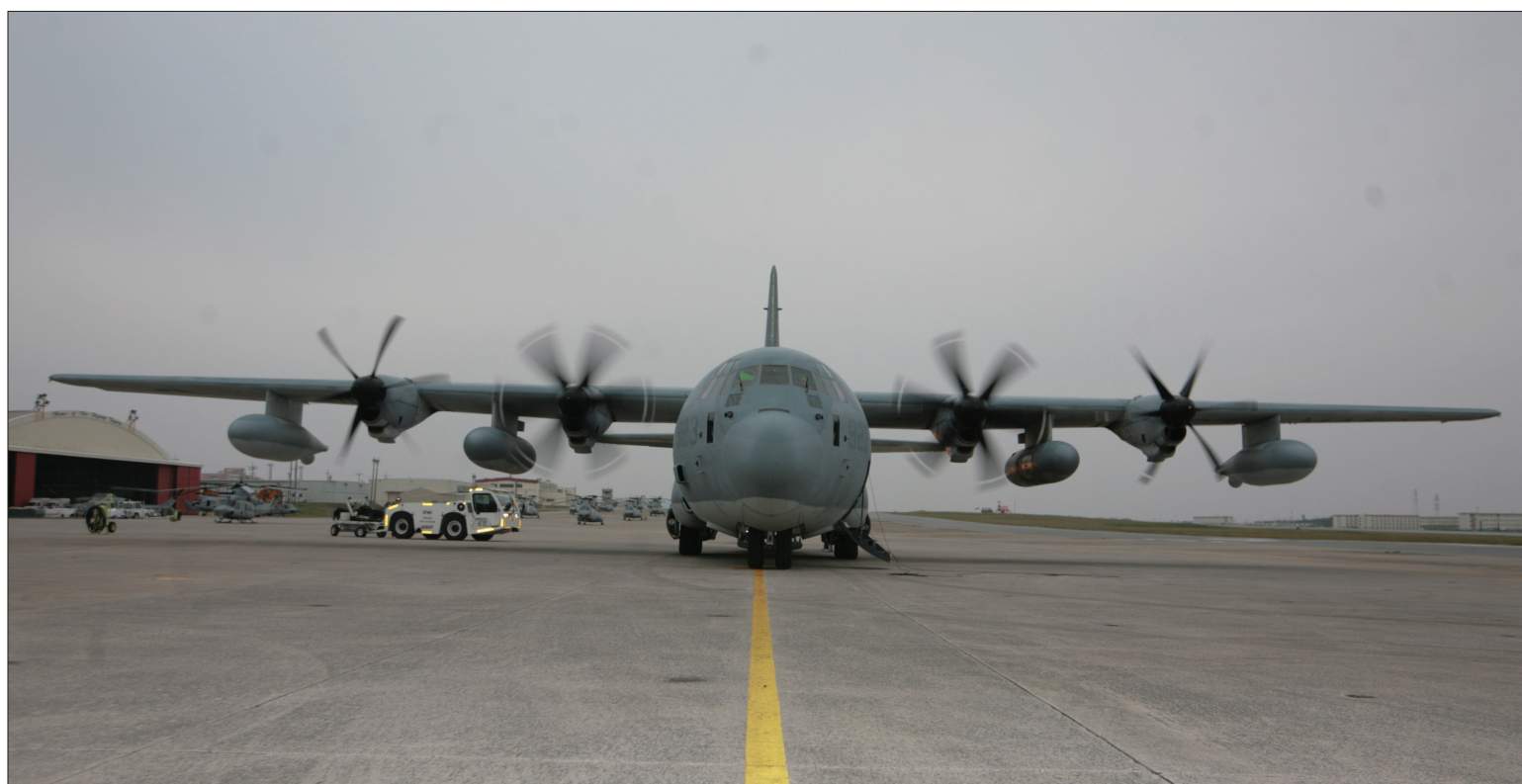
A KC-130 Hercules aircraft prepares to take off from Marine Corps Air Station Futenma, Japan, to the Republic of the Philippines on Dec. 8 to assist in disaster relief efforts in the wake of Typhoon Bopha. The aircraft provided the lift capacity and capability to transport personnel and relief supplies to affected areas. The aircraft and Marines are with Marine Aerial Refueler Transport Squadron 152, based in Okinawa, Japan.

The Philippine government and military have led the effort to help its citizens during after typhoon. The U.S. military has partnered and trained with the armed forces of the Philippines for many years in humanitarian and disaster relief operations.