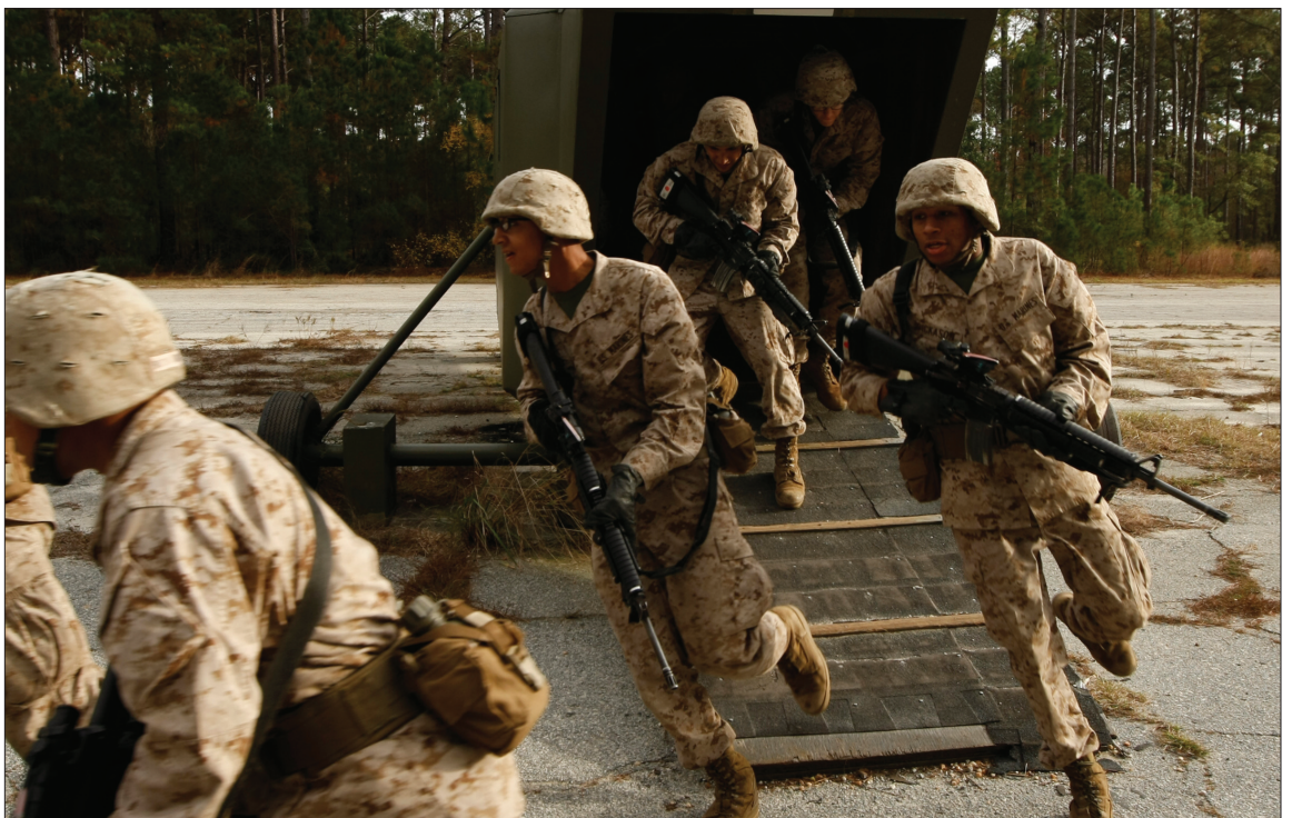
Recruits of Kilo Company, 3rd Recruit Training Battalion, sprint out of a simulated helicopter during an event of the Crucible on Dec. 6 on Parris Island. The recruits maneuvered through obstacles before crawling through a simulated battlefield. Kilo Company is scheduled to graduate today.