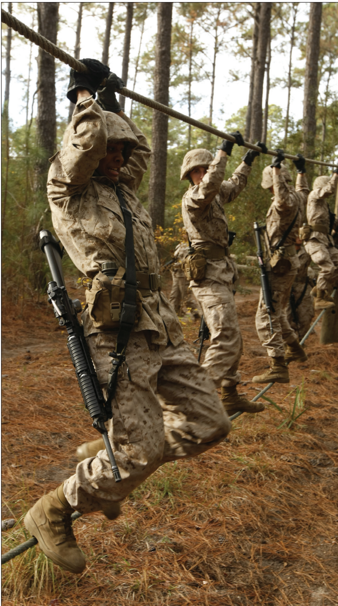
Recruits of Kilo Company, 3rd Recruit Training Battalion, make their way across a rope bridge obstacle during the Crucible at Parris Island's combat training area Dec. 6. The recruits faced a number of obstacles during the Crucible that are designed to test their mental and physical stamina, teamwork and overall development as recruits. At the end of the Crucible, recruits are awarded the Eagle, Globe and Anchor and the title of U.S. Marine.