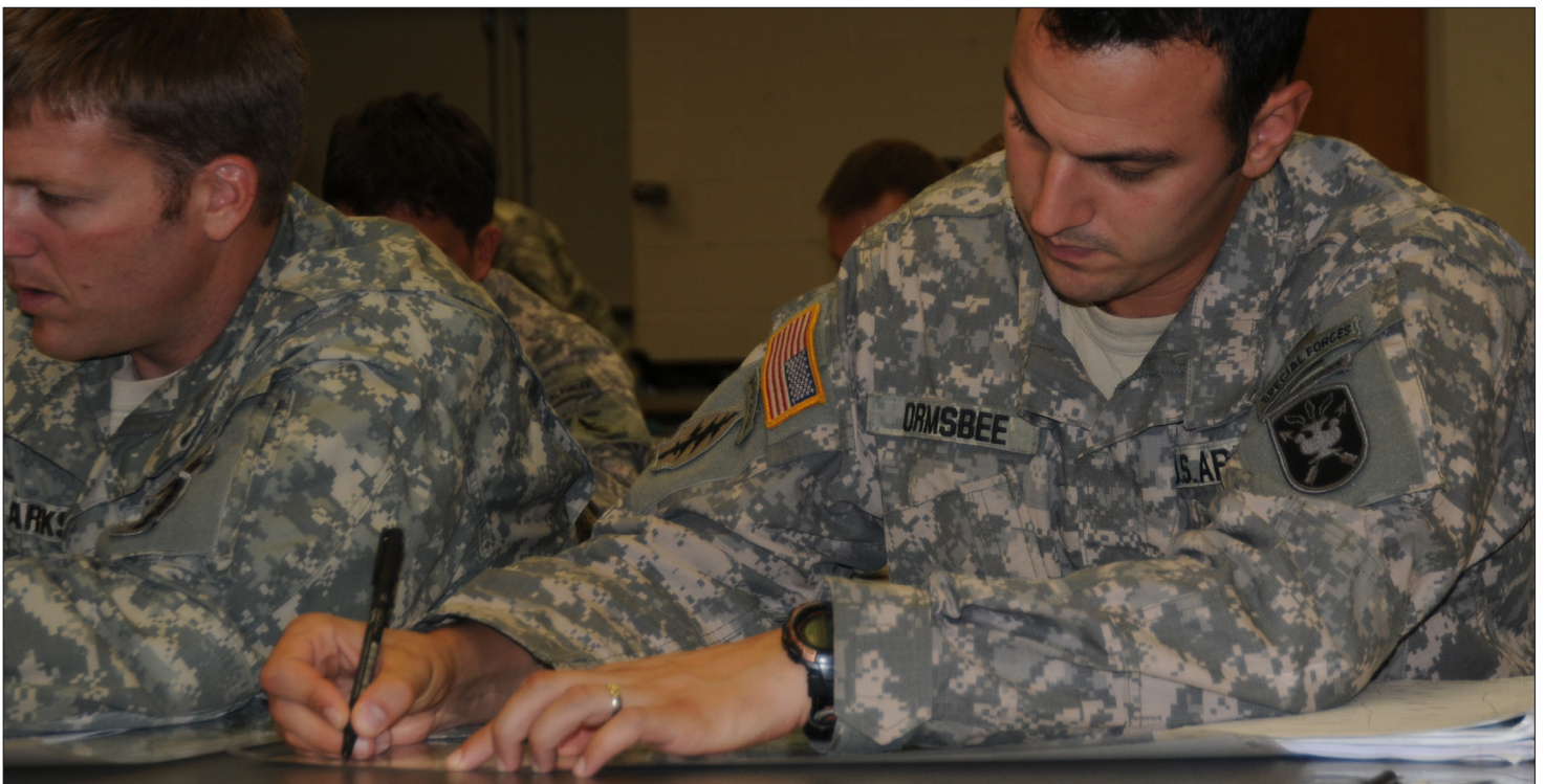
A SWCS student is tested on map-reading skills in a classroom in Bank Hall on Fort Bragg, N.C. Special-operations Soldiers from units throughout the U.S. Army Special Operations Command will enjoy a simpler, more stream-lined place to find all relevant information about upcoming SWCS courses in the soon-to-come SWCS course catalog, like those used by most colleges and universities.

New course catalog will help units plan Soldiers' education