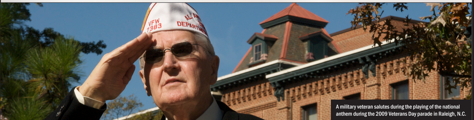
A military veteran salutes during the playing of the national anthem during the 2009 Veterans Day parade in Raleigh, N.C.