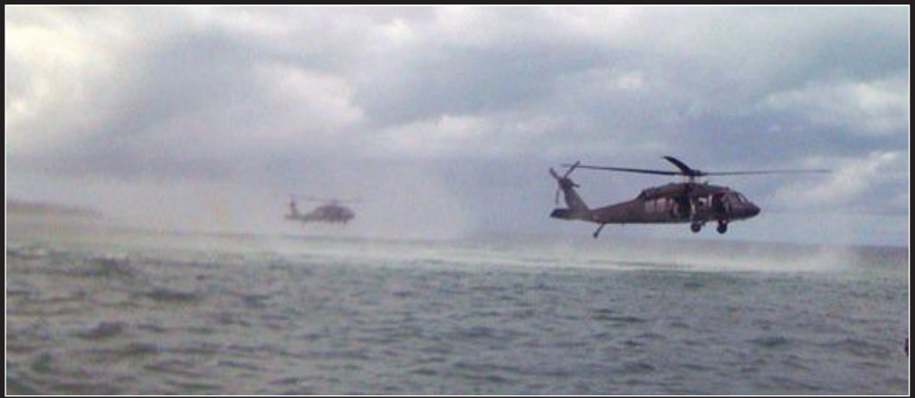
Combat Diver Qualification Course students leap into the water from Florida National Guard Blackhawks this afternoon off the coast of Key West, Fla. The students are in their fifth out of six weeks of training in a variety of underwater tactics and infiltration.