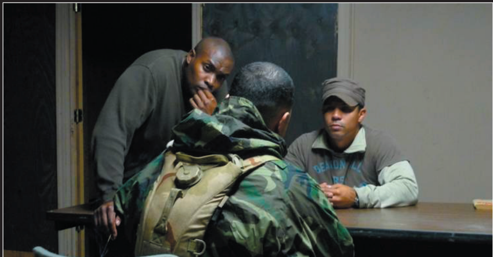
An Army Soldier discusses a condolence payment with a role player representing a village's leadership, of which the conversation keeps getting derailed on other subjects, such as water, food and security. During the the new Civil Affairs and Military Information Support Assessment and Selection program, potential ARSOF Soldiers participate in adaptive thinking events, which measure their negotiation skills and ability to maintain composure in a dynamic environment.

1st Battalion remains dedicated to and fully prepared to meet our training outcome and objective: to produce an adaptive problem-solver and critical thinker who understands his operational environment, is MOS and language qualified, physically fit, tactically and technically proficient, culturally attuned and able to build rapport and influence people, and able to successfully execute core and supporting missions, either unilaterally or through/with indigent forces, in permissive and/or hostile environments.