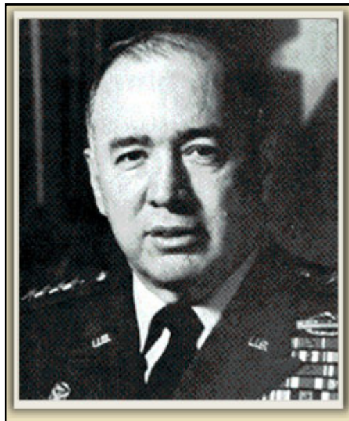
Gen. Richard E. Cavazos First Hispanic four star general

Cavazos early support for the National Training Center and his involvement in the development of the Battle Command Training Program enormously influenced and advanced the Army's war fighting capabilities.