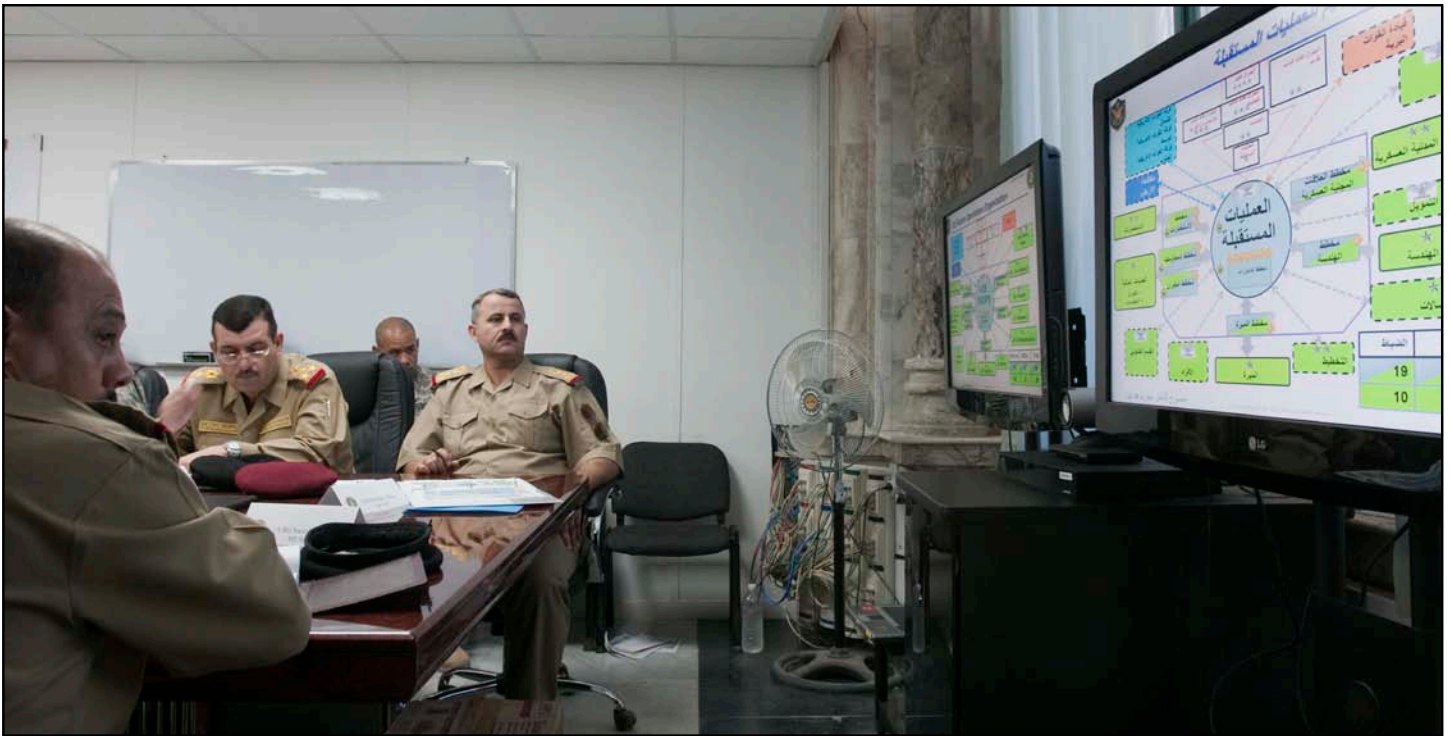
Planners from Iraq's ministry of defense read a slide that depicts the organization of United States Forces-Iraq's future operations planning section during a Sept. 15 meeting between USF-I J35 future operations planners, Iraqi Ground Forces Command planners and planners for the Ministry of Defense.