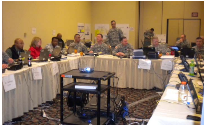
U.S. Army North personnel work with Soldiers from ARNORTH’s Region V Defense Coordinating Element during the DCE’s certification exercise Jan. 26-30 in Springfield, Ill.