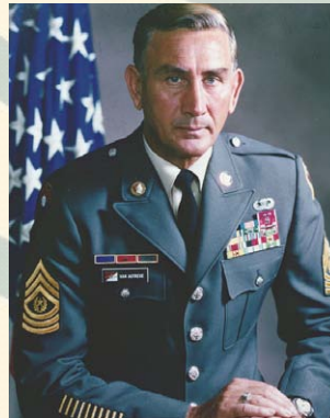
4th Former Sergeant Major of the Army, Leon L. Van Autreve. July 1973 - June 1975. Leon L. Van Autreve was sworn in on July 1, 1973 and served until his term ended in June of 1975.