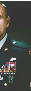
Former Sergeant Major of the Army, [Name].