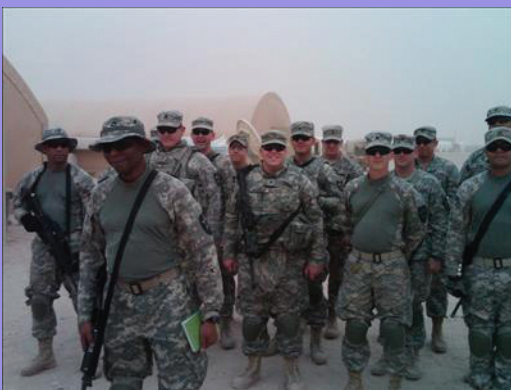
(Below) Soldiers with 1st Battalion, 38th Infantry Regiment wait for a training session in Kuwait on Sept. 20.