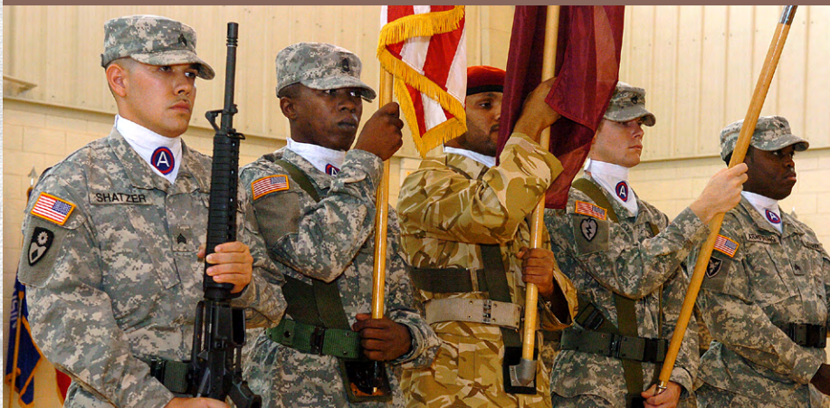
A multi-national color guard presents the national ensigns of the United States and Qatar during an Area Support Group Qatar change of command ceremony at Camp As Sayliyah on July 19. Qatari officials, from the host nation, included Maj. Gen. Hamad bin Ali Al Attiyah, Qatar Armed Forces Chief of Staff, and Maj. Gen. Thamer Al Mehshadi, Inspector General and Commander of Qatar Military Police. Qatar is an Islamic state located on Saudi Arabia's eastern coast; a local national recited a passage from the Koran, the holy book of Islam.