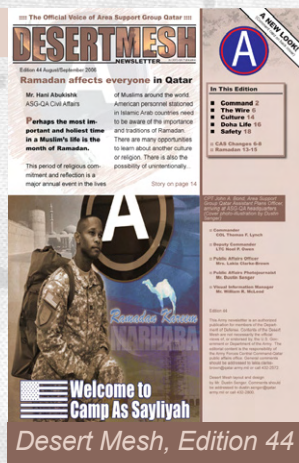
Desert Mesh, Edition 44