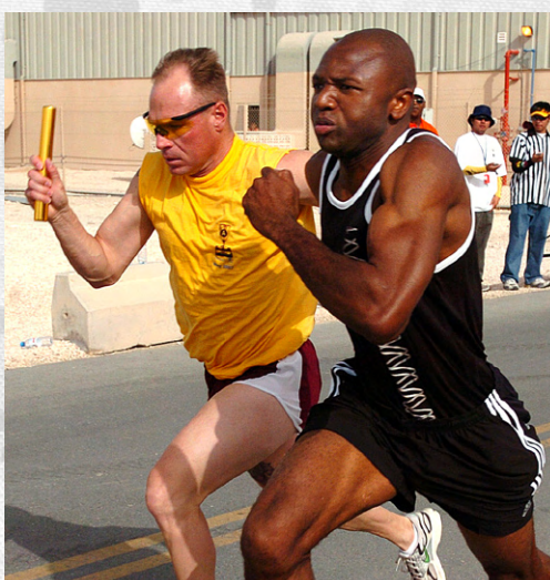
Camp As Sayliyah service members sprint during a relay on May 5 in Qatar. Heat and humidity during Qatar's peak summer months limits outdoor activities.