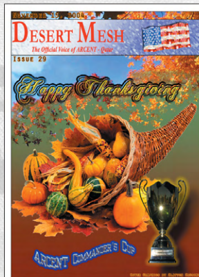
Desert Mesh, Edition 29

The newsletter was specifically driven toward the internal audience of Camp As Sayliyah. It focused on shows and events sponsored by Morale, Welfare and Recreation events, as well as the Rest and Recuperation Pass Program.