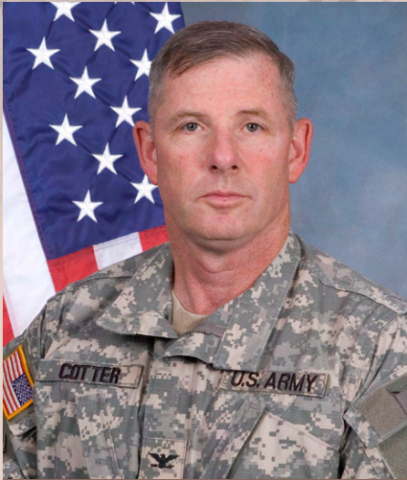
A message from the Installation Commander