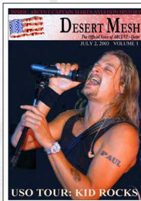
Desert Mesh, Edition 1

Formally known as The Mesh , the publication was provided by the U.S. Central Command Public Affairs Office in Qatar. It was eventually delegated to the ASG-QA – then Army Central Command (ARCENT) – Public Affairs Office in 2003. The newsletter earned a new name after a voting contest was offered to Camp As Sayliyah residents.