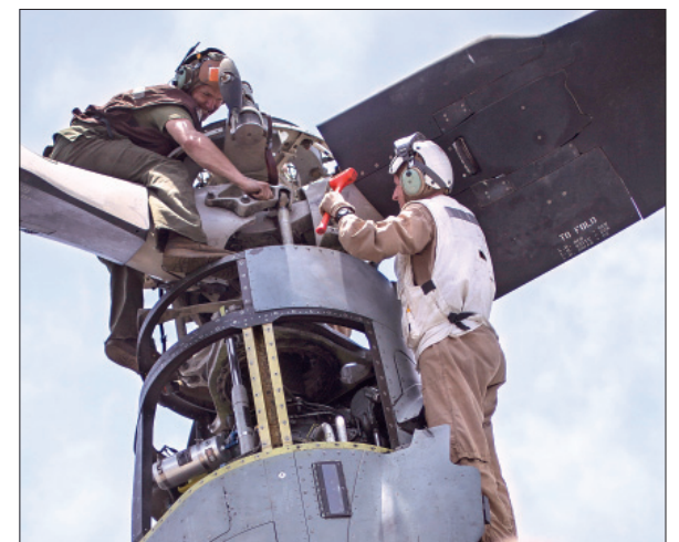
Marines prepare to dismantle the rotor of a MV-22 Osprey on the flight deck of the USS Kearsarge May 4.