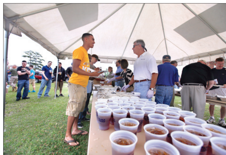
Marines and Sailors fill their plates with free chicken.