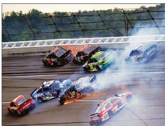
Twelve drivers were collected in this crash during the Aaron's 499 at Talladega.

Edwards, even in his disappointment, offered his congratulations