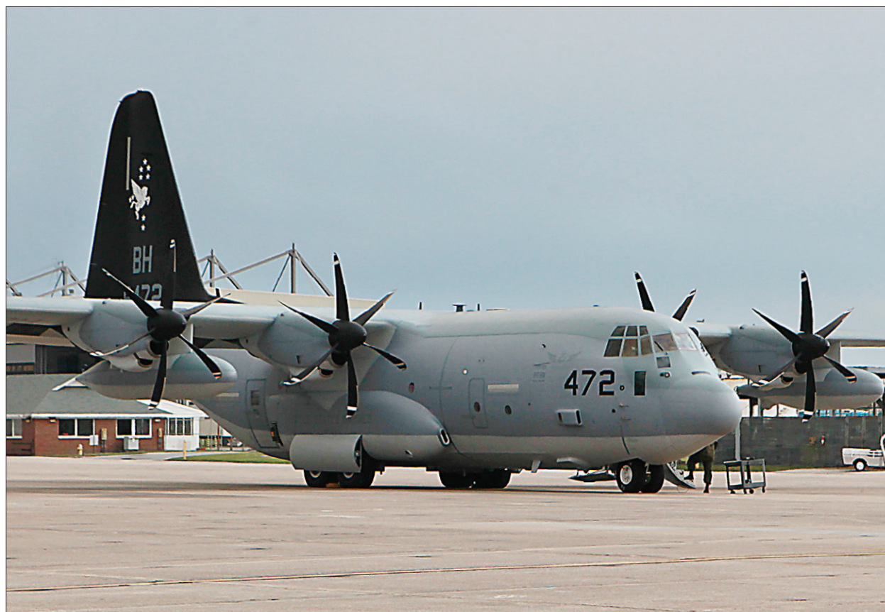
A KC-130J Hercules with Marine Aerial Refueler Transport Squadron 252 is parked on the Cherry Point flight line May 7.