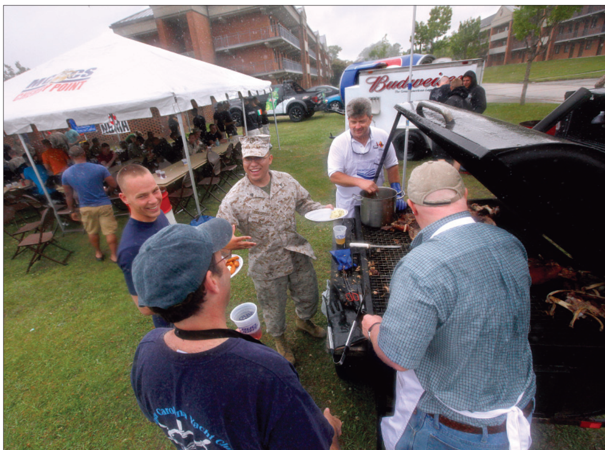
Attendees of the Spring Chicken Pickin' brave the sudden rain showers.