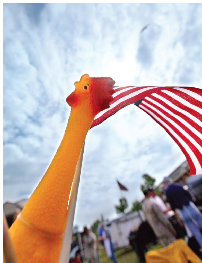
A rubber chicken decorates the Spring Chicken Pickin'.