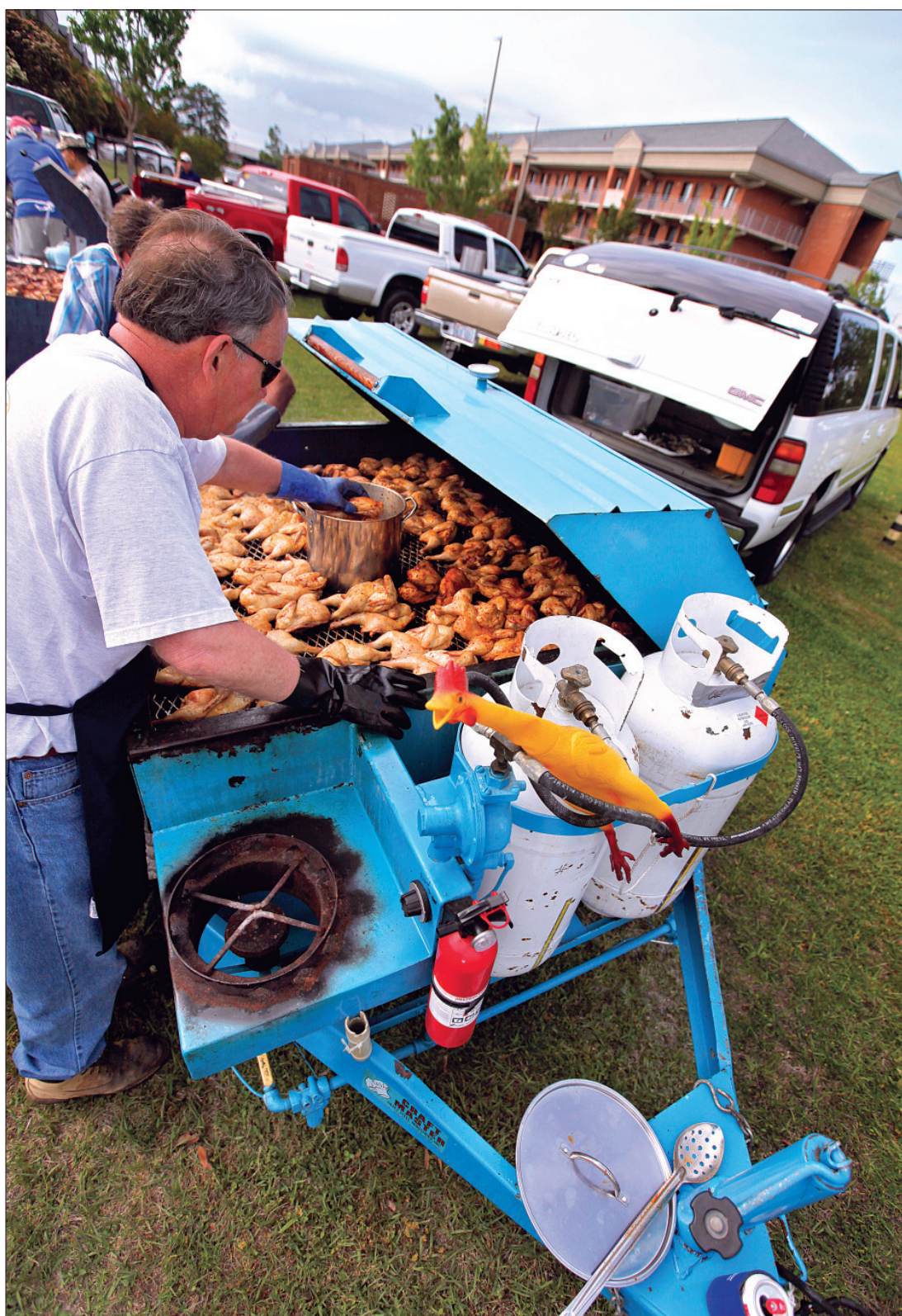
A New Bern Military Alliance Committee member prepares a full grill of chicken for Marines and Sailors.

The weather was sunny and warm at the event's outset, but a change in winds and sudden rain showers scattered many patrons and forced more under shelters. Like true Marines, those who weren't too "chicken" stayed to play beanbag toss and get second, third and even fourth helpings.