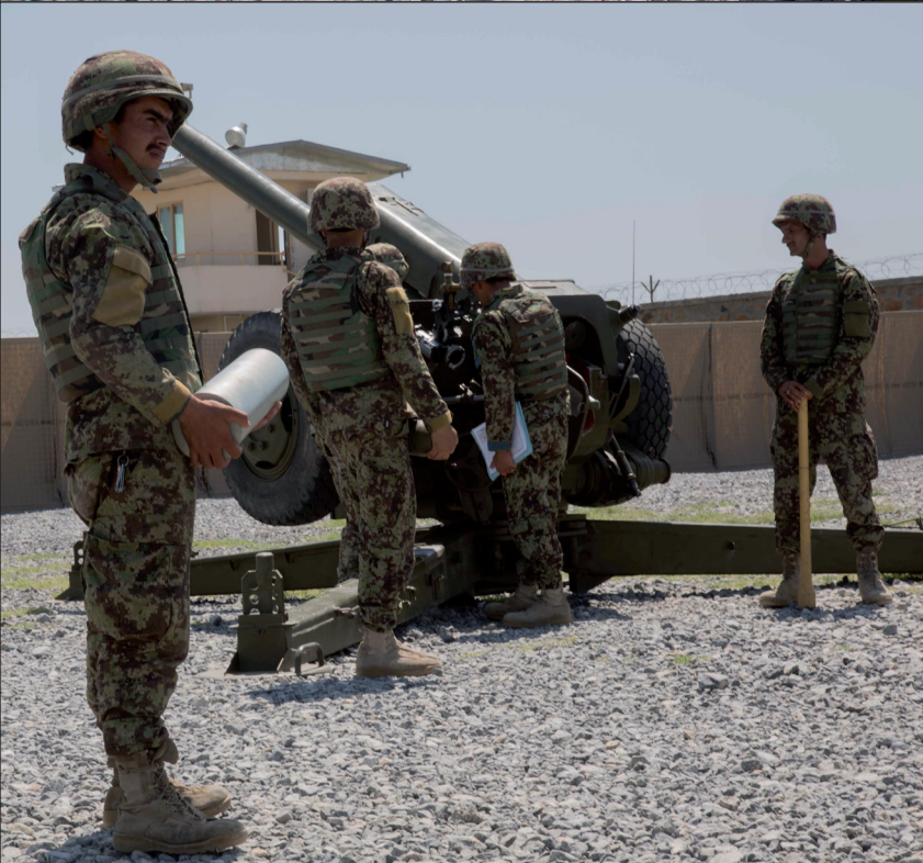
An Afghan National Army soldier with the 201st Corps prepares to load a D-30 howitzer, during a live fire field artillery exercise April 18, 2013, at Forward Operating Base Shinwar in Nangarhar Province. The ANA soldiers were evaluated by U.S. Soldiers assigned to the 5th Battalion, 82nd Field Artillery Regiment, 4th Brigade Combat Team, 1st Cavalry Division, based out of Fort Hood, Texas.