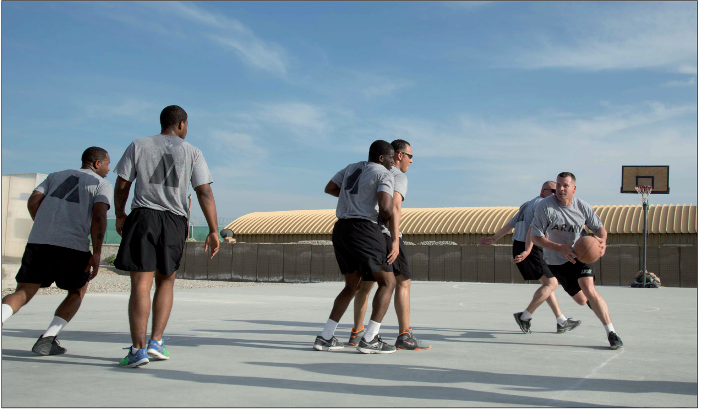
Soldiers play an early morning game of 5-on-5 on the outdoor basketball court at Forward Operating Base Gamberi. All are assigned to 4th Brigade Combat Team, 1st Cavalry Division, based out of Fort Hood, Texas.