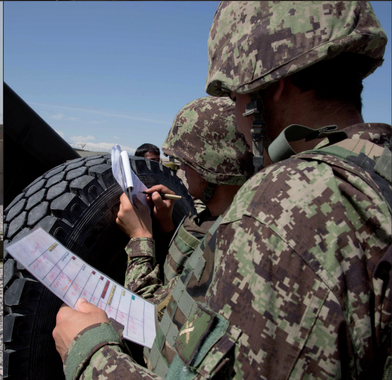
Afghan National Army soldiers with the 201st Corps write down coordinates, for a D-30 howitzer target area, given from forward observers during a live fire field artillery exercise, April 18, 2013, at Forward Operating Base Shinwar in Nangarhar province. ANA soldiers were evaluated by U.S. Soldiers assigned to 5th Battalion, 82nd Field Artillery Regiment, 4th Brigade Combat Team, 1st Cavalry Division, based out of Fort Hood, Texas.