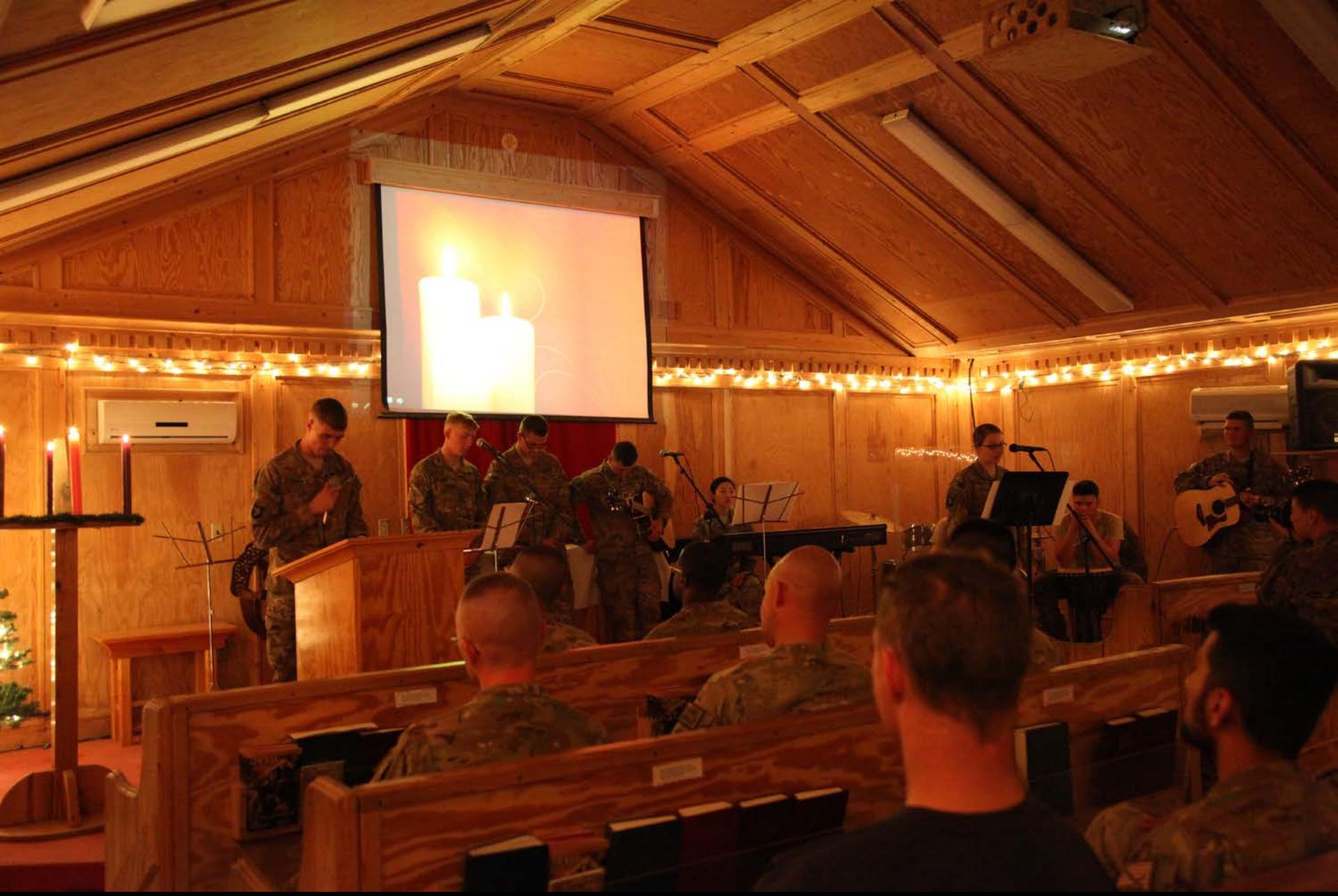
U.S. Army Soldiers and civilian contractors, assigned to Task Force 3/101, gather for worship during the Christmas Eve candlelight service at the chapel on Forward Operating Base Salerno, Khowst province, Afghanistan, Dec. 24, 2012.