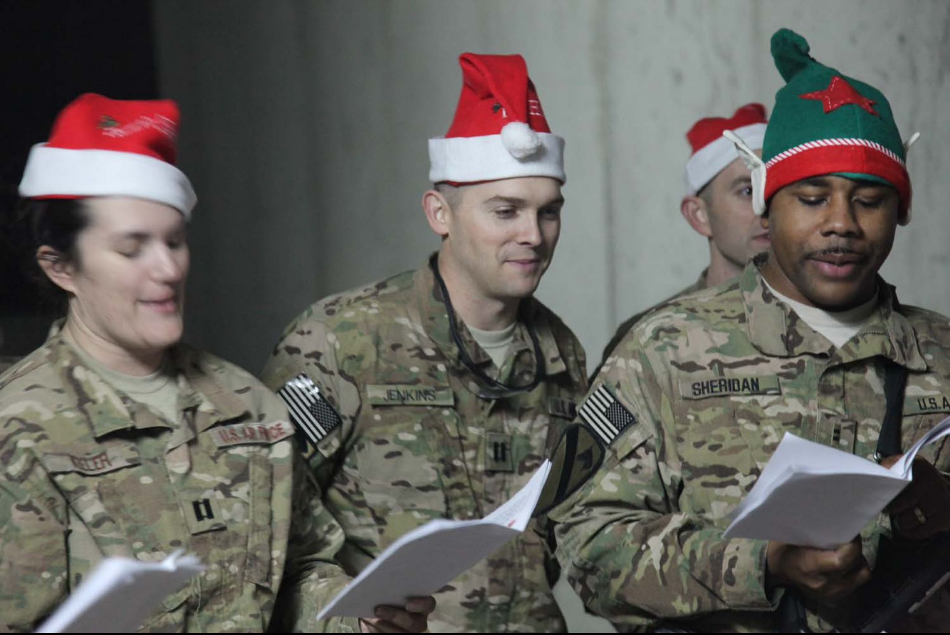
U.S. Soldiers with 4th Brigade, 1st Cavalry Division sing Christmas carols on Forward Operating Base Gamberi, Laghman province, Afghanistan, Dec. 24, 2012. The Soldiers are singing to Soldiers going into an Army dining facility.