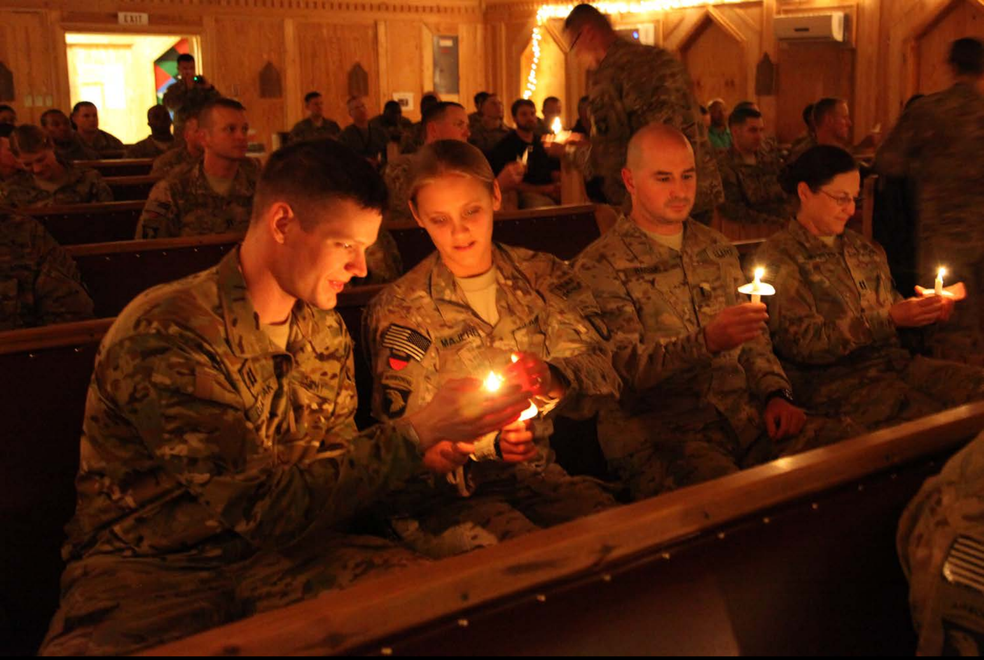
U.S. Army Soldiers and civilian contractors, assigned to Task Force 3/101, gather for worship during the Christmas Eve candlelight service at the chapel on Forward Operating Base Salerno, Khowst province, Afghanistan, Dec. 24, 2012.