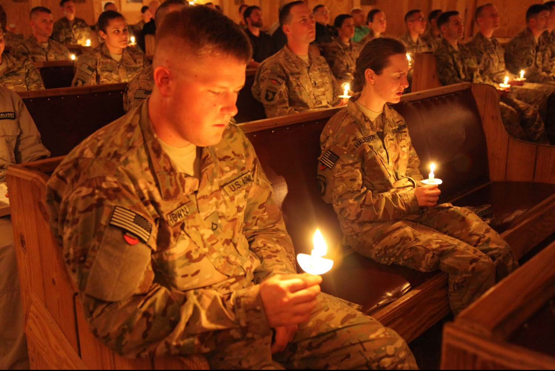
U.S. Army Soldiers and civilian contractors, assigned to Task Force 3/101, gather for worship during the Christmas Eve candlelight service at the chapel on Forward Operating Base Salerno, Khowst province, Afghanistan, Dec. 24, 2012.