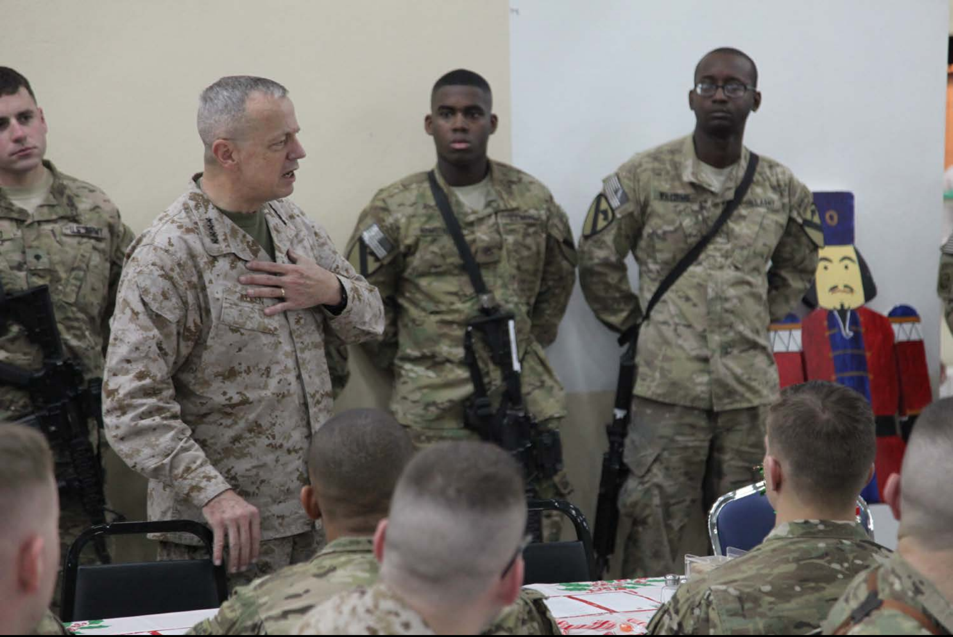
U.S. Marine Gen. John Allen, International Security Assistance Force Commander, arrives on Forward Operating Base Gamberi, Laghman province, Afghanistan, Dec. 25, 2012. The General is visiting FOB Gamberi to spend lunch with the troops.