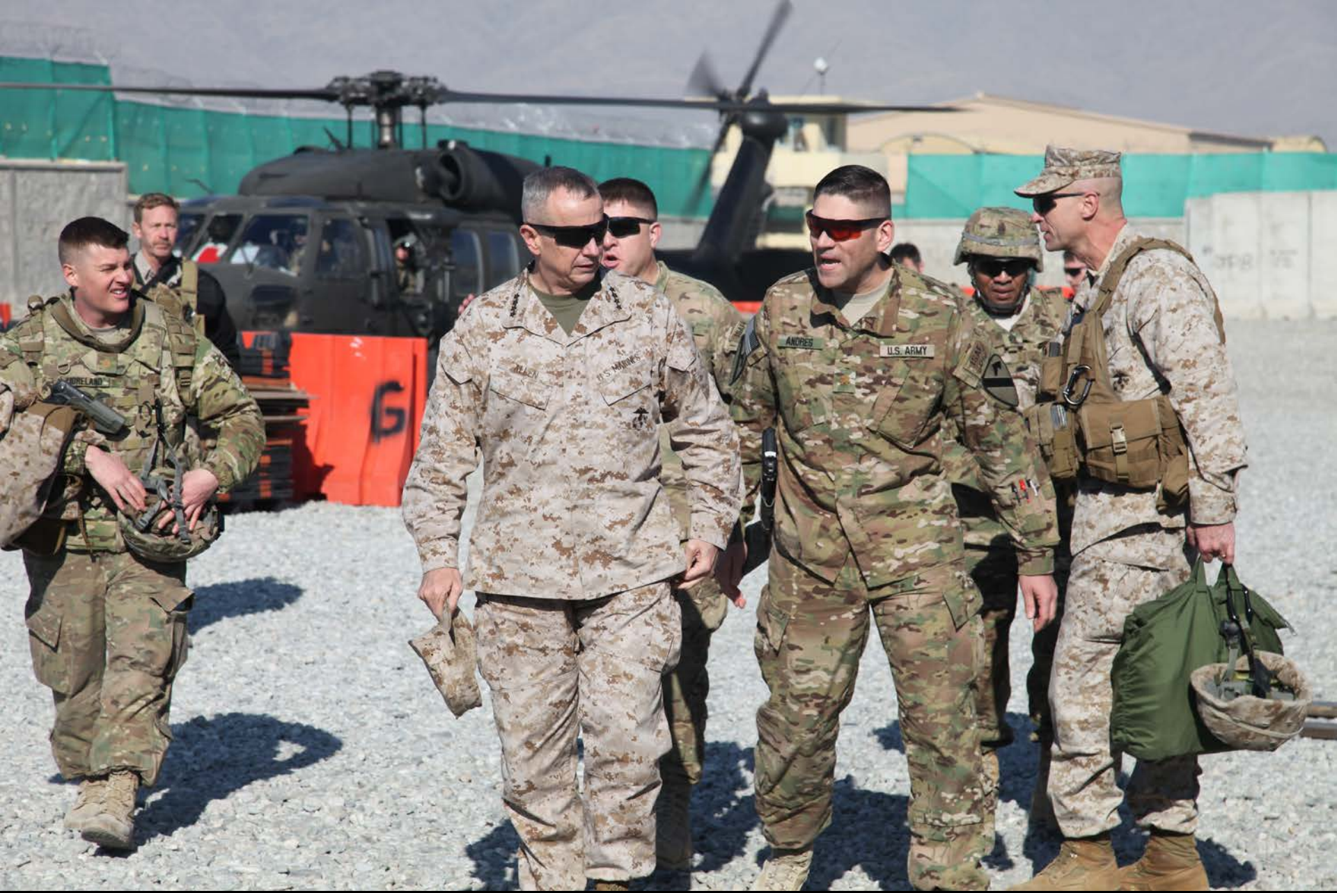
U.S. Marine Gen. John Allen, International Security Assistance Force Commander, arrives on Forward Operating Base Gamberi, Laghman province, Afghanistan, Dec. 25, 2012. The General is visiting FOB Gamberi to spend lunch with the troops.