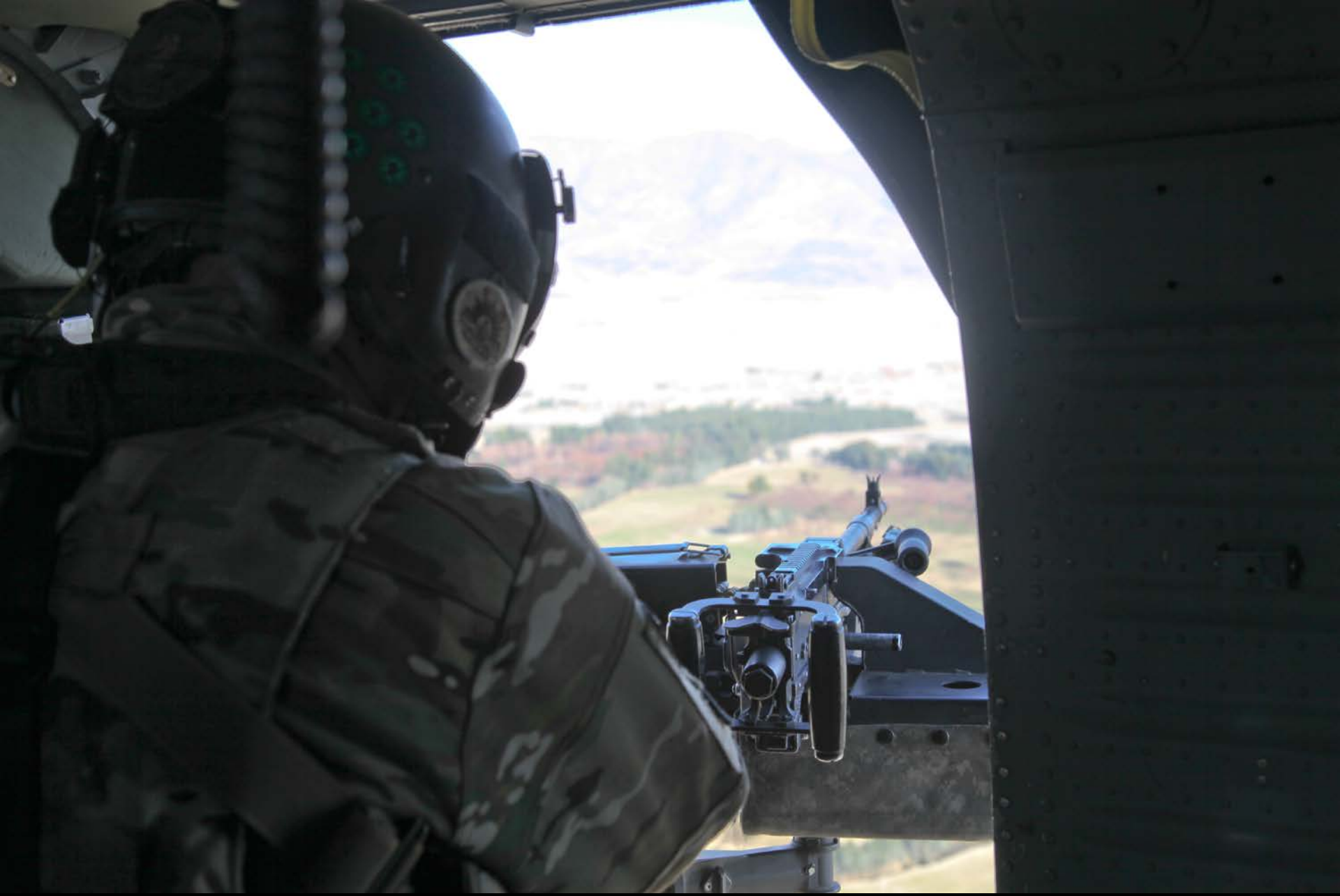
A U.S. Soldier with B Company, 5th Battalion, 101st Aviation Regiment, provides security for a UH-60 helicopter over Laghman province, Afghanistan, Dec. 23, 2012. The soldier provides security for the helicopter while in flight.