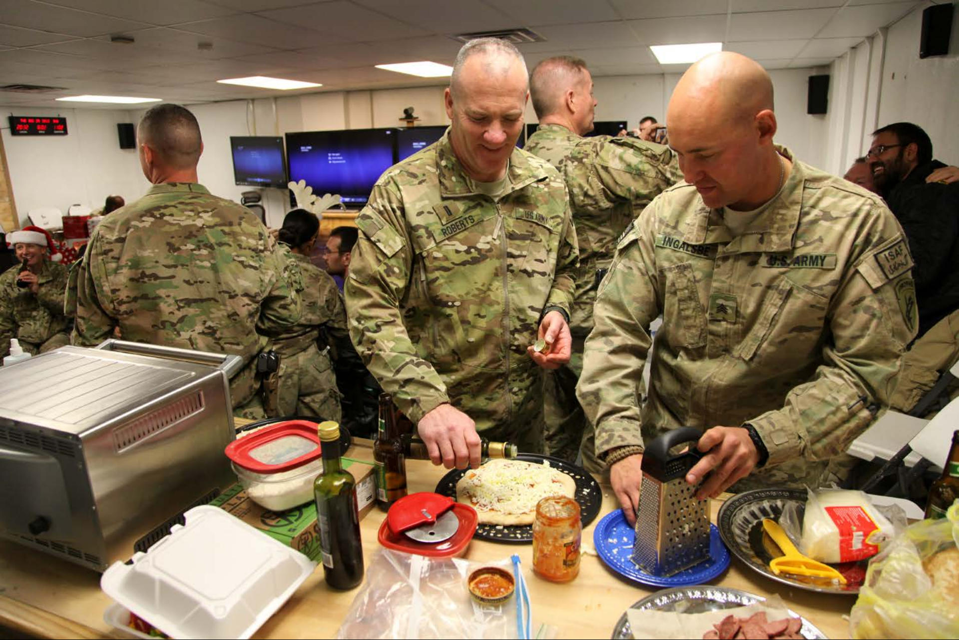
U.S. Army Soldiers and civilian contractors, assigned to Task Force 3/101, make homemade pizza at a Christmas party on Forward Operating Base Salerno, Khowst province, Afghanistan, Dec. 25, 2012. Even though work did not stop on Christmas Day many were able to take a few minutes to enjoy the holiday.