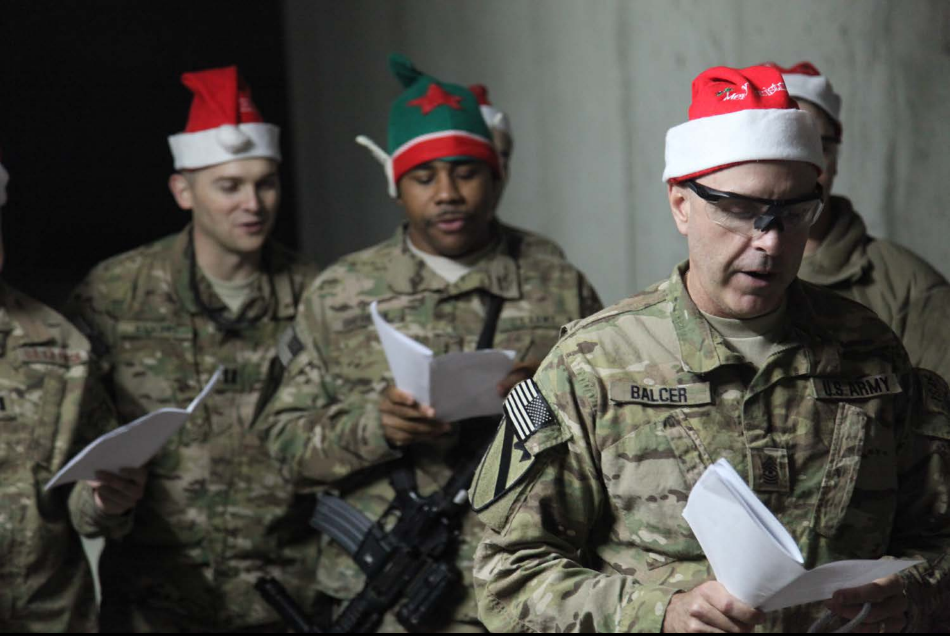
U.S. Soldiers with 4th Brigade, 1st Cavalry Division sing Christmas carols on Forward Operating Base Gamberi, Laghman province, Afghanistan, Dec. 24, 2012. The Soldiers are singing to Soldiers going into an Army dining facility.