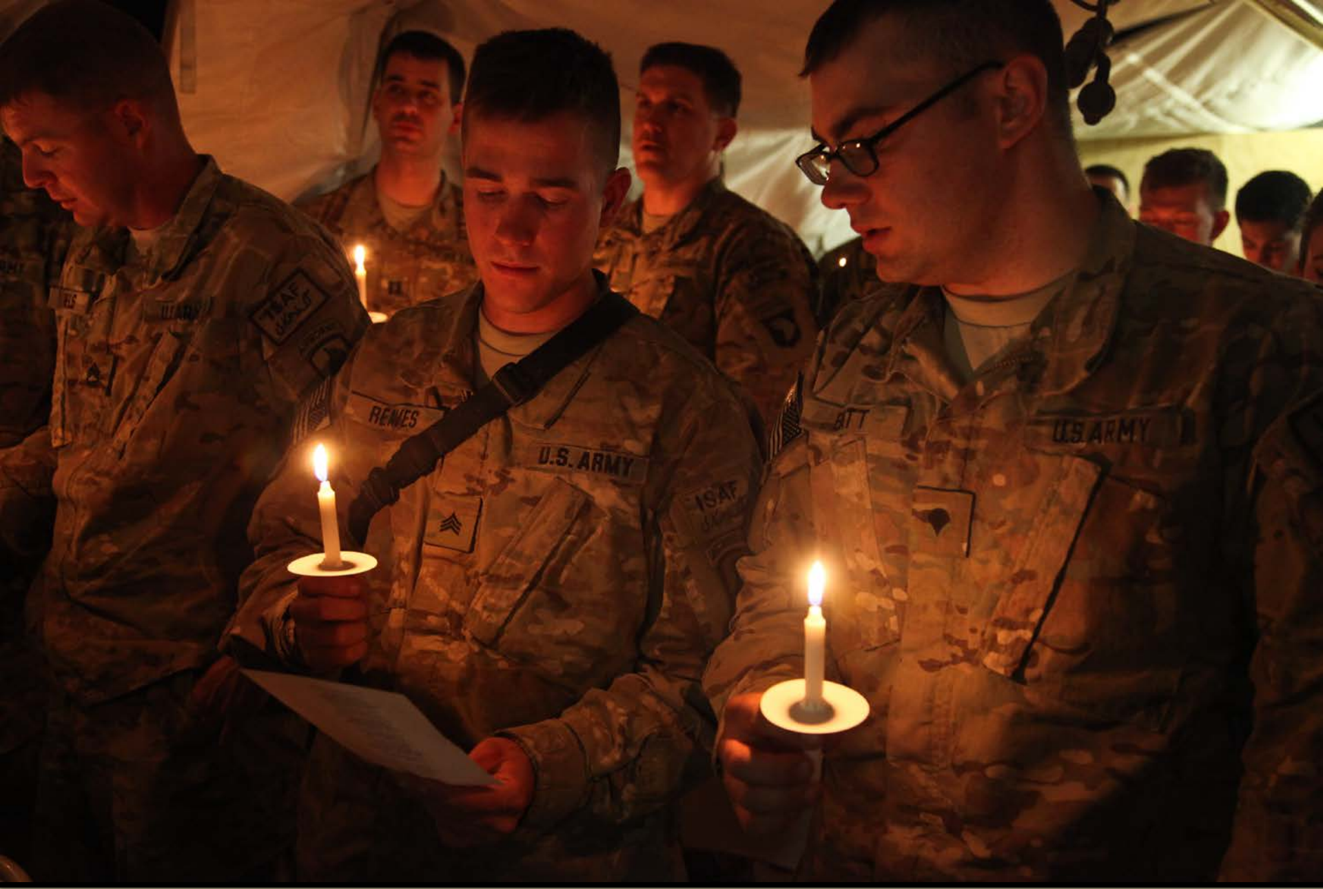
U.S. Army Soldiers hold candles while singing during a Christmas Cantata in Saint Michael's Chapel, Forward Operating Base Shank, Logar province, Afghanistan, Dec. 22, 2012. Soldiers prayed and sang Christmas hymns in celebration of the holidays.