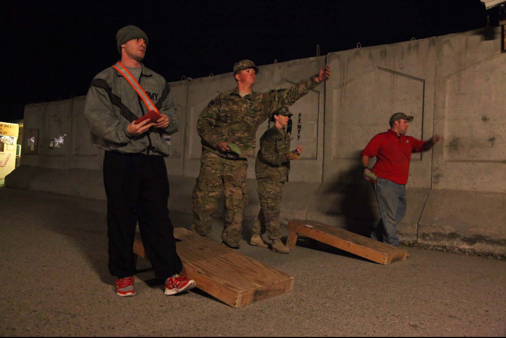
U.S. Soldiers and a USO programs coordinator play a game of corn-hole on Forward Operating Base Fenty, Nangarhar province, Afghanistan, Dec. 23, 2012. The game was sponsored by the USO, a non-profit organization that provides services and programs to U.S. troops.