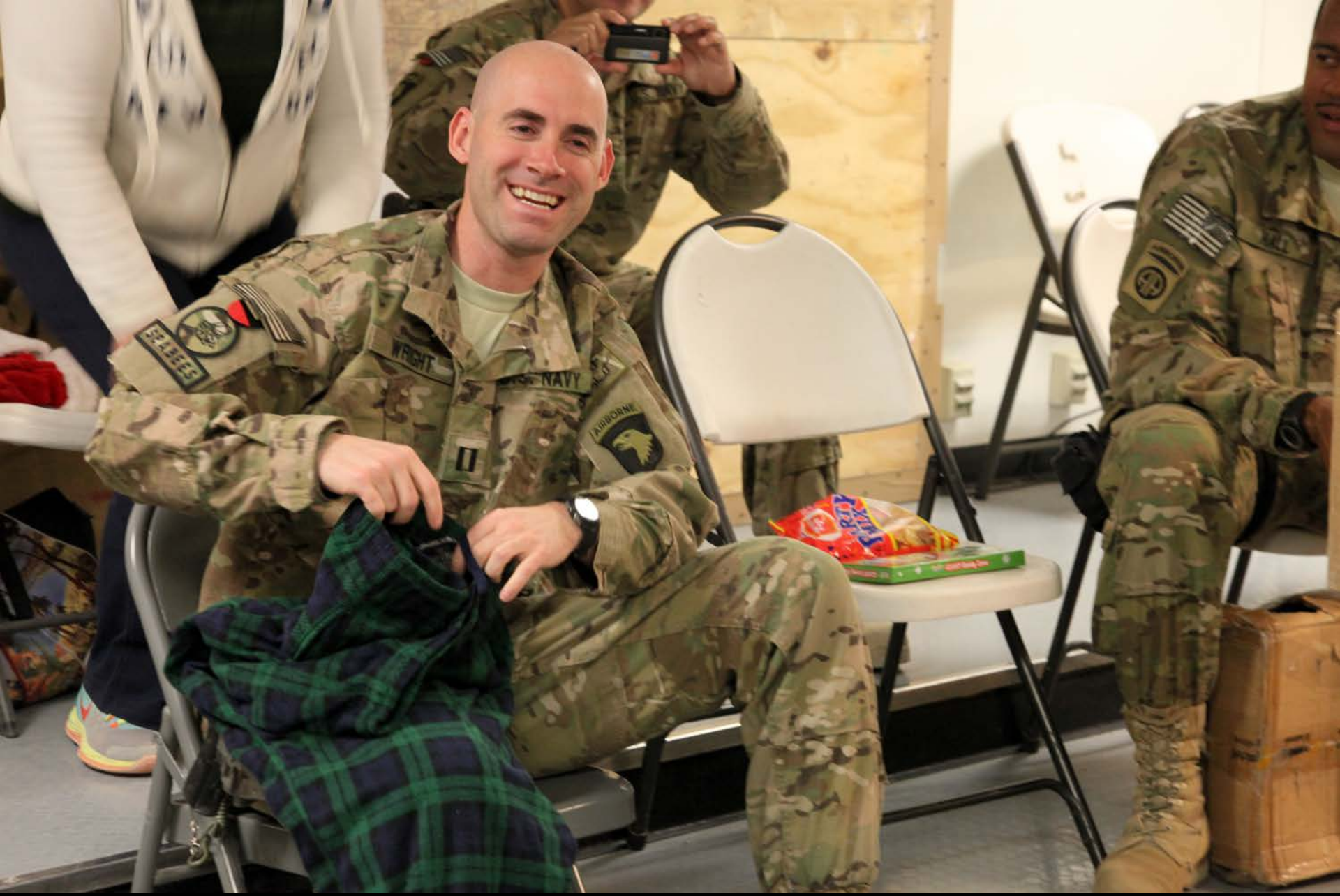
U.S. Army Soldiers and civilian contractors, assigned to Task Force 3/101, open gifts during a white elephant gift exchange at a Christmas party on Forward Operating Base Salerno, Khowst province, Afghanistan, Dec. 25, 2012. Even though work did not stop on Christmas Day many were able to take a few minutes to enjoy the holiday.