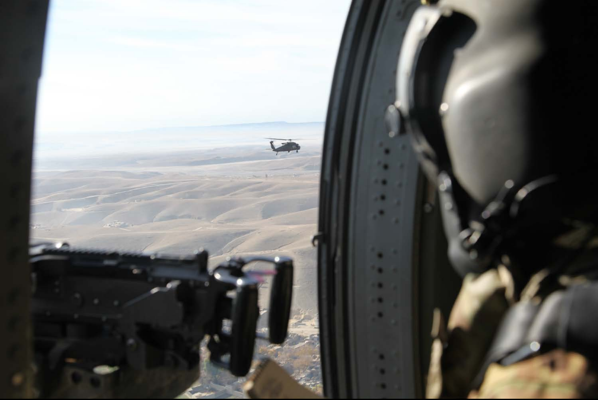
A U.S. Soldier with B Company, 5th Battalion, 101st Aviation Regiment, provides security for a UH-60 helicopter over Laghman province, Afghanistan, Dec. 23, 2012. The soldier provides security for the helicopter while in flight.