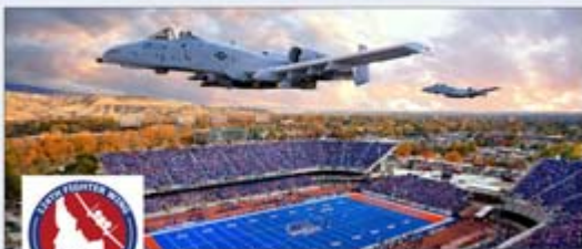
124 Fighter Wing, Idaho (Official)

It's Official! The 124th Fighter Wing has a Facebook