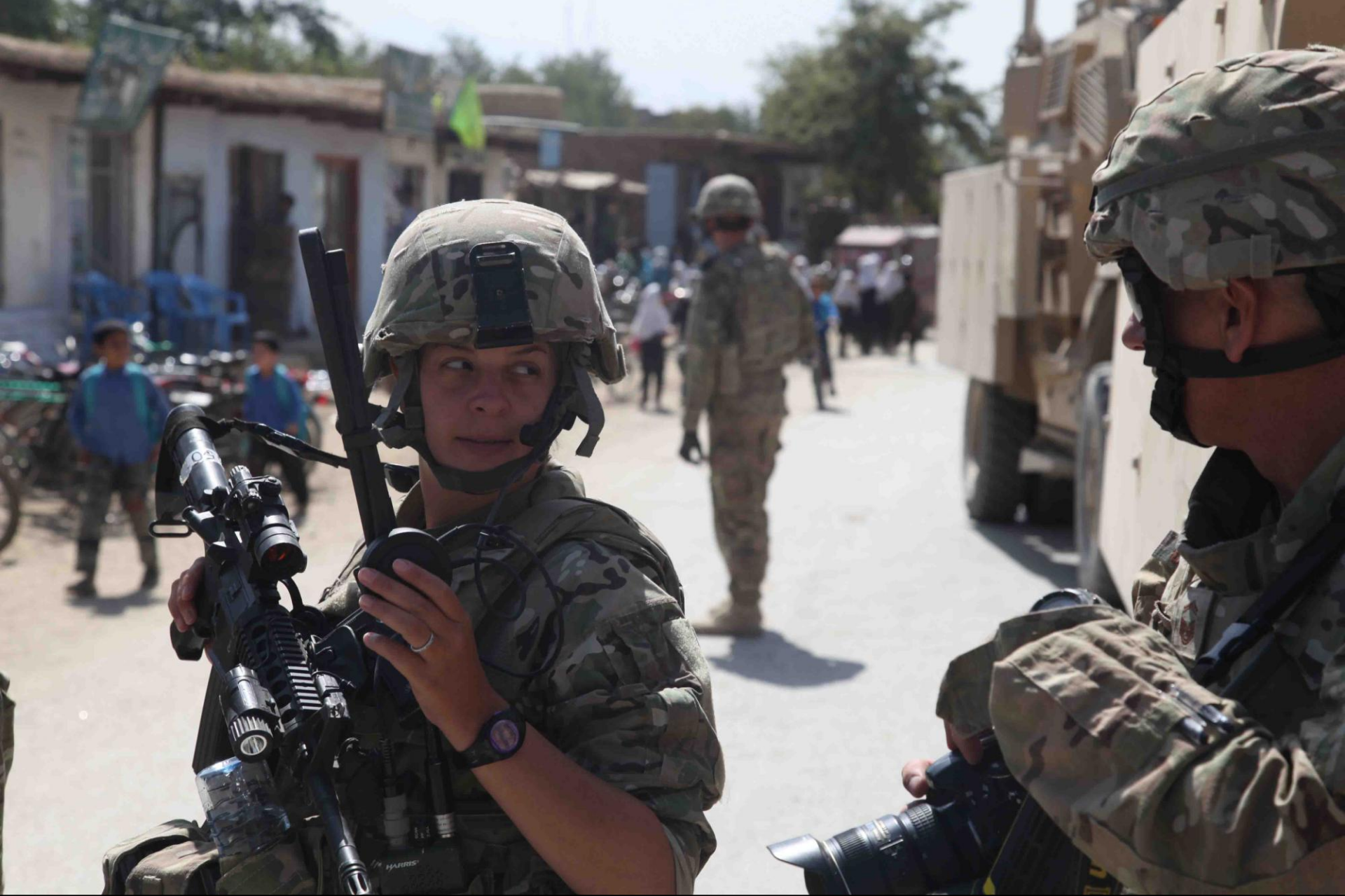
U.S. Airmen serving with the 455th Expeditionary Security Forces Squadron "Reapers" have a discussion outside an Afghan National Police compound, Parwan province, Afghanistan, Sept. 22, 2012. The Reapers are part of a 24-hour disruption force that conducts missions out of Bagram Air Field.