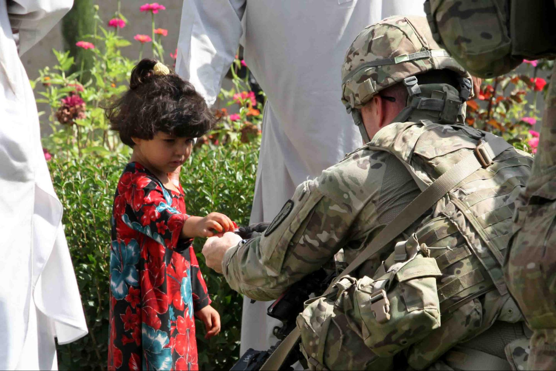
A U.S. Soldier with the Provincial Reconstruction Team (PRT) Khost gives a little girl a treat during a visit to the garden inside the home of a farmer living in the Nadir Shah Kot district, Khost province, Afghanistan, Sept. 27, 2012. The Khost PRT was visiting local farmers to discuss their growing conditions and availability of supplies.