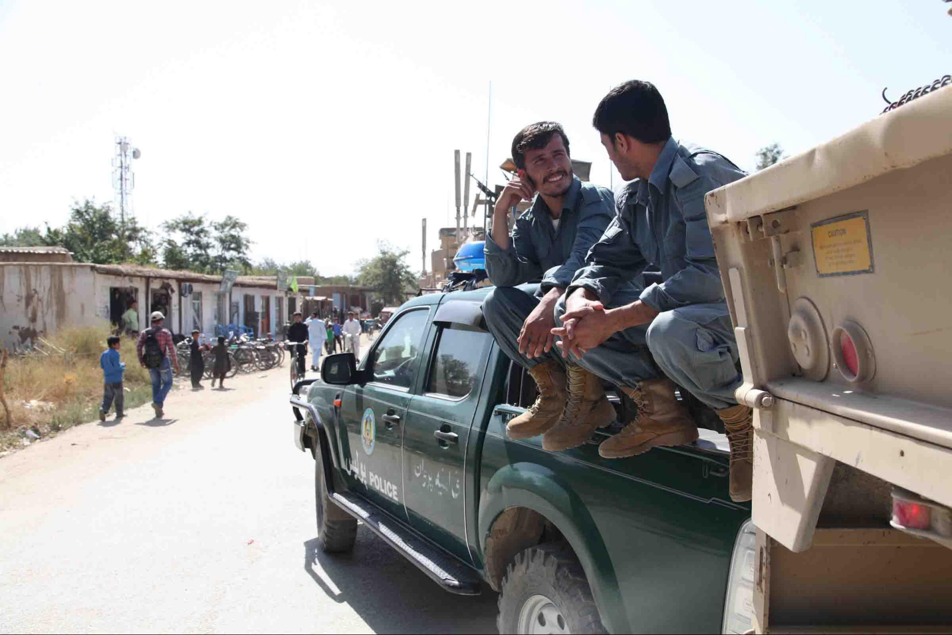
Afghan National Police (ANP) officers take a break from unloading furniture and Hesco barriers being delivered to an ANP compound outside Bagram Air Field, Parwan province, Afghanistan, Sept. 22, 2012. The barriers were provided to better secure the ANP compound, and the furniture will give them better working conditions.