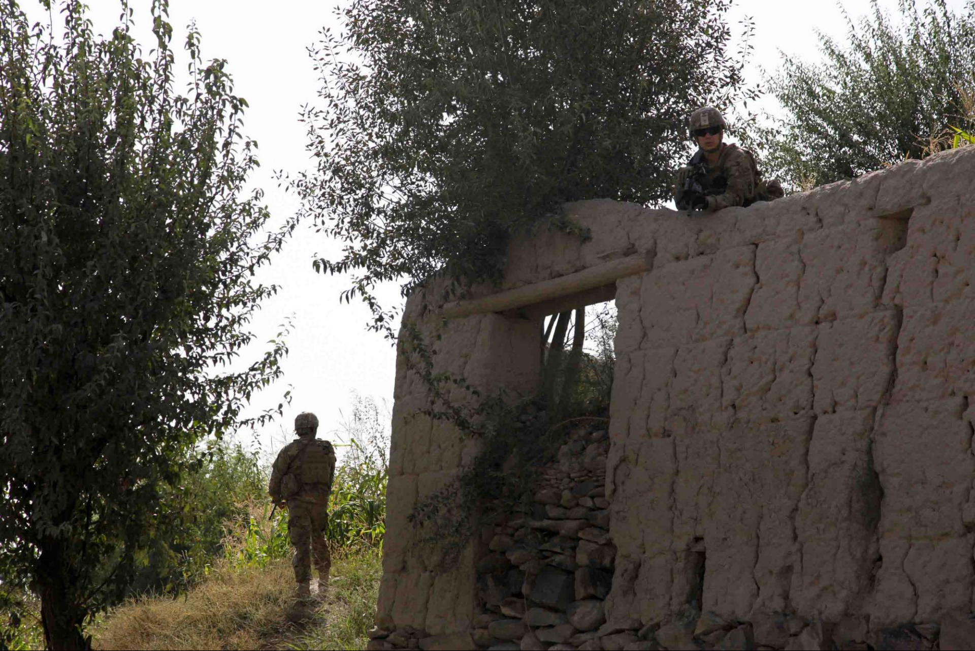
1U.S. Soldiers with Delta Company, 1st Battalion (Airborne), 143rd Infantry Regiment, Task Force, 4-25, Provincial Reconstruction Team (PRT) Khost, provide security during a visit to a farming community in the Nadir Shah Kot district, Khost province, Afghanistan, Sept. 27, 2012. The Khost PRT was visiting local farmers to discuss their growing conditions and availability of supplies.