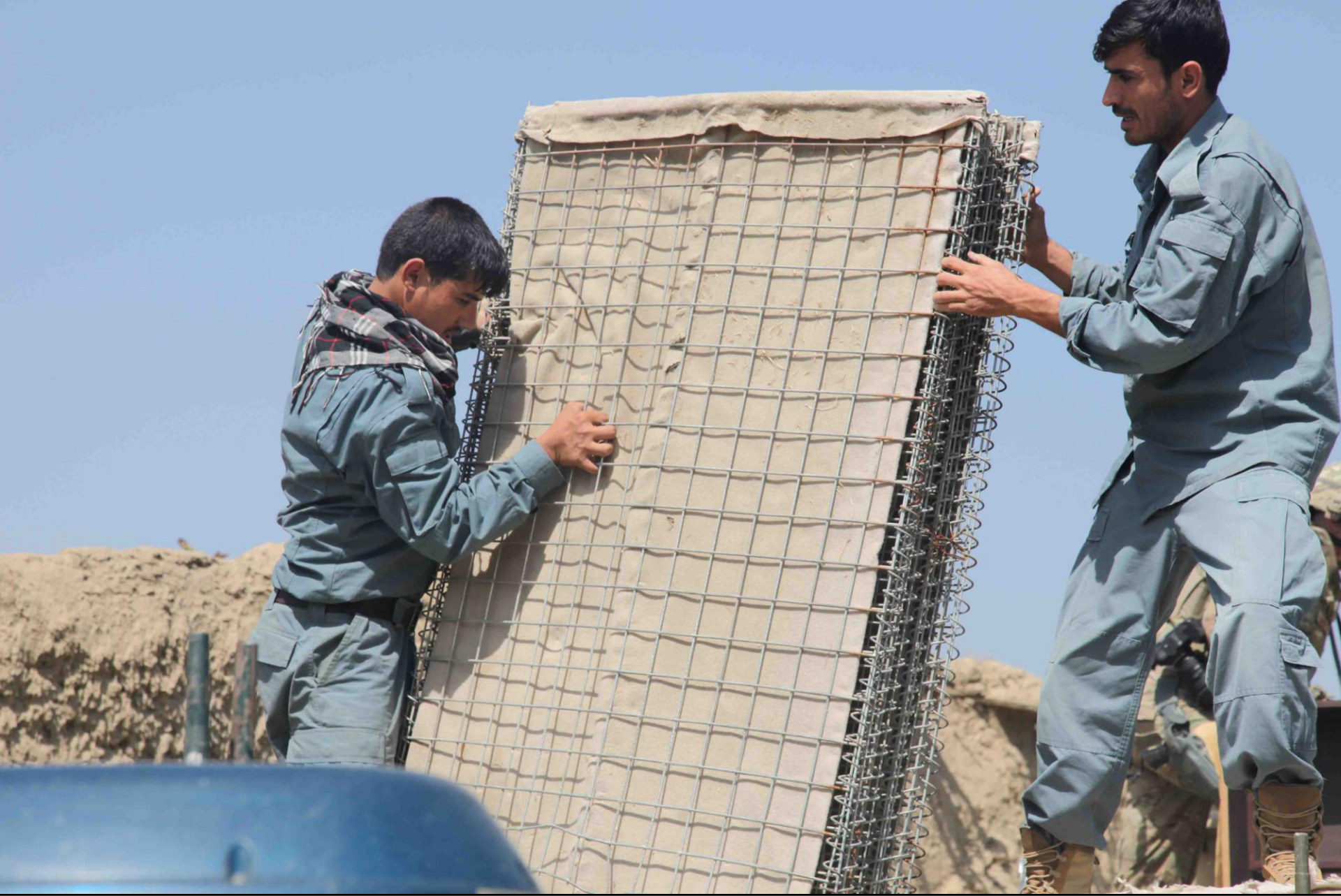
Afghan National Police (ANP) officers unload a Hesco barrier off a truck outside of an ANP compound in Parwan province, Afghanistan, Sept. 22, 2012. The ANP are going to use the barriers to better secure their compound.