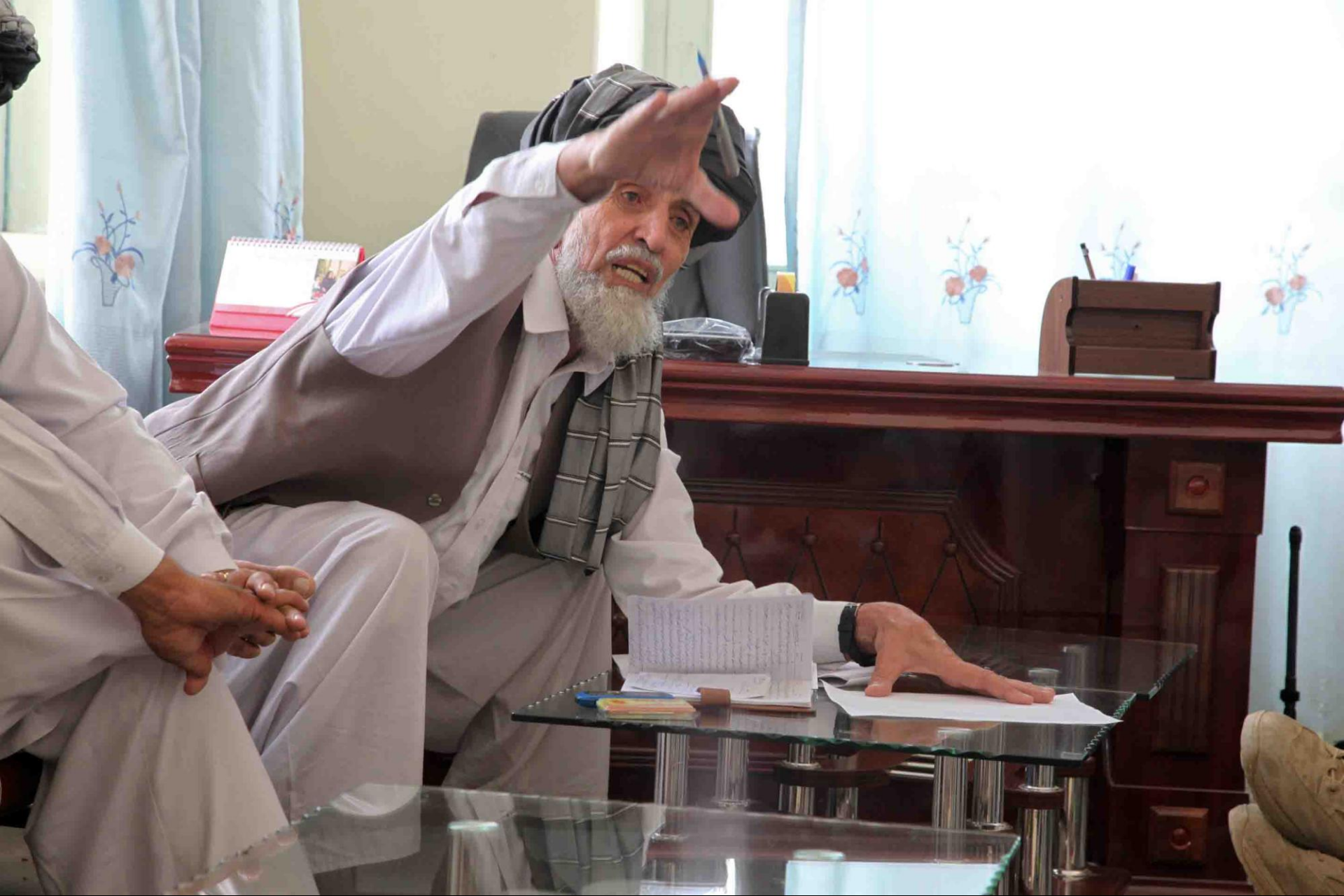
The Khost district governor describes a dam project that he would like Provincial Reconstruction Team (PRT) Khost to help with during a meeting in the governor's office at the Gorbuz District Center, Khost province, Afghanistan, Aug. 13, 2012. The meeting was to discuss possible PRT Khost assistance to upcoming projects.