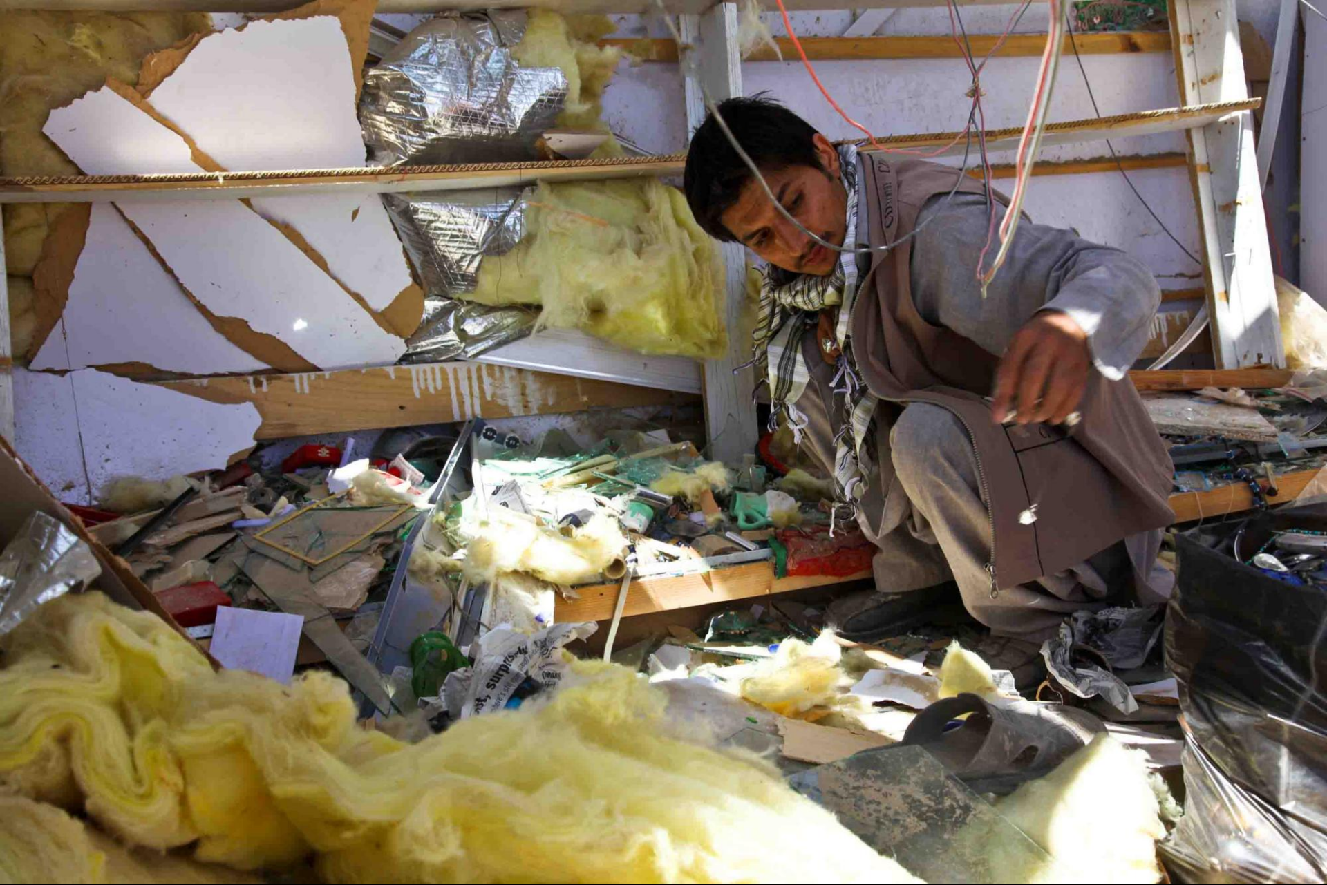
An Afghan shopkeeper looks through the debris of what is left of his business after a vehicle-borne improvised explosive device damaged the bazaar days earlier on Forward Operating Base Shank Aug. 15, 2012, in Logar province, Afghanistan. The VBIED caused the deaths of several Afghans.