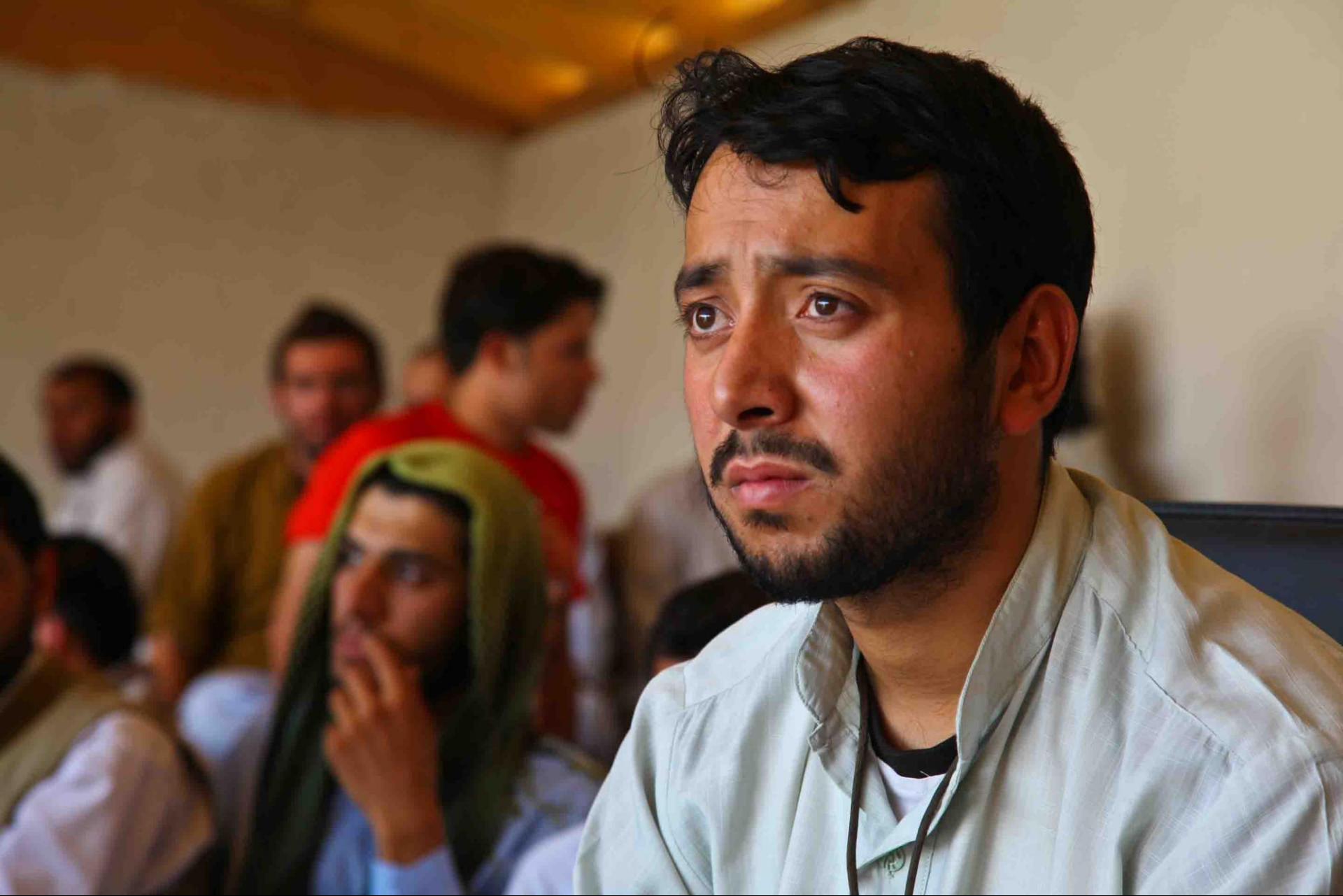
A local Afghan shopkeeper affected by a vehicle-borne improvised explosive device that occurred earlier that week attends a meeting on Forward Operating Base Shank, Logar province, Afghanistan, Aug. 15, 2012. The meeting covered topics such as the financial future of those who lost their entire businesses due to the VBIED.