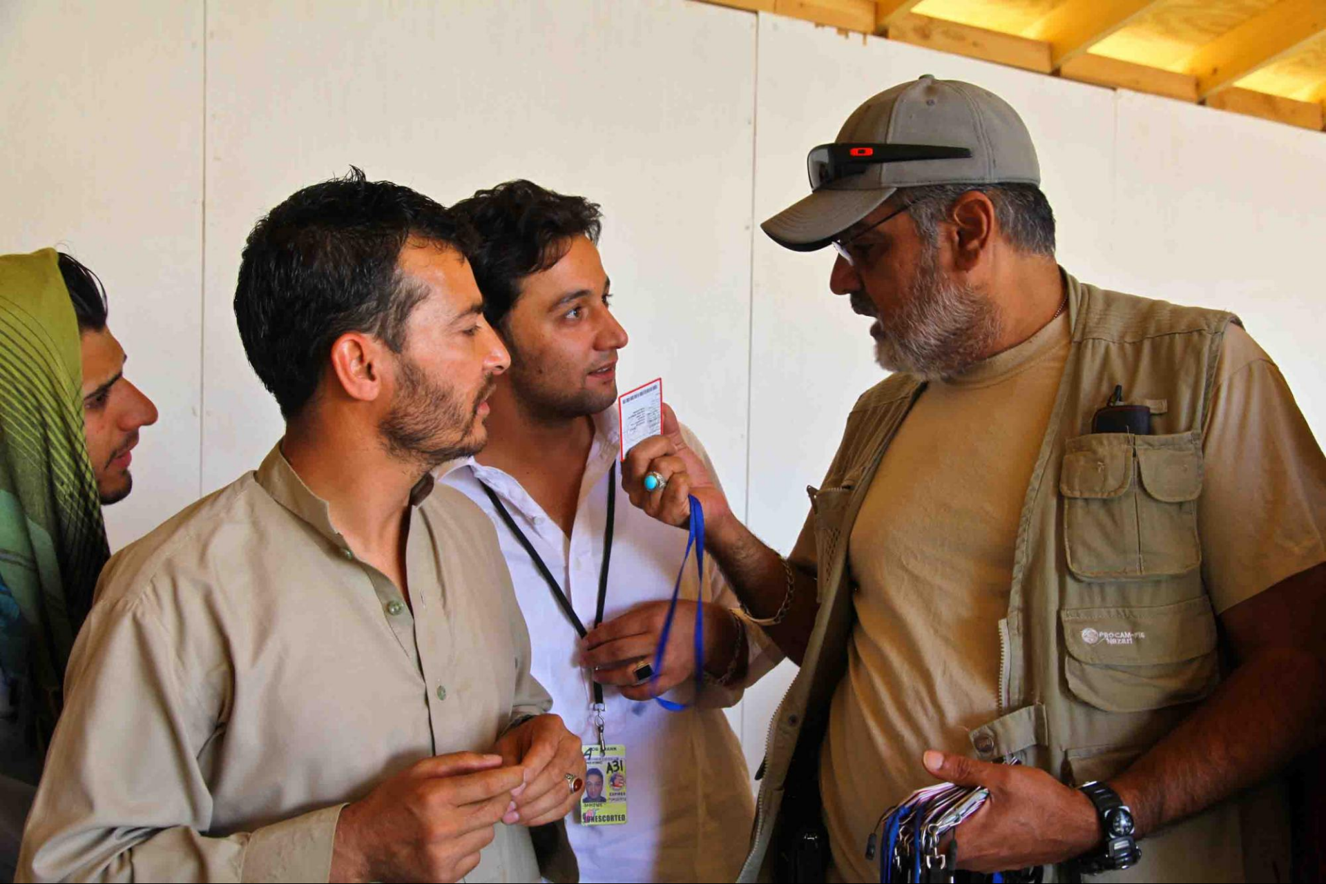
A clerk checks the visitor badges of Afghan shopkeepers at a meeting on Forward Operating Base Shank Aug. 15, 2012, in Logar province, Afghanistan. The visitor badges are mandatory for entry into FOB Shank.