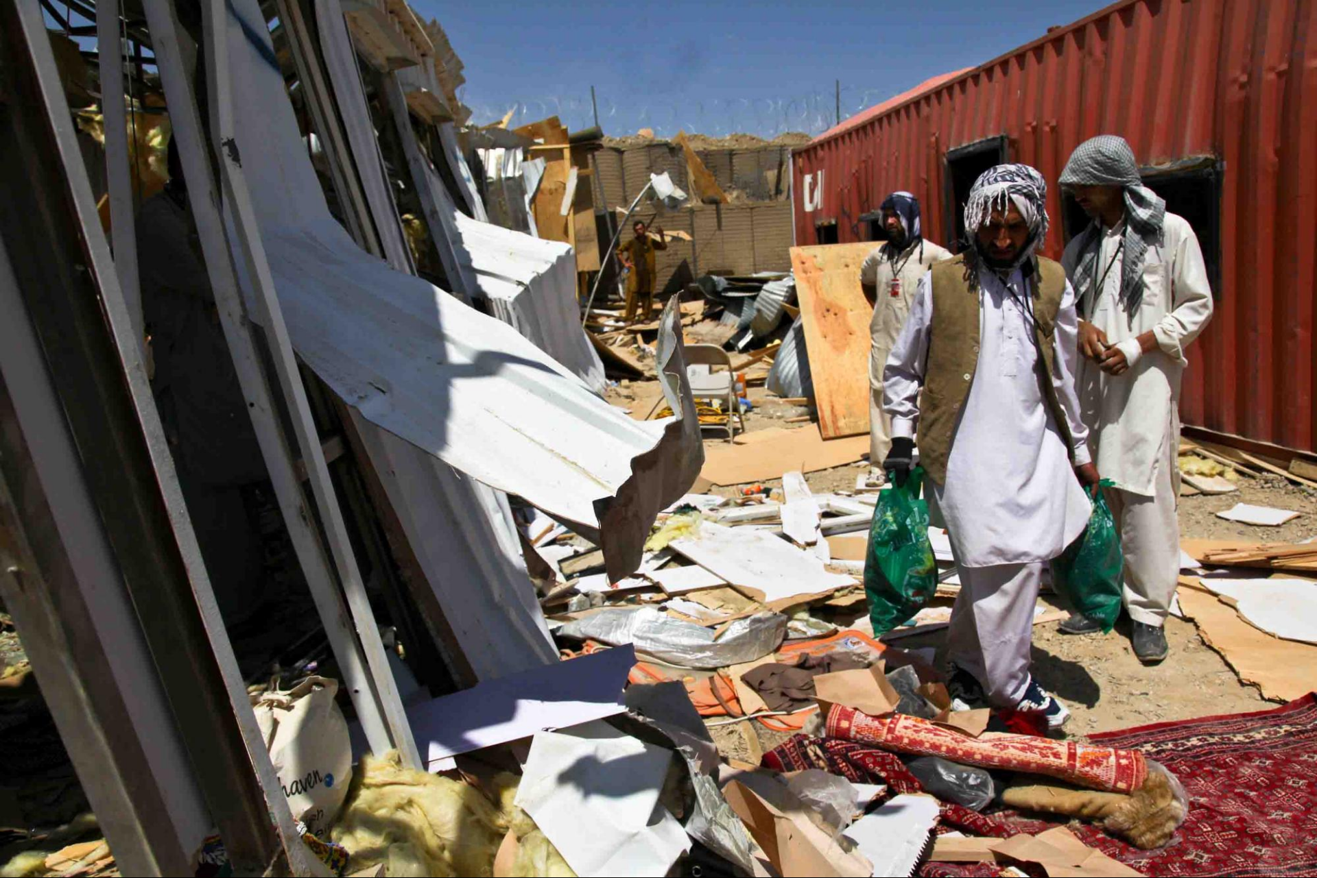
Afghan shopkeepers rummage through what is left of their businesses after a vehicle-borne improvised explosive device damaged the bazaar days earlier at Forward Operating Base Shank Aug. 15, 2012, in Logar province, Afghanistan. The VBIED caused the deaths of many Afghans.