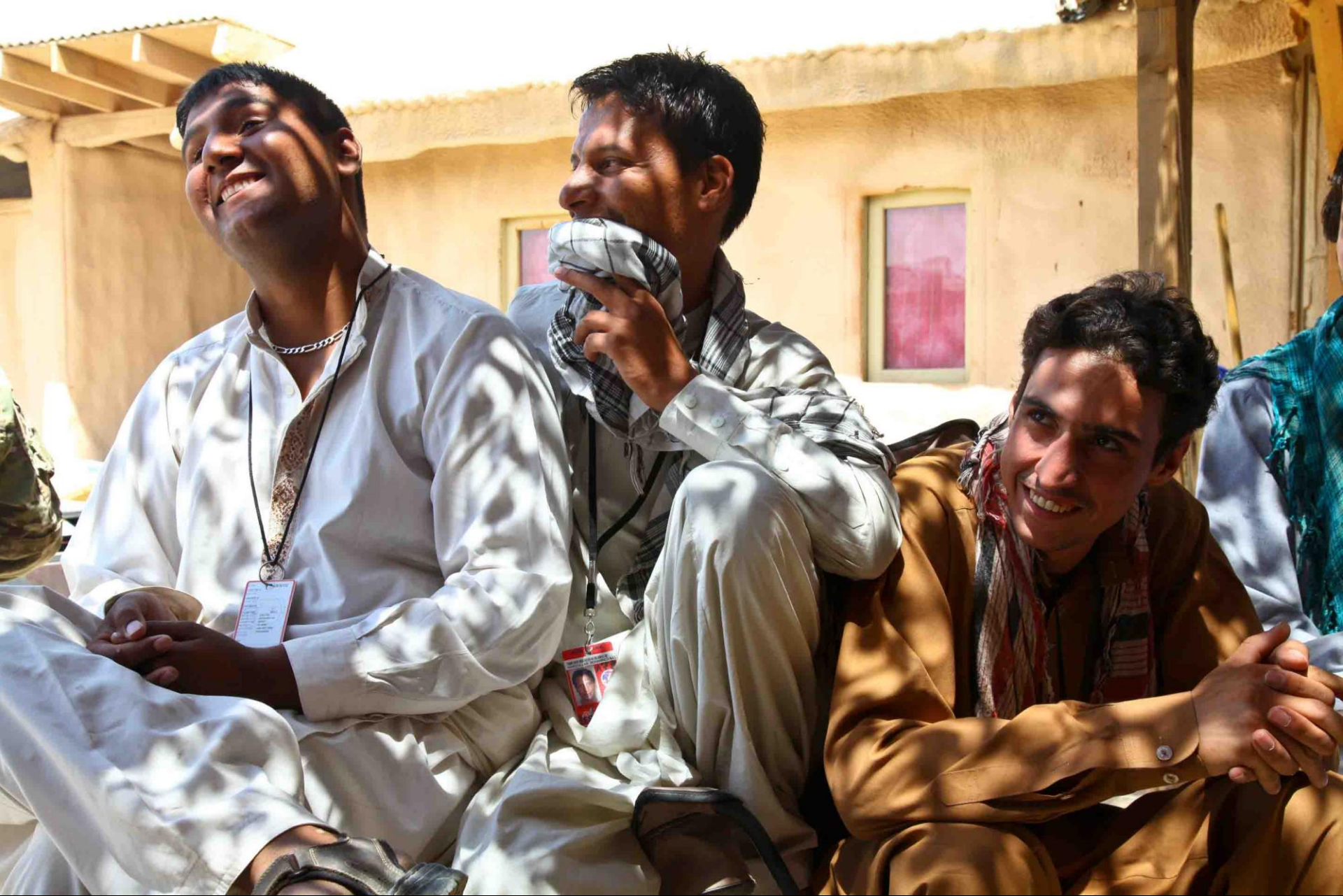
Local afghan shopkeepers smile at a meeting to discuss their financial future on Forward Operating Base Shank Aug. 15, 2012, in Logar province, Afghanistan. The meeting took place after a vehicle-borne improvised explosive device destroyed businesses and took several lives.