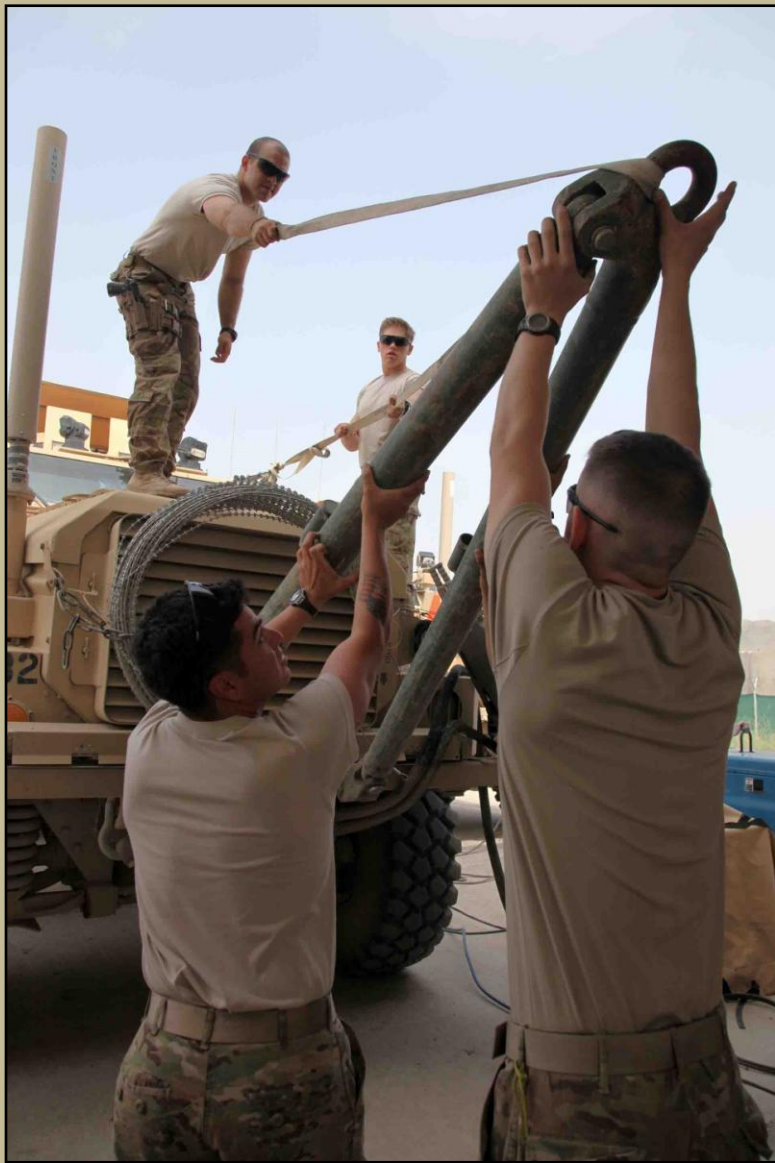
U.S. Soldiers, all combat infantryman with 1st Platoon, Delta Company, 1st Battalion (Airborne), 143rd Infantry Regiment, Task Force 4-25, lower a tow-bar to remove it from a mine-resistant, ambush-protected vehicle on Forward Operating Base Salerno, Khost province, Afghanistan, Aug. 10, 2012. U.S. Soldiers perform weekly maintenance on their vehicles to ensure mission readiness.