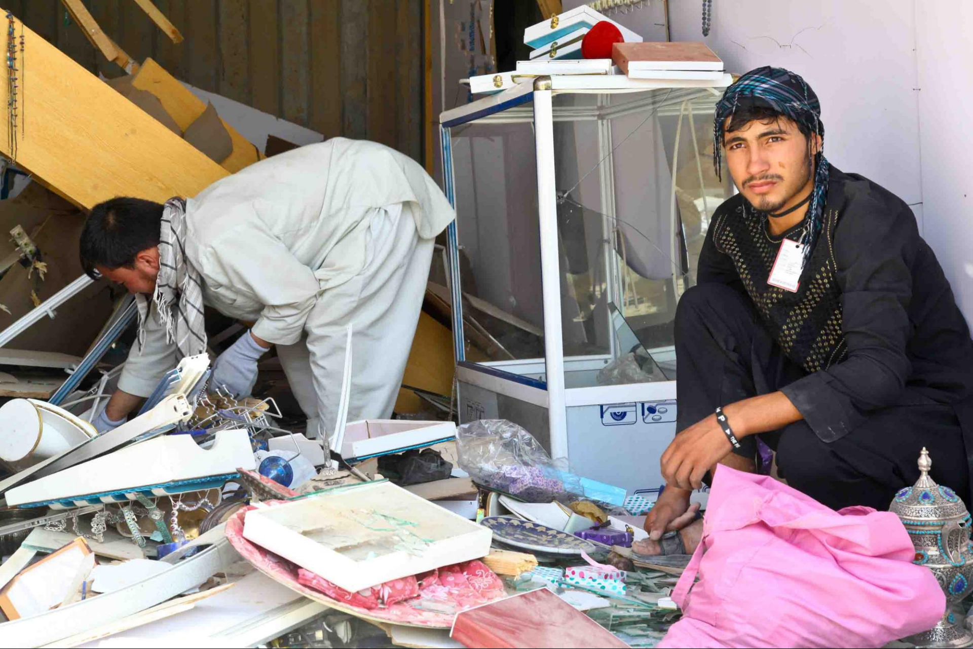
Local Afghan shopkeepers rummage through what is left of their business after a vehicle-borne improvised explosive device damaged the bazaar days earlier at Forward Operating Base Shank, Logar province, Afghanistan, Aug. 15, 2012. The Afghans have a two day period to collect what they can before the rubble is bulldozed.