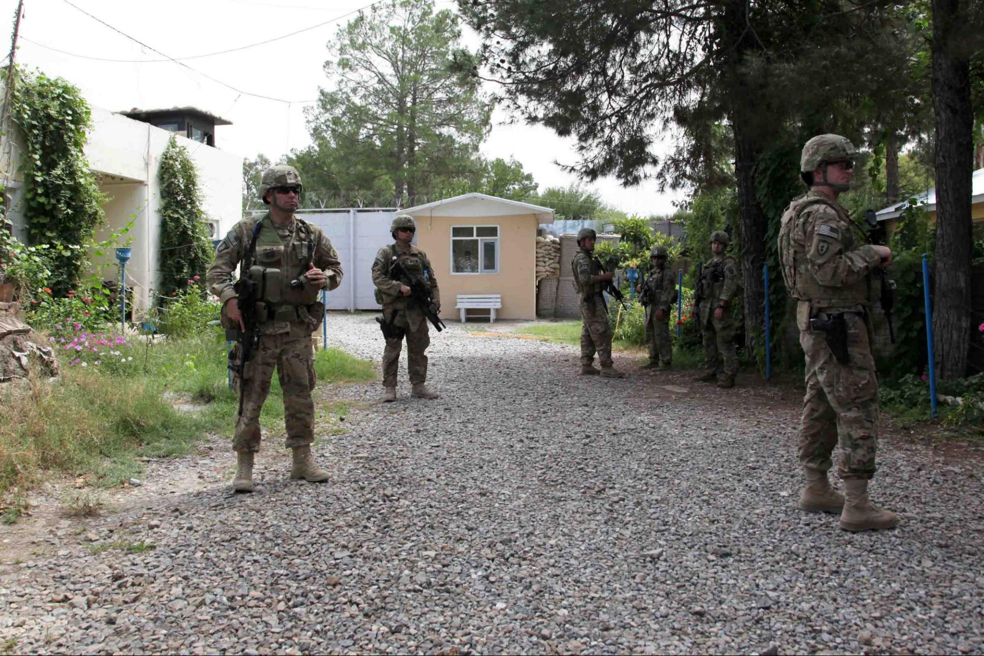
U.S. Soldiers with 1st Platoon, Delta Company, 1st Battalion (Airborne), 143rd Infantry Regiment, Task Force, 4-25, set up security for a meeting in the United Nations Assistance Mission in Afghanistan (UNAMA) compound, Khost province, Afghanistan, Aug. 14, 2012. Provincial Reconstruction Team Khost, UNAMA and local officials conducted the regularly scheduled meeting to exchange information on governance and development initiatives in Khost.