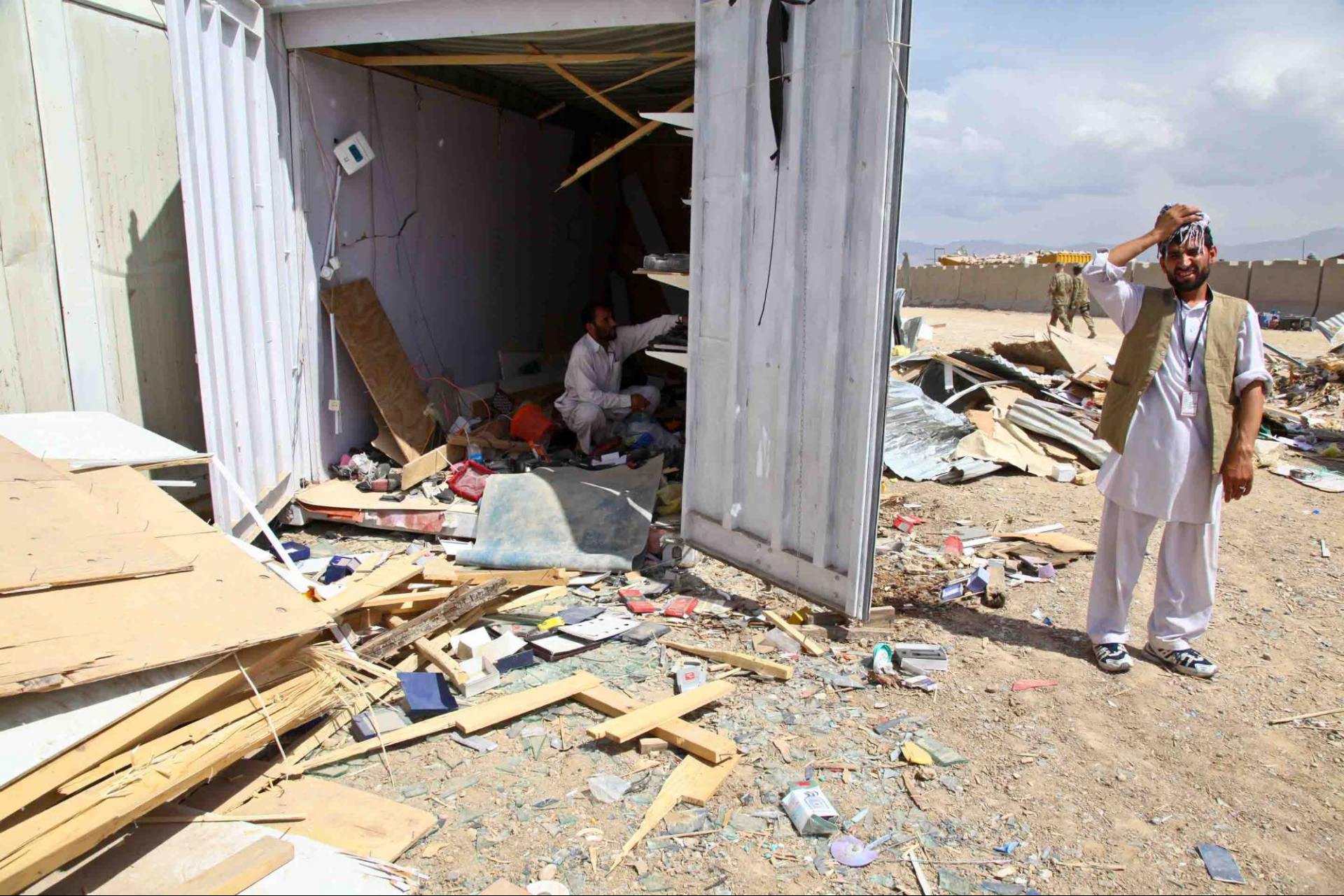
Local Afghan shopkeepers rest after searching through the rubble for anything salvageable after a vehicle-borne improvised explosive device destroyed the bazaar days earlier at Forward Operating Base Shank, Logar province, Afghanistan, Aug. 15, 2012. The Afghans have a two day period to collect what they can before the rubble is bulldozed.