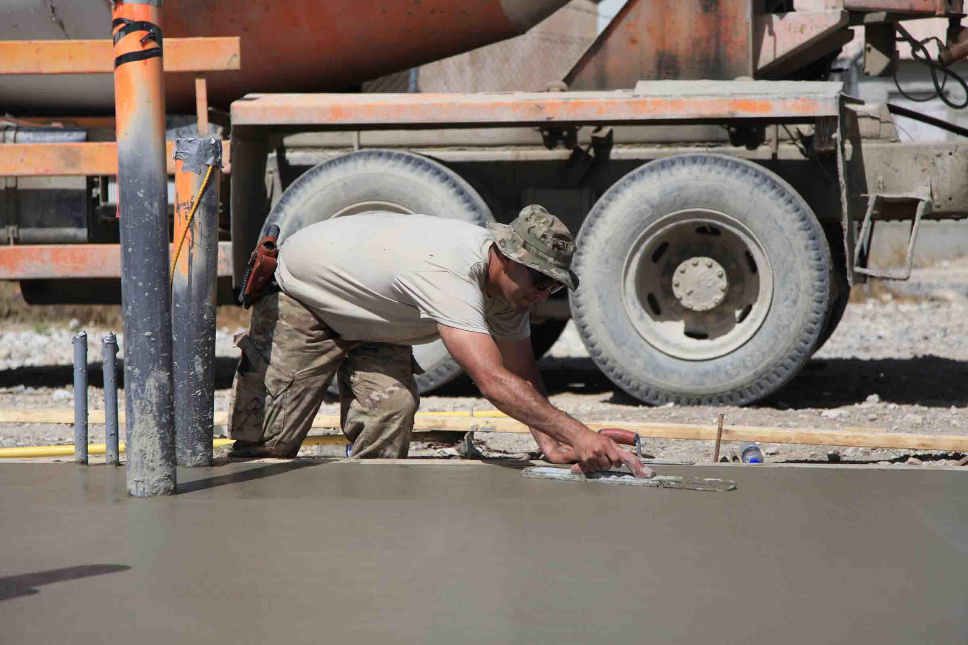
A U.S. Airman assigned to the 577th Expeditionary Prime Base Engineer Emergency Force Squadron levels concrete for a floor of a new building on Bagram Airfield, Parwan province, Afghanistan, Sept. 14, 2012. The 577th Expeditionary Prime Base Engineer Emergency Force Squadron is working with the U.S. Army's 204th Maneuver Enhancement Brigade to build a building.