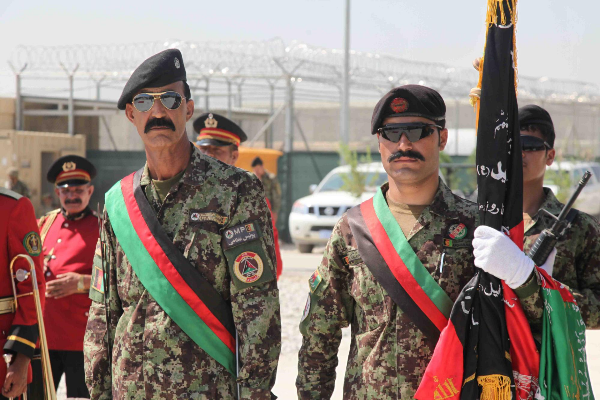
Afghan National Army soldiers stand in formation outside Bagram Airfield, Parwan province, Afghanistan, Sept. 10, 2012. The soldiers were part of a ceremony giving the Afghan government control of the local prison.