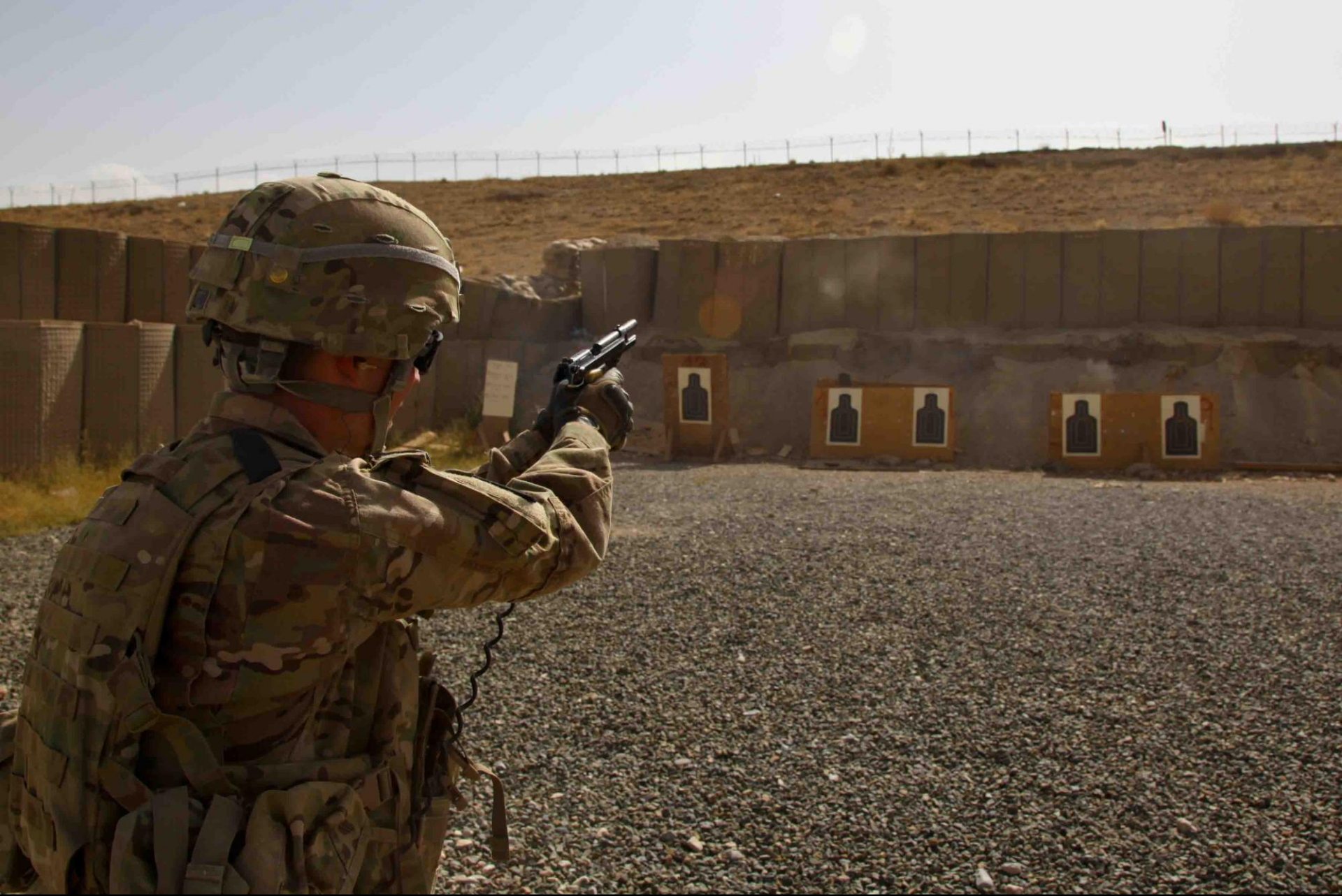
A U.S. Soldier serving with the 173rd Special Troops Battalion (STB) qualify with the M9 Beretta pistol at the firing range on Forward Operating Base Shank Sept. 10, 2012, in Logar province, Afghanistan. The 173rd STB were qualifying on the M9 as well as the M4 carbine.