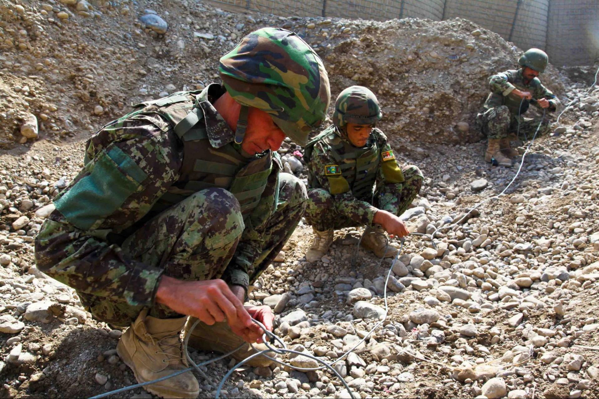
Afghan National Army (ANA) soldiers prepare for a controlled detonation at Camp Maiwand on Forward Operating Base Shank Sept. 10, 2012, in Logar province, Afghanistan. The ANA were enrolled in the "Blow In Place/Sweep Training" course.