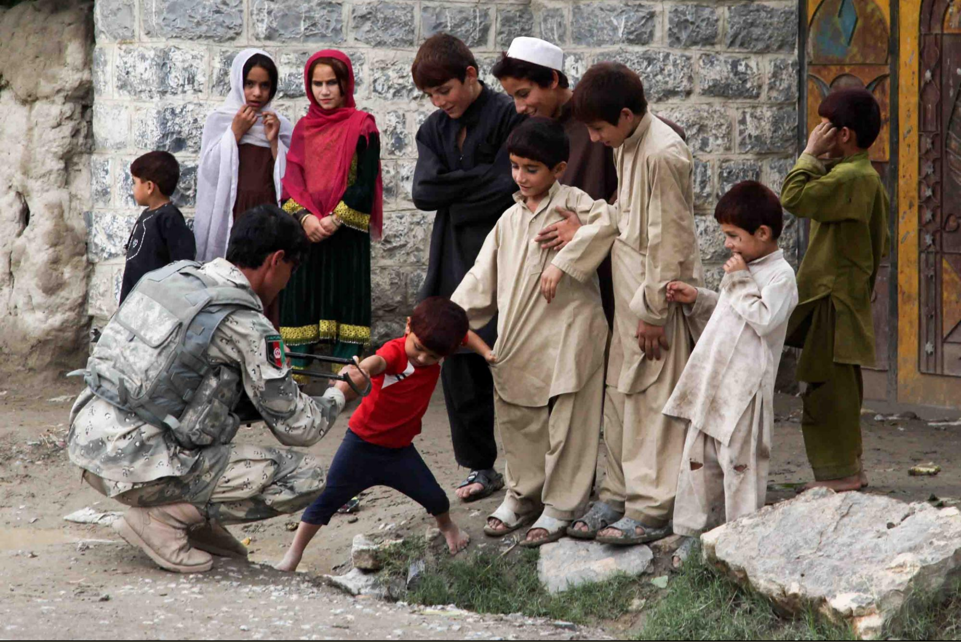
An Afghan Border Police (ABP) officer helps a little boy over a flooded ditch in Ayub Khel, Khost province, Afghanistan, Sept. 8, 2012. U.S. Soldiers with Team Hatchet, 1st Battalion (Airborne), 501st Infantry Regiment, Task Force 4-25 and the ABP set up a security checkpoint in the village to speak with passing motorists.