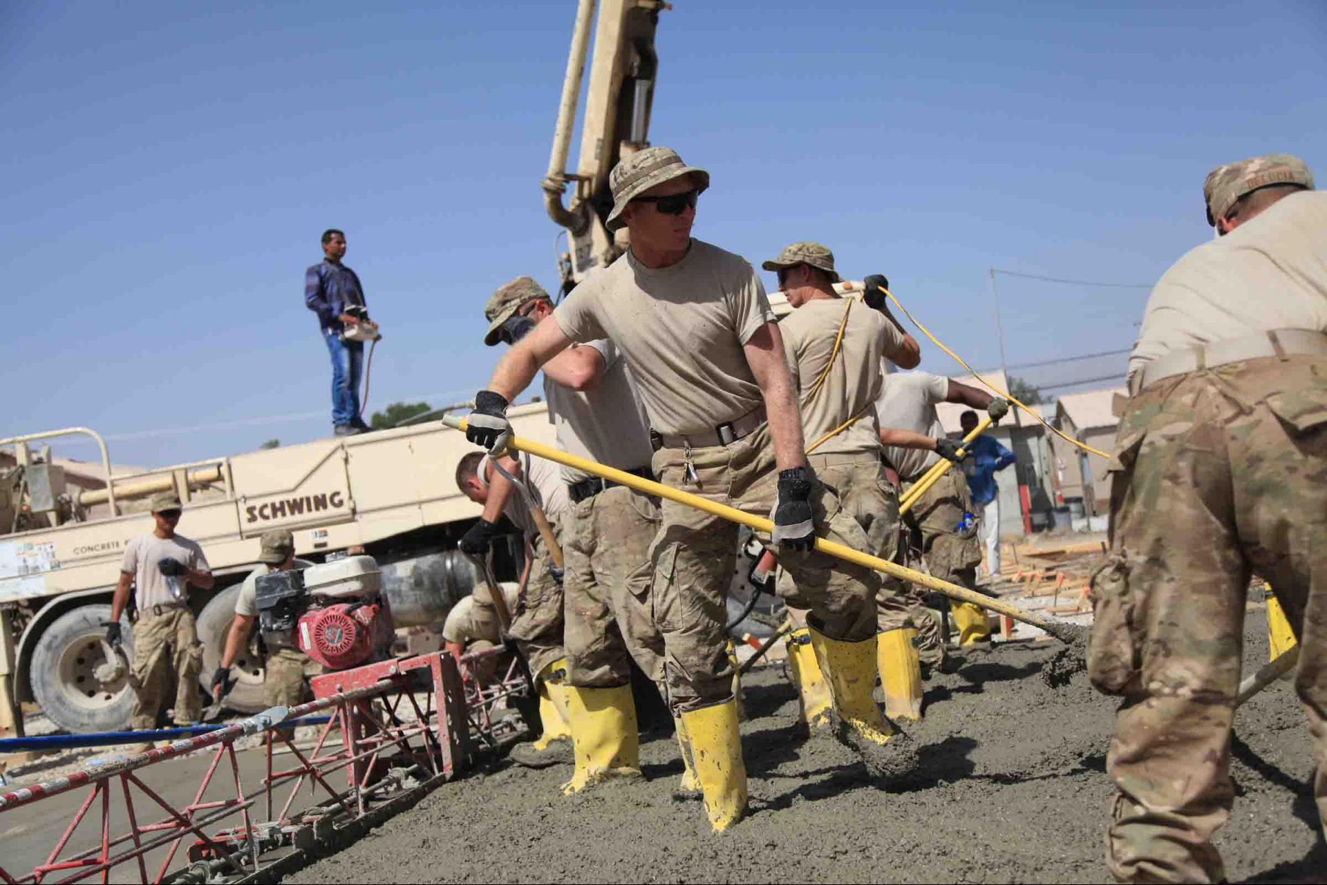
U.S. Airmen assigned to the 577th Expeditionary Prime Base Engineer Emergency Force Squadron level concrete for a floor of a new building on Bagram Airfield, Parwan province, Afghanistan, Sept. 14, 2012. The 577th Expeditionary Prime Base Engineer Emergency Force Squadron is working with the U.S. Army's 204th Maneuver Enhancement Brigade to build a building.