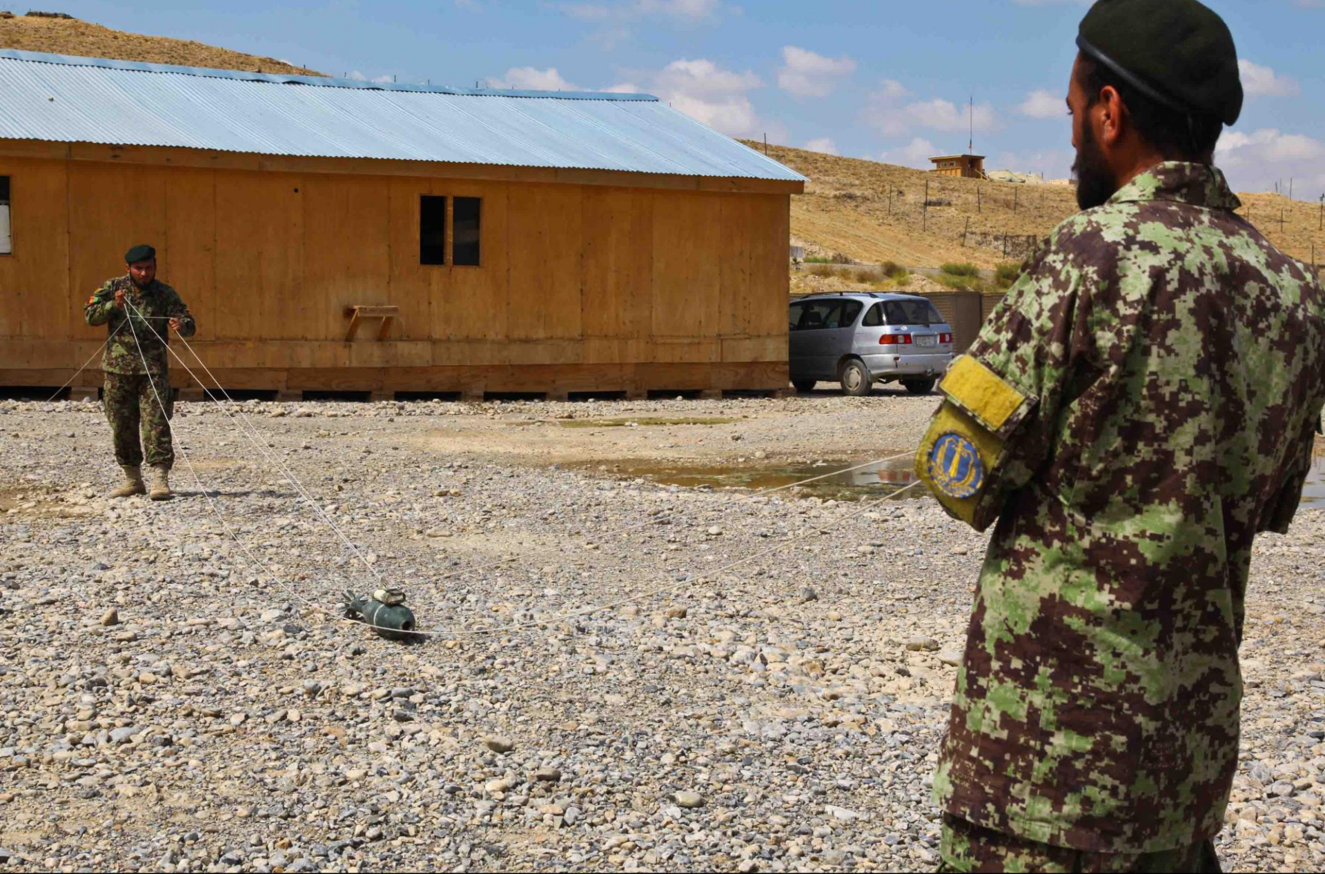
Afghan National Army (ANA) soldiers conduct a hands-on exercise at Camp Maiwand on Forward Operating Base Shank Sept. 10, 2012, in Logar province, Afghanistan. The ANA soldiers were enrolled in the "Blow In Place/Sweep Training" course.