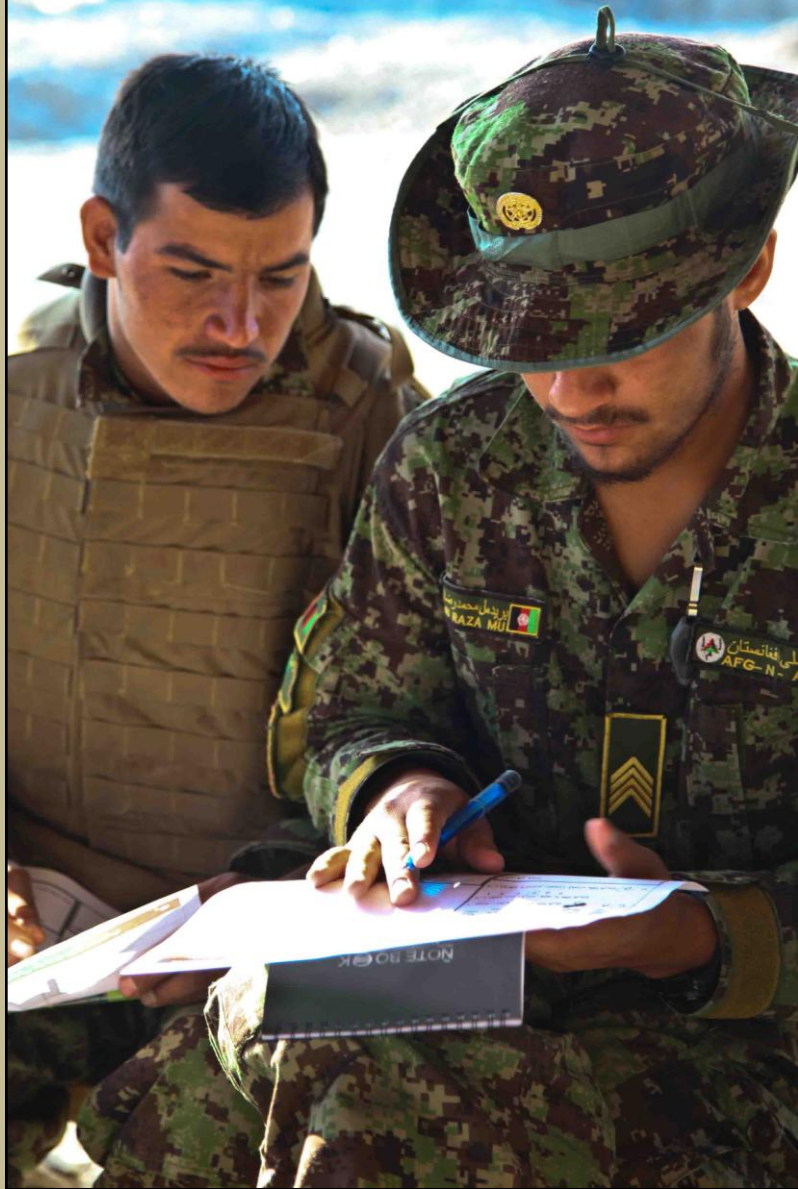
An Afghan National Army (ANA) soldier instructs another soldier how to fill out a five line unexploded ordinance report at Camp Maiwand on Forward Operating Base Shank Sept. 10, 2012, in Logar Province, Afghanistan. The ANA were enrolled in the "Blow In Place/Sweep Training" course.