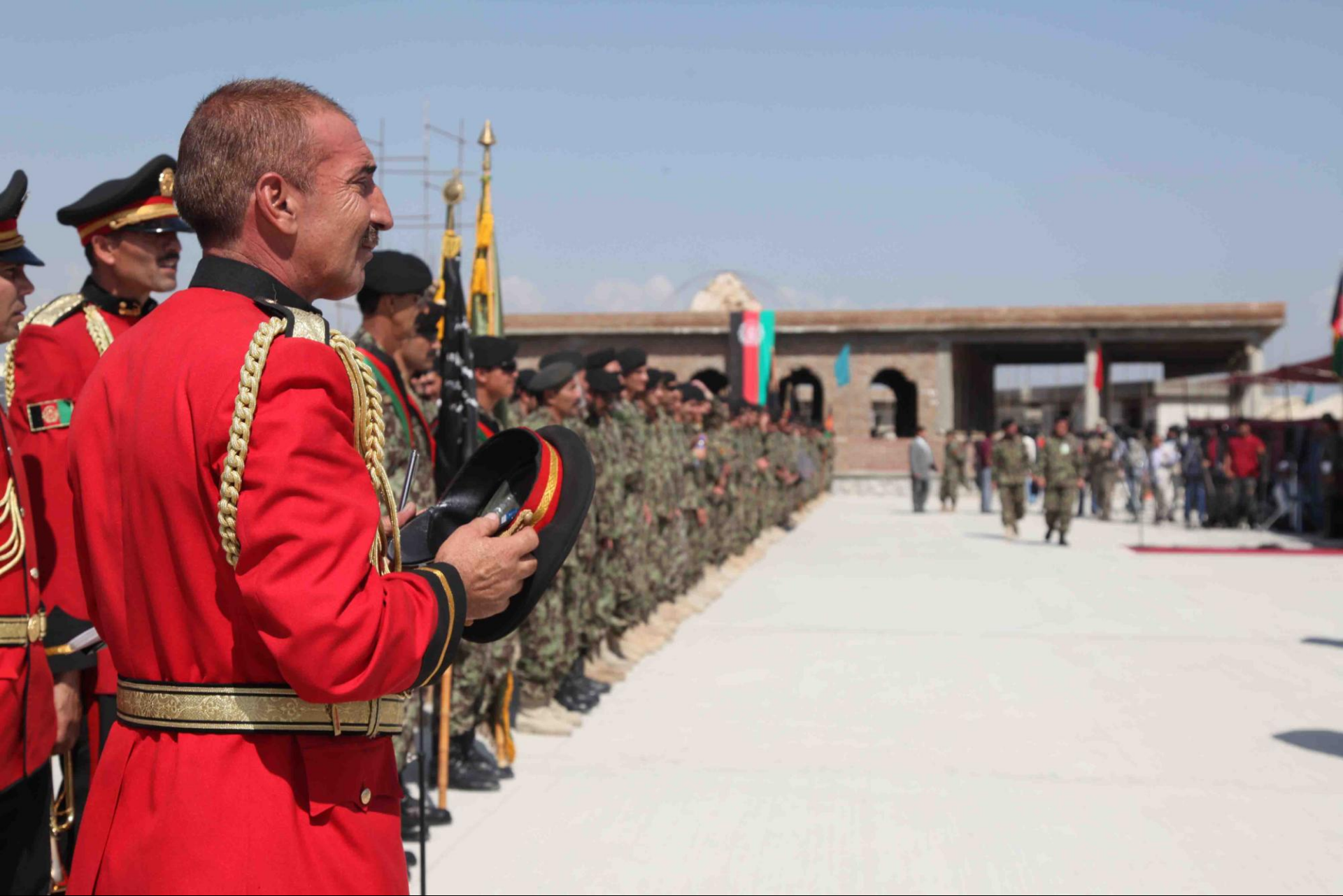
Afghan National Army band members and soldiers stand in formation outside Bagram Air Field, Parwan province, Afghanistan, Sept. 10, 2012. The soldiers were part of a ceremony giving the Afghan government control of the local prison.