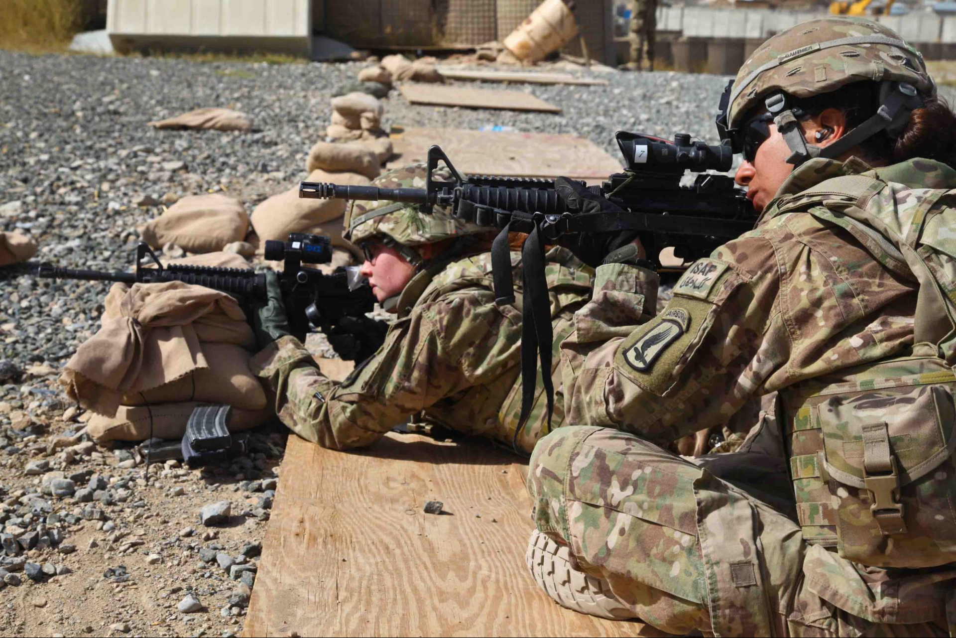
U.S. Soldiers assigned to the 173rd Special Troops Battalion (STB) qualify with the M4 carbine at the firing range on Forward Operating Base Shank Sept. 10, 2012, in Logar province, Afghanistan. The 173rd STB were qualifying on the M9 Beretta pistol as well as the M4 carbine.