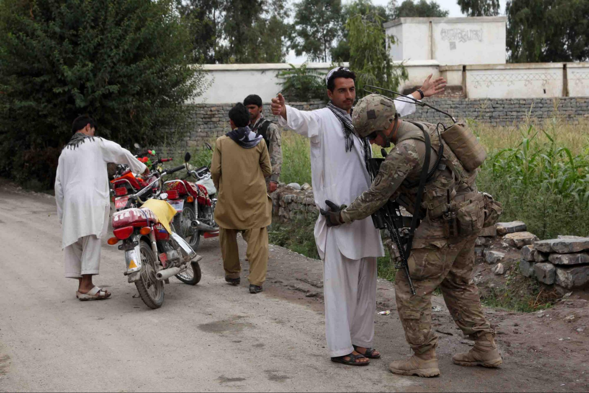
A U.S. Soldier with Team Hatchet, 1st Battalion (Airborne), 501st Infantry Regiment, Task Force 4-25, checks a local man for weapons before allowing him through a security checkpoint in Ayub Khel, Khost province, Afghanistan, Sept. 8, 2012. Team Hatchet and the Afghan Border Police set up the checkpoint to speak with passing motorists.