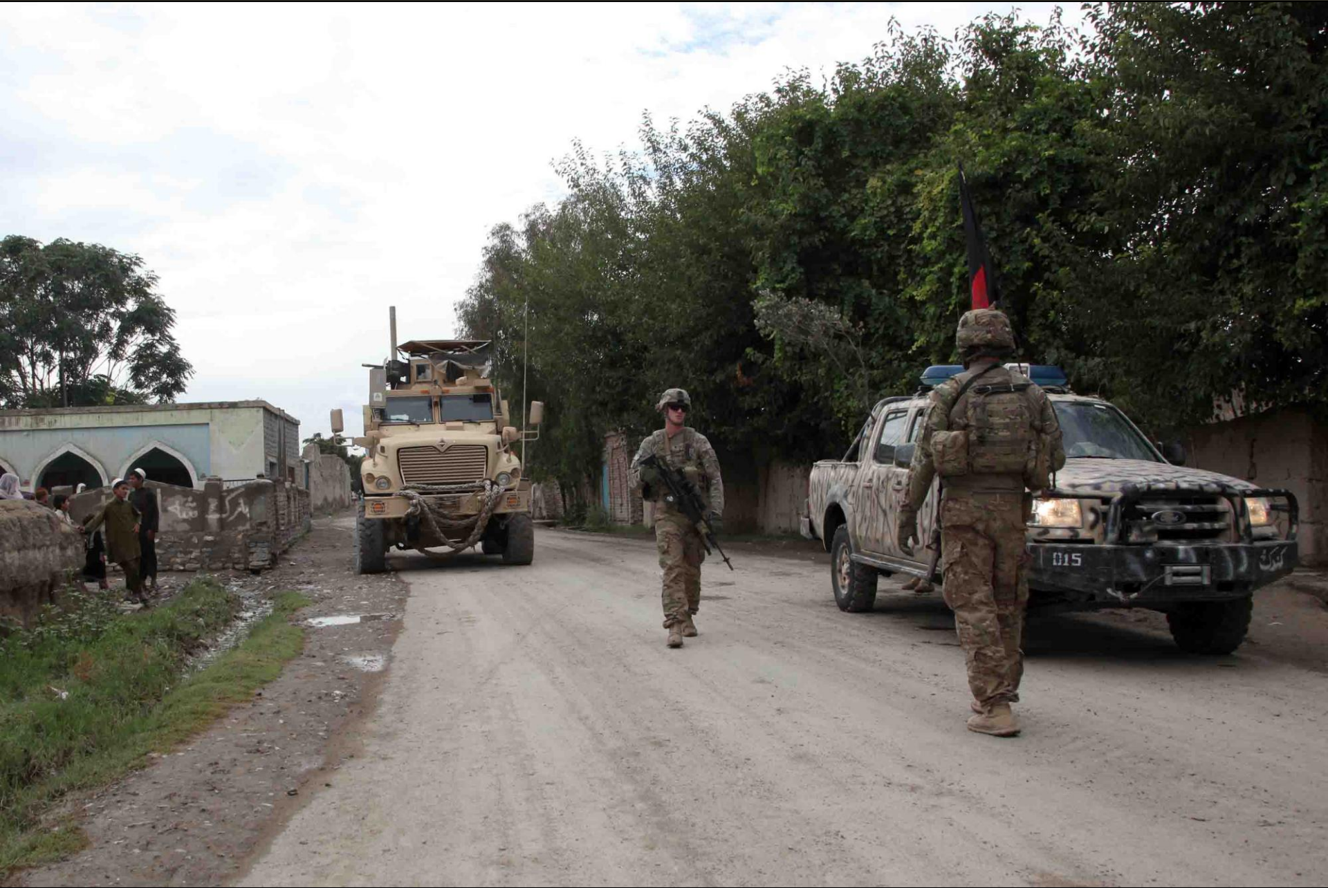
U.S. Soldiers with Team Hatchet, 1st Battalion (Airborne), 501st Infantry Regiment, Task Force 4-25, secure an area near their convoy for a security checkpoint in Ayub Khel, Khost province, Afghanistan, Sept. 8, 2012. Team Hatchet and the Afghan Border Police set up the checkpoint to speak with passing motorists.