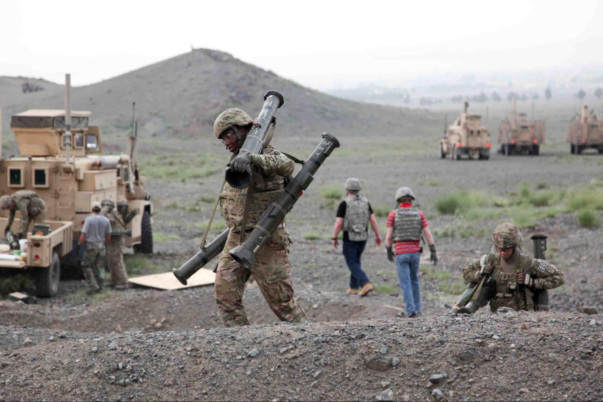
U.S. Soldiers assigned to 706th Explosive Ordnance Disposal (EOD) Company, Task Force 4-25, carry a load of expended rocket launchers at the demolition range on Forward Operating Base Salerno, Khost province, Afghanistan, Sept. 2, 2012. The EOD Soldiers disposed of ordnance and equipment that was determined to be unusable.