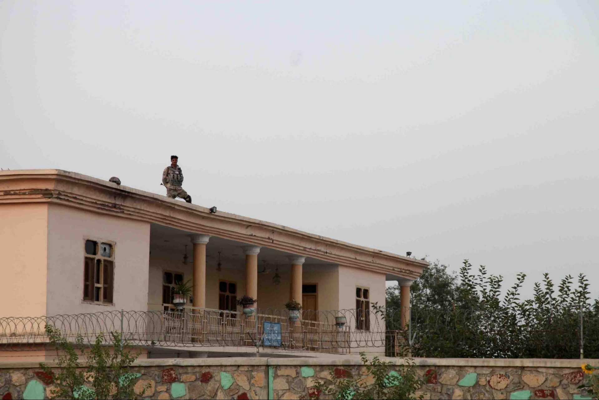
A guard keeps watch from a rooftop at the Afghan Border Police Quick Reaction Force Kandak Compound, Khost province, Afghanistan, Sept. 3, 2012.