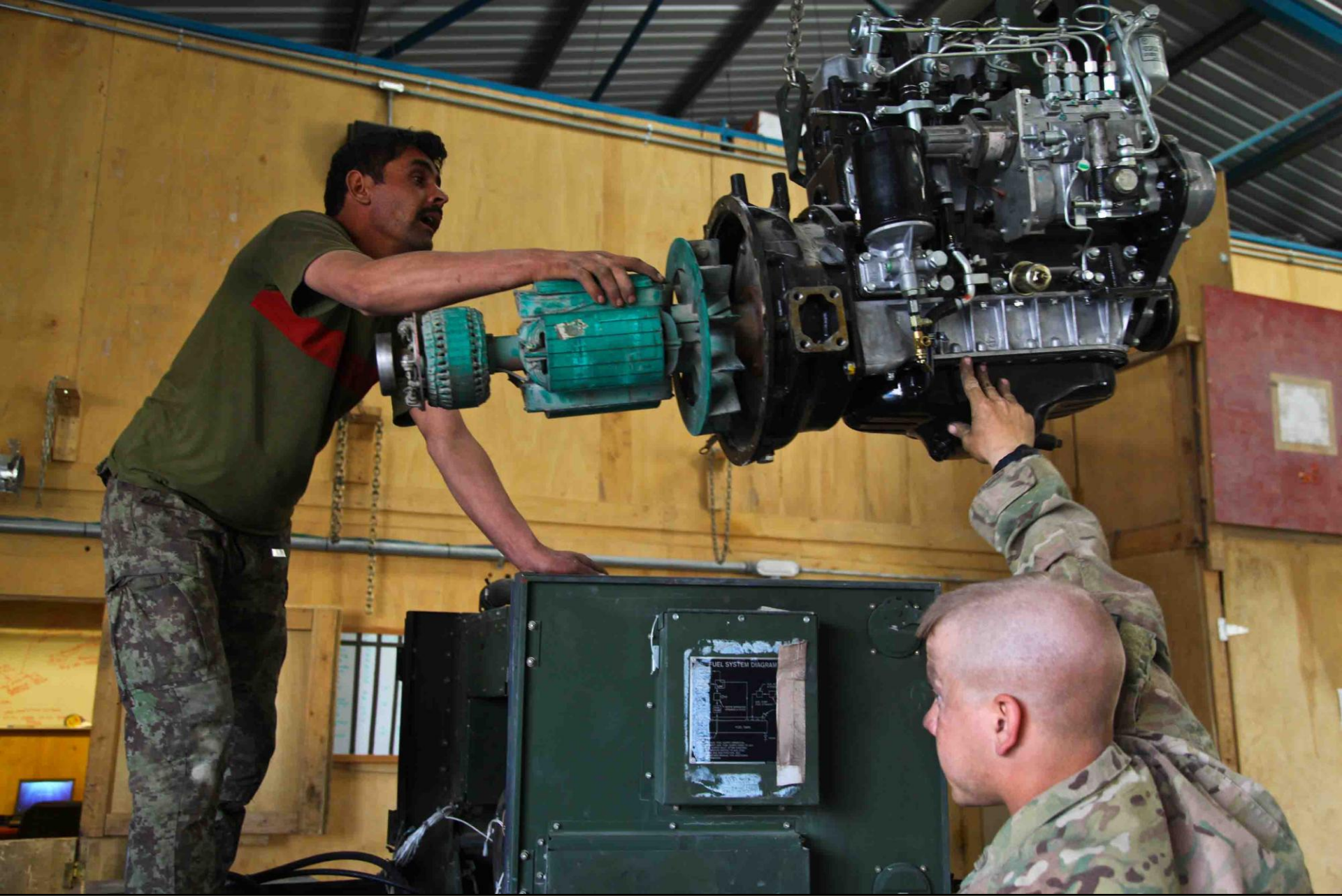
A U.S. Soldier and an Afghan National Army soldier transports a vehicle engine at the motor pool on Forward Operating Base Airborne Sept. 4, 2012, in Wardak province, Afghanistan. The U.S. Soldier is assigned to 4th Battalion, 319th Field Artillery Regiment, 173rd Airborne Brigade Combat Team.