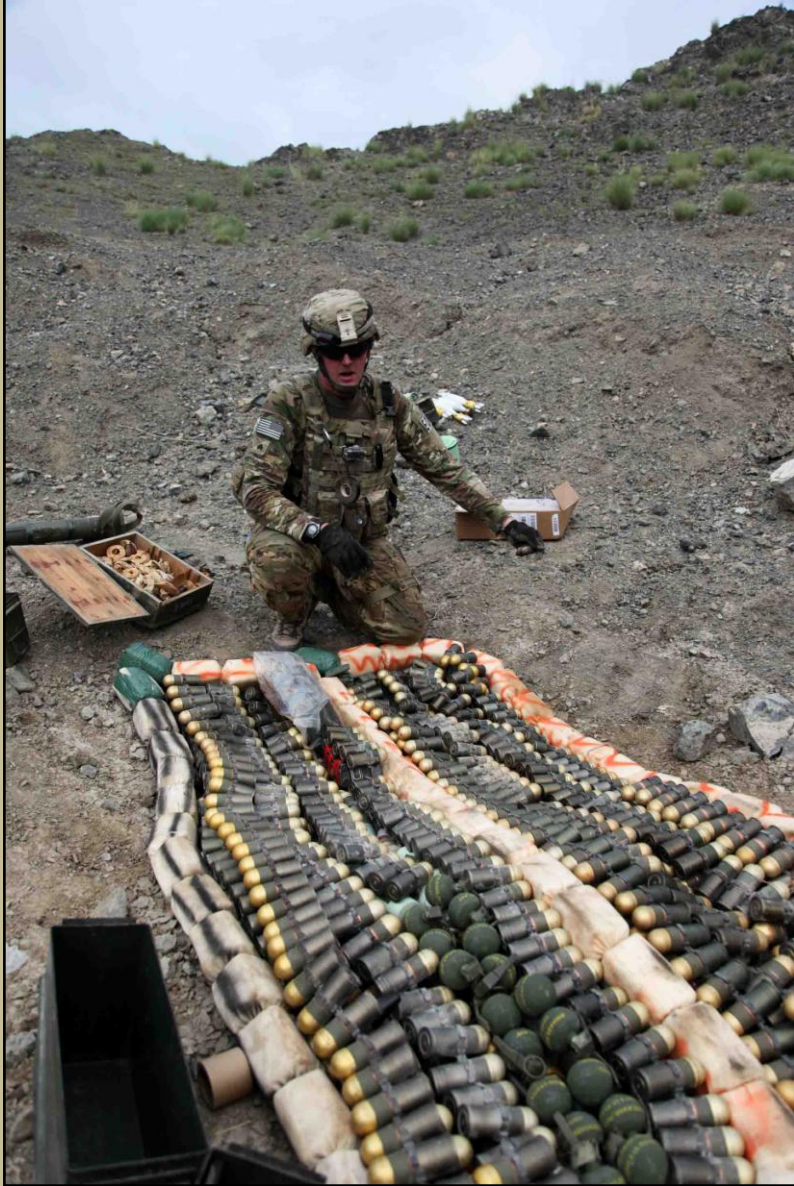
A U.S. Soldier assigned to 706th Explosive Ordnance Disposal (EOD) Company, Task Force 4-25, organizes old ordnance for destruction at the demolition range on Forward Operating Base Salerno, Khost province, Afghanistan, Sept. 2, 2012. EOD Soldiers disposed of ordnance and equipment that was determined to be unusable.