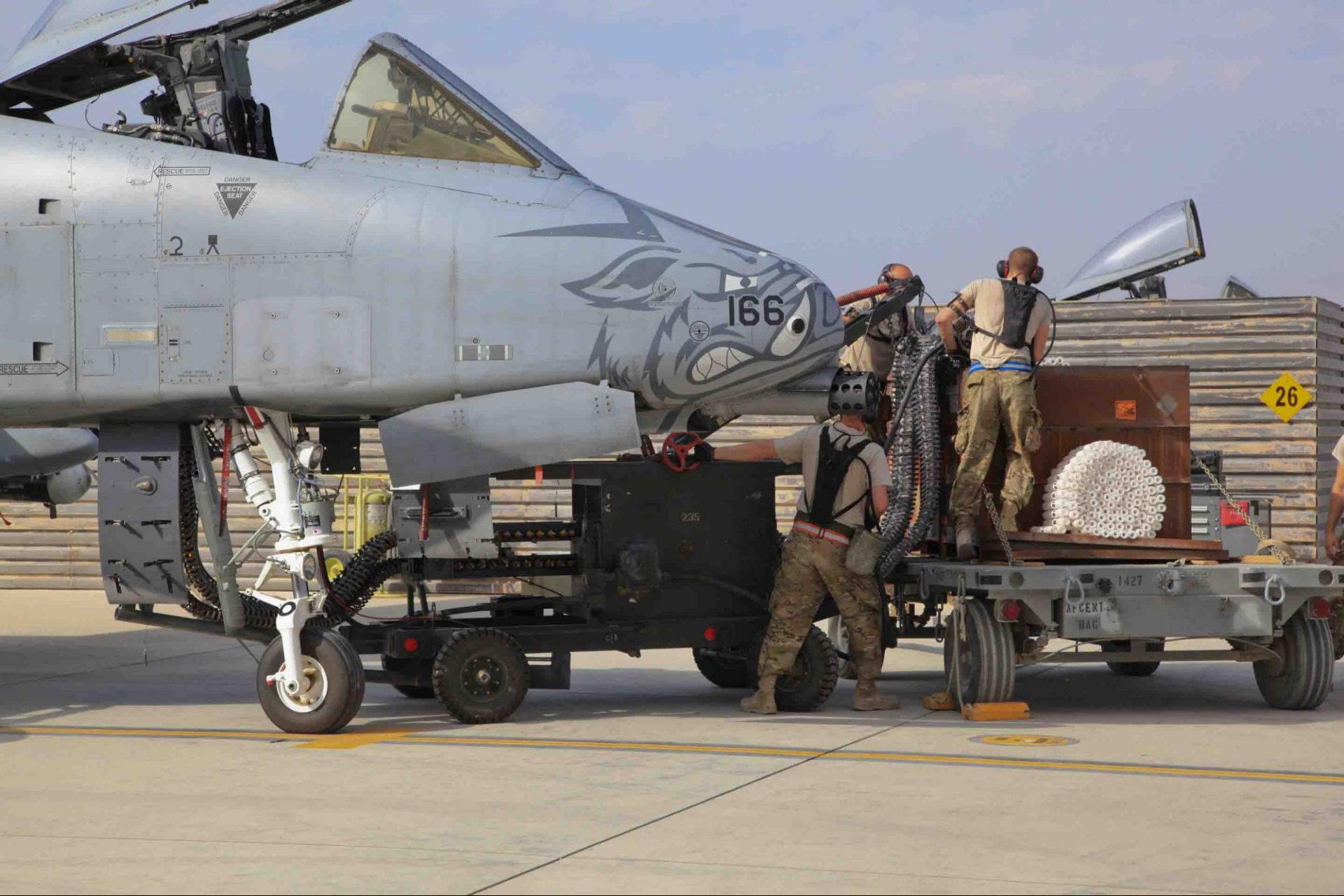
U.S. Airmen assigned to the 455th Expeditionary Maintenance Squadron (EAMXS), load 30 mm ammunition onto an A-10 Thunderbolt II aircraft on Bagram Airfield, Parwan province, Afghanistan, Sept. 2, 2012. The 455th EAMXS provides combat-ready aircraft and munitions to the air component commander throughout Afghanistan.