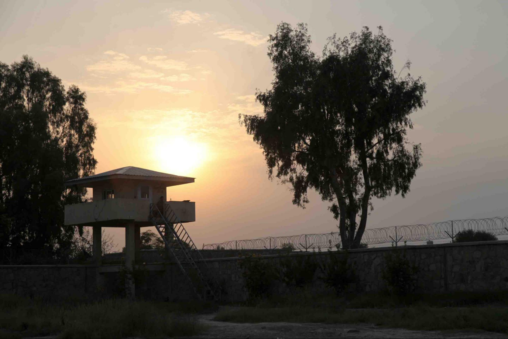
An Afghan Border Police officer, mans a security tower at the Afghan Border Police Quick Reaction Force, Kandak Compound, Khost province, Afghanistan, Sept. 3, 2012.