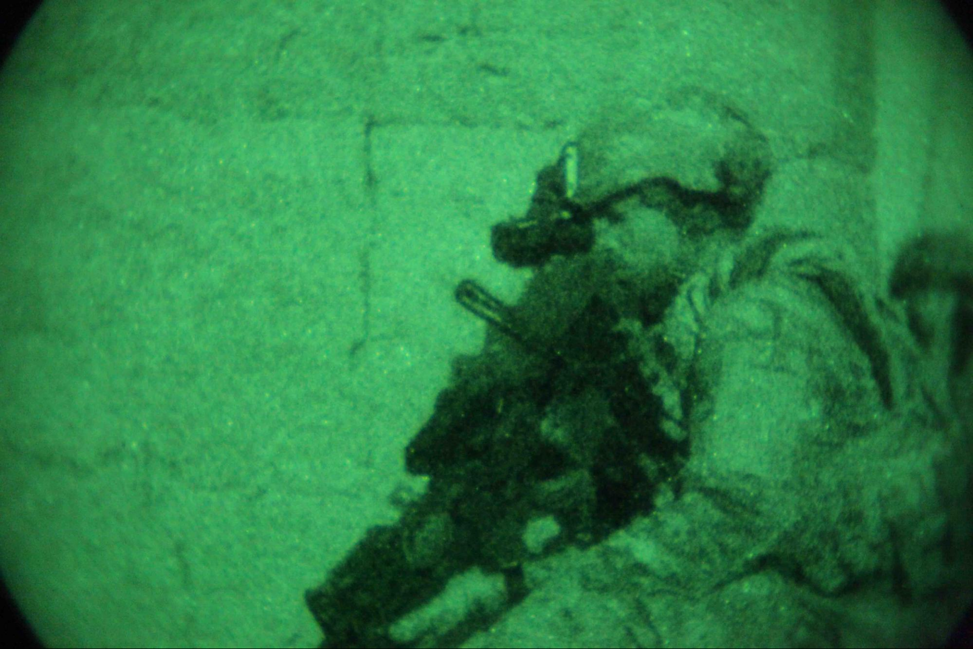
A U.S. Airman serving with the 455th Expeditionary Security Forces Squadron, "Reapers" provides security in Parwan province, Afghanistan, Oct. 6, 2012. The "Reapers" are part of a 24-hour disruption force that conducts missions out of Bagram Air Field.