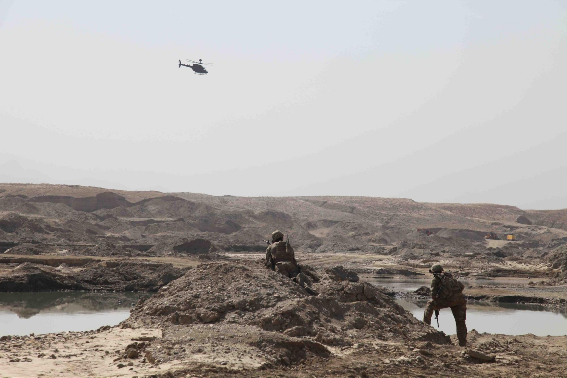
U.S. Airman serving with the 455th Expeditionary Security Forces Squadron, "Reapers" securing an area in Parwan province, Afghanistan, Oct. 9, 2012. The "Reapers" are part of a 24-hour disruption force that conducts missions out of Bagram Air Field.