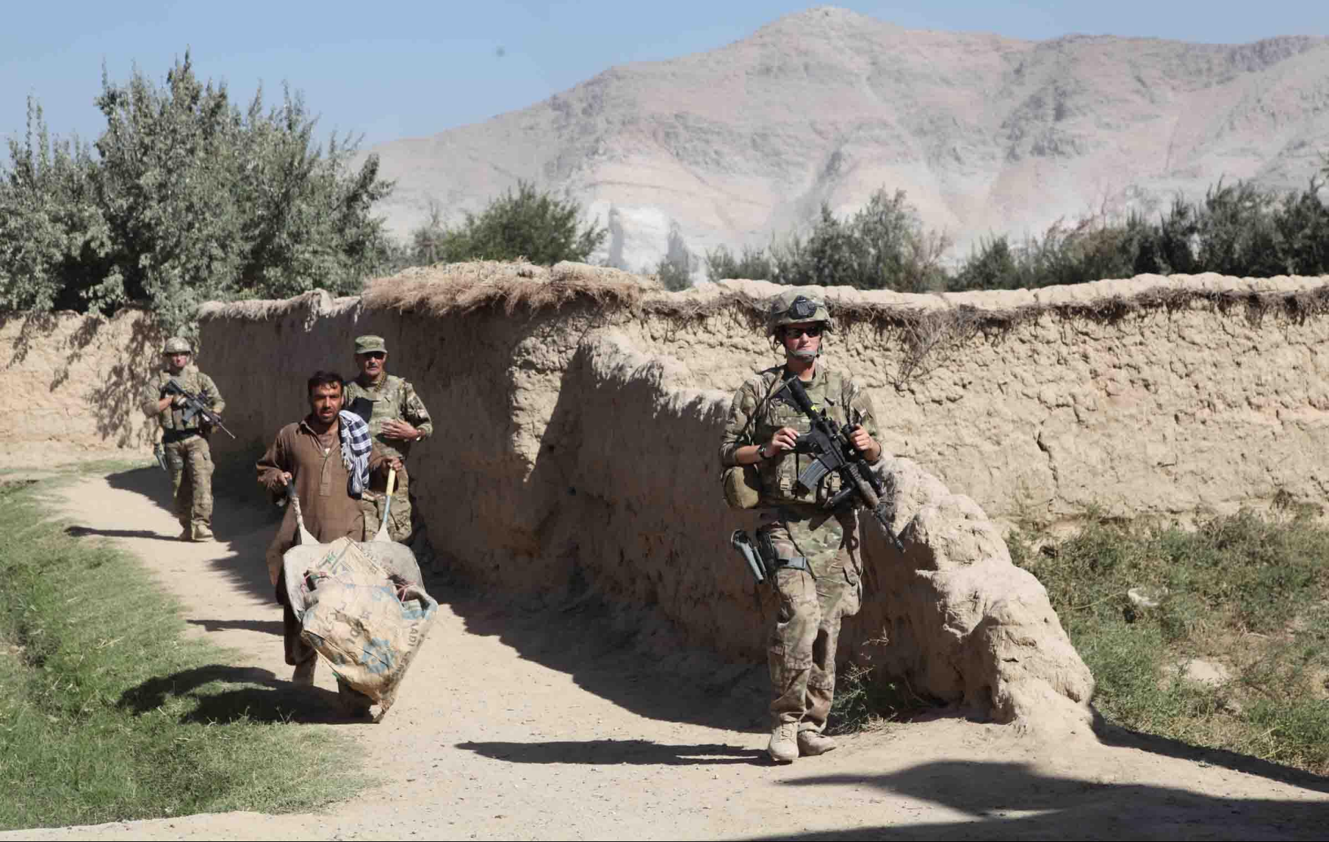
U.S. Airmen, with 455th Expeditionary Security Forces Squadron, walk along a pathway during a presence patrol outside Bagram Air Field (BAF), Parwan province, 08 Oct. 2012. The Airmen presence help decrease attacks on BAF.