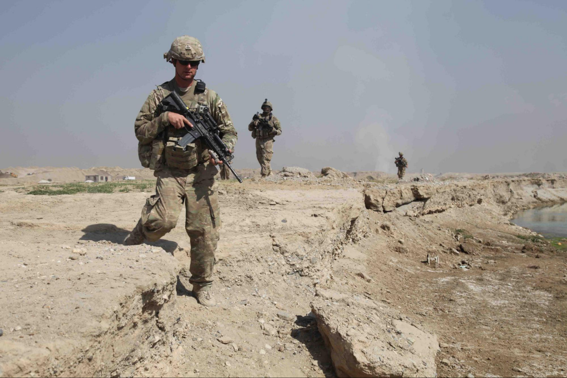
U.S. Airman serving with the 455th Expeditionary Security Forces Squadron, "Reapers" patrol in Parwan province, Afghanistan, Oct. 9, 2012. The "Reapers" are part of a 24-hour disruption force that conducts missions out of Bagram Air Field.