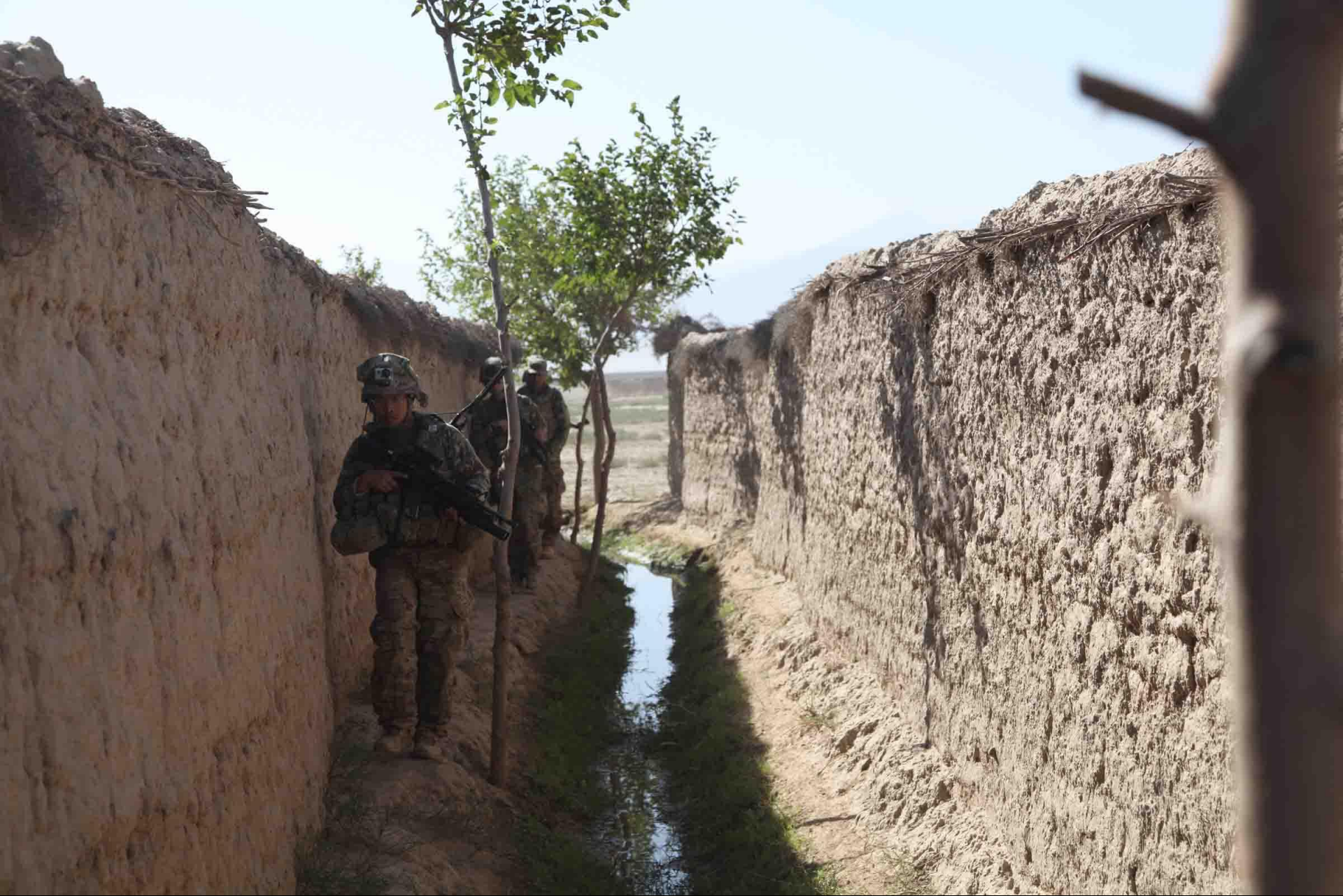
U.S. Airmen, with 455th Expeditionary Security Forces Squadron, maneuver through a narrow waterway during a presence patrol outside Bagram Air Field (BAF), Parwan province, 08 Oct. 2012. The Airmen presence help decrease attacks on BAF.