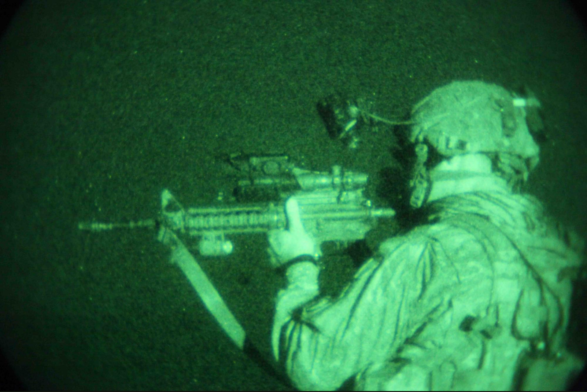
A U.S. Soldier serving with, F Company, 5th Battalion, 101st Aviation Brigade, "Pathfinders" provides security in Parwan province, Afghanistan, Oct. 6, 2012. The Pathfinders are on a joint patrol with the 455th Expeditionary Security Forces Squadron.