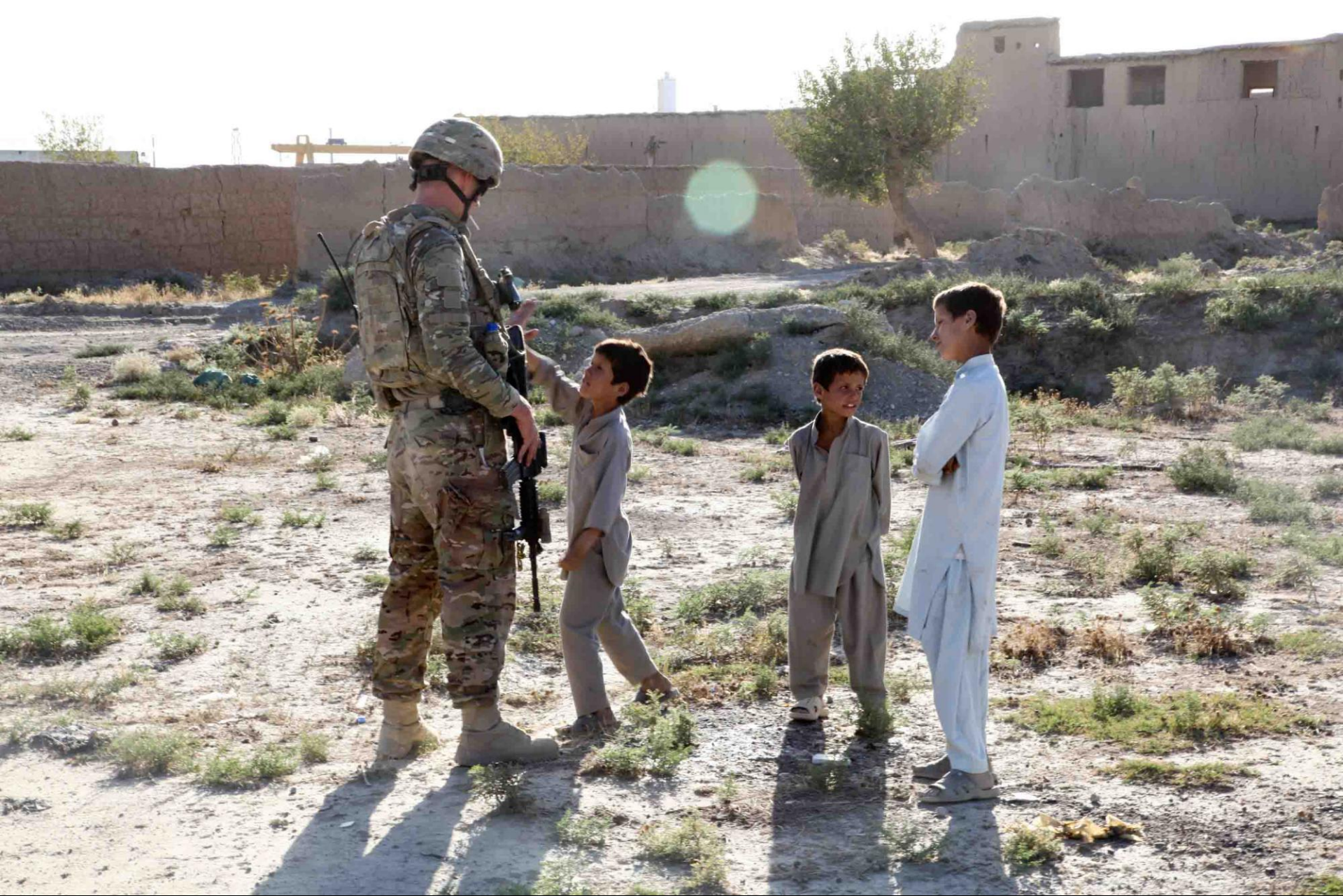
A U.S. Airman assigned to the 455th Expeditionary Security Forces Squadron plays with a local child during a routine patrol in Parwan province, Afghanistan, 4 Oct., 2012. The Airman was handing out clothes and school supplies to build rapport with the local population.