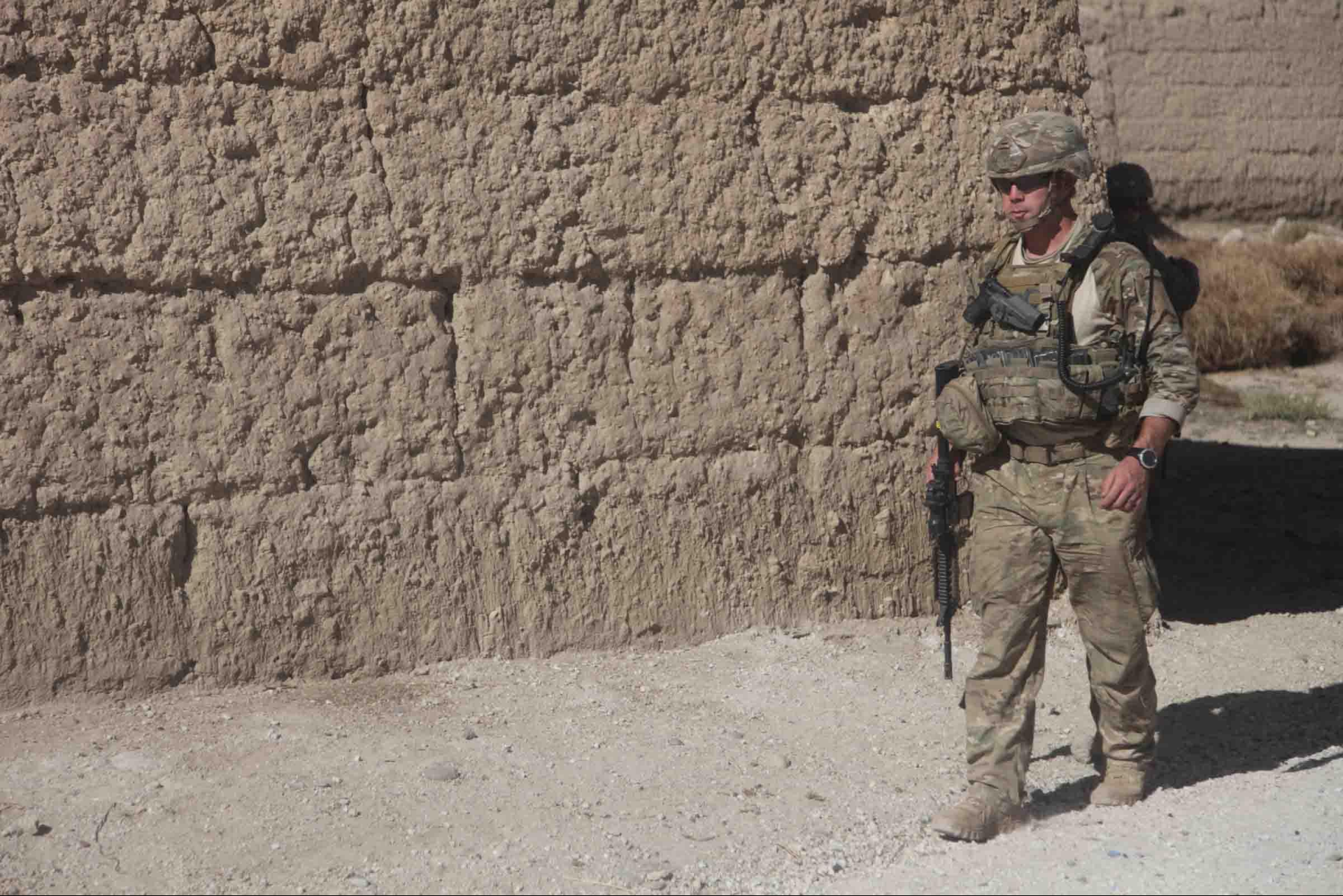
A U.S. Airman with 455th Expeditionary Security forces squadron Reaper Team One walks between the teams security placements in a village outside Bagram Air Base Oct. 4, 2012. The Reapers hand out clothing and school supplies to children.