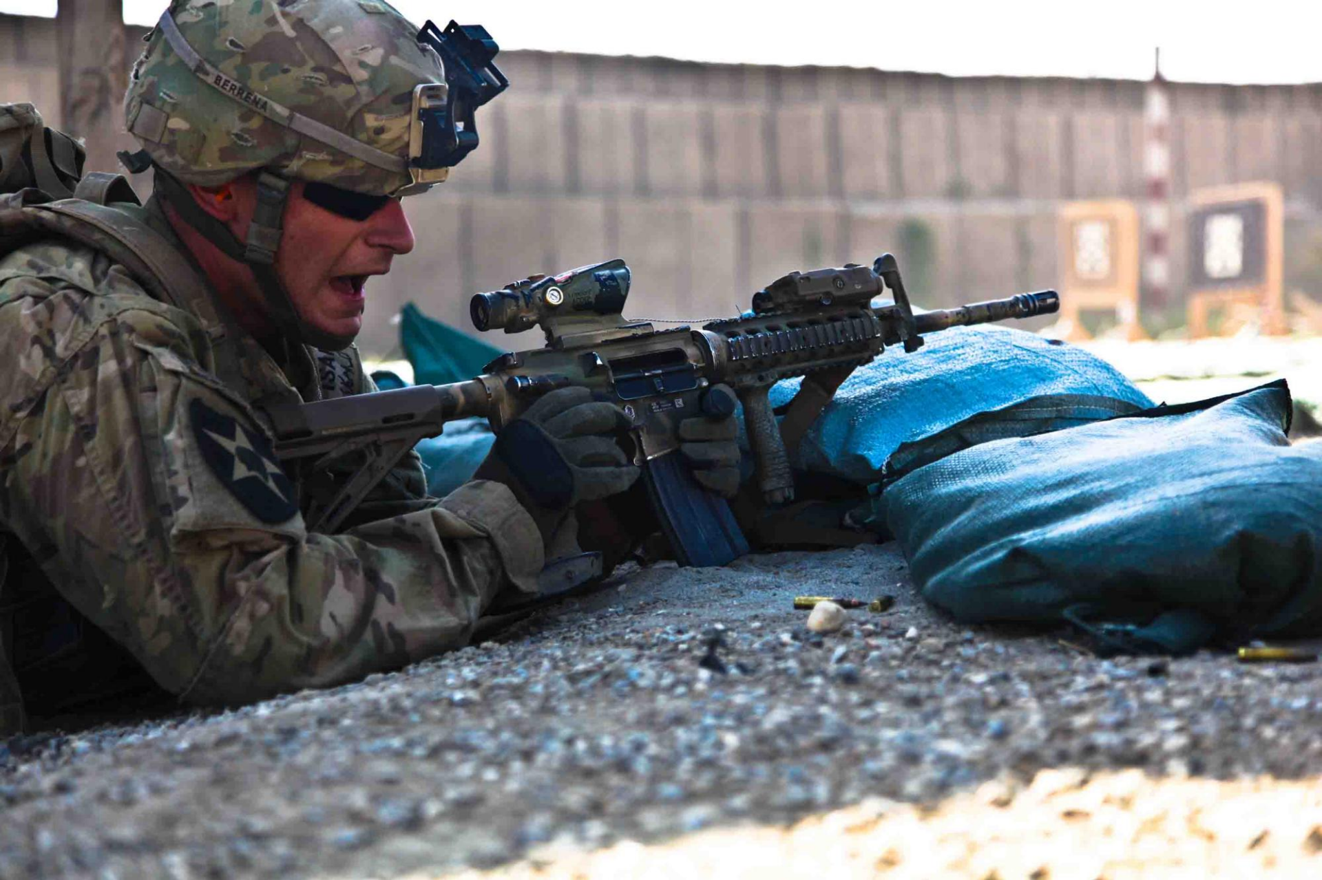
A U.S. Soldier assigned to 4th Infantry Brigade Combat Team, 4th Infantry Division, corrects a weapon malfunction during a Soldier of the Quarter Board at Forward Operating Base Fenty, Nangarhar province, Afghanistan, Oct. 4, 2012. The Soldier of the Quarter Board is a competition that evaluates each Soldier's ability to be an outstanding warrior.