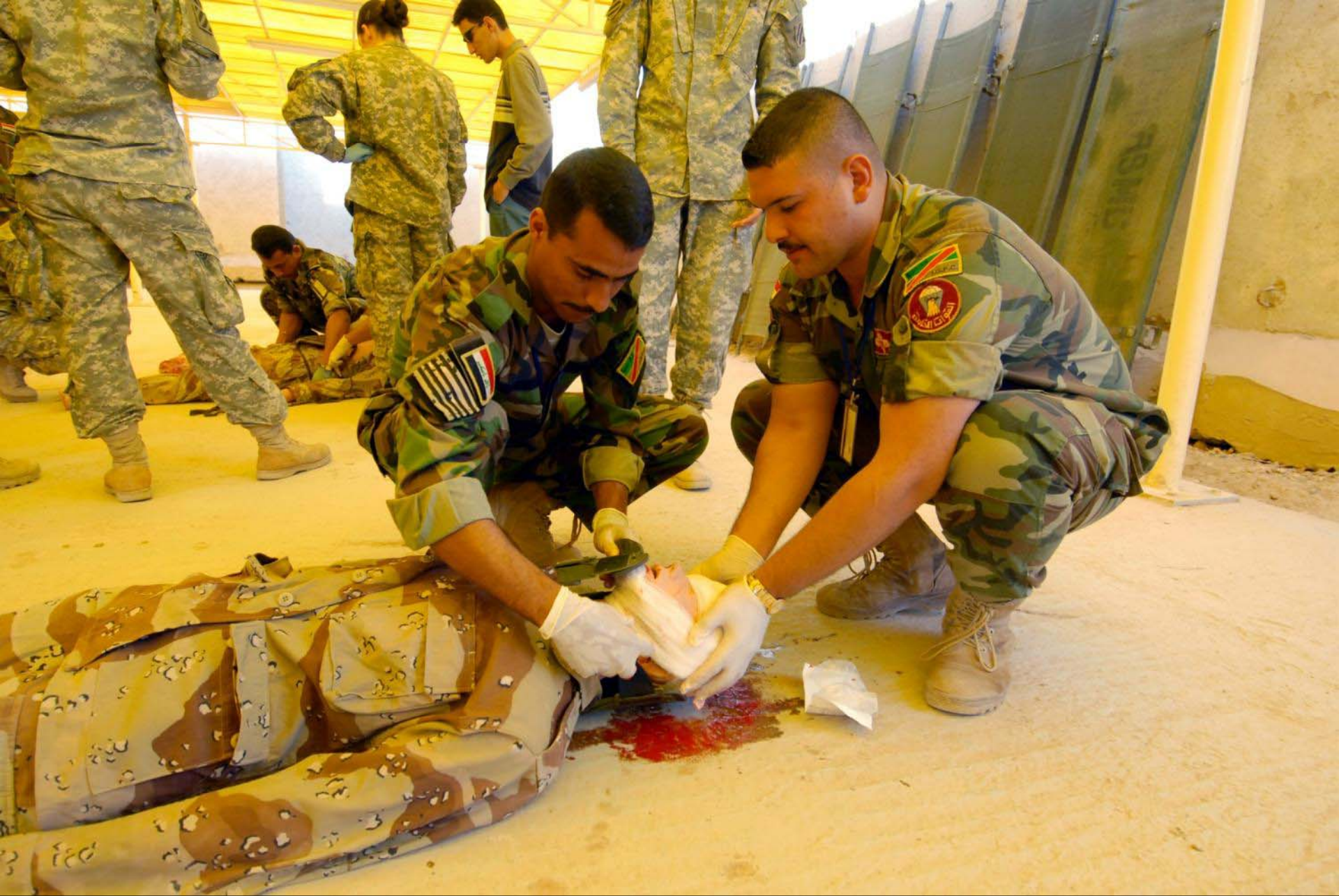
A pair of Iraqi soldiers put a neck brace on a training mannequin during combat lifesaver training held at Forward Operating Base Kalsu, Iraq, on Nov. 17, 2008.