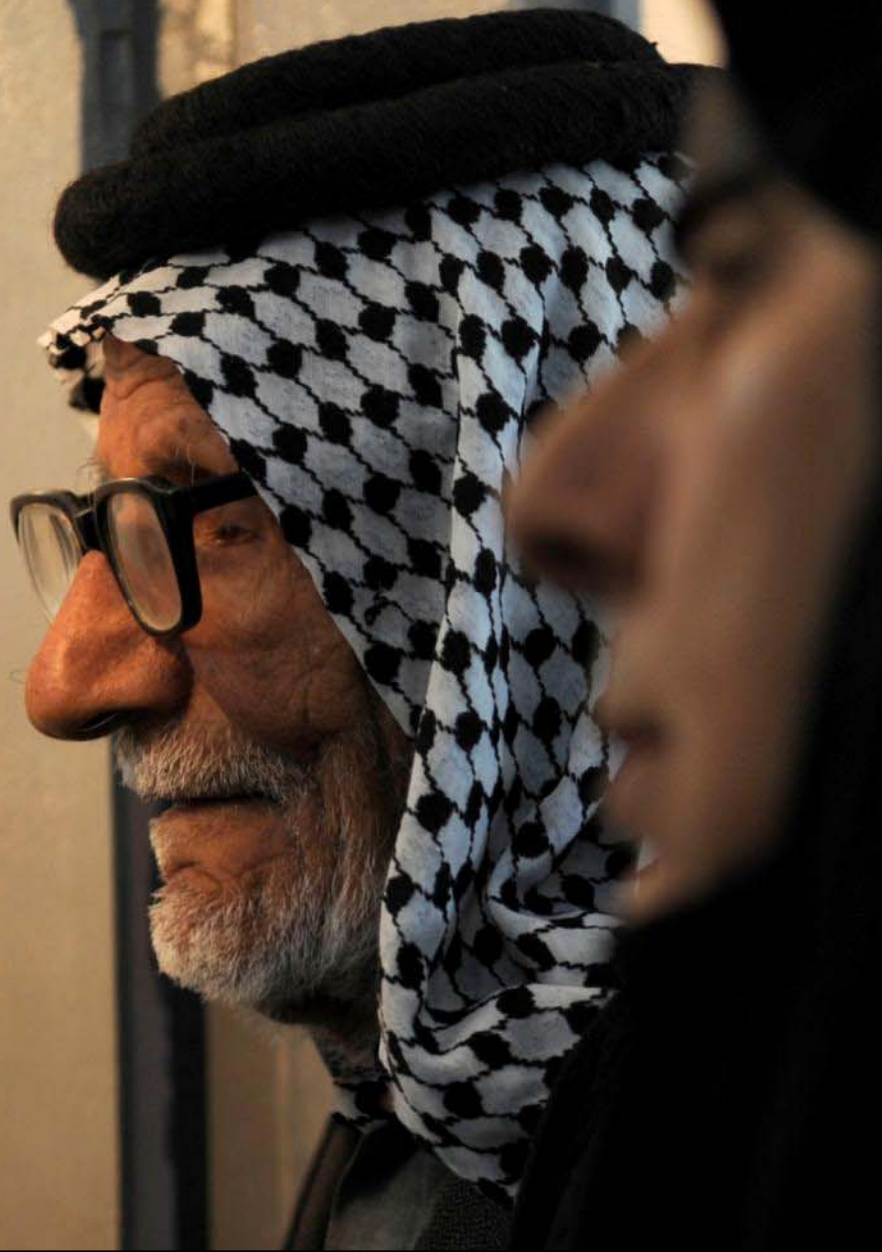
An Iraqi man and woman stand in the doorway waiting for their examination at the Al Salam Medical Clinic in Al Hayy, Iraq, on Nov. 24, 2008. Iraqi soldiers provided security as the U.S. Army's 7th Special Forces Group and El Salvadoran medics hosted a MEDREADY treating over 200 patients here.

081124-F-4860D-009