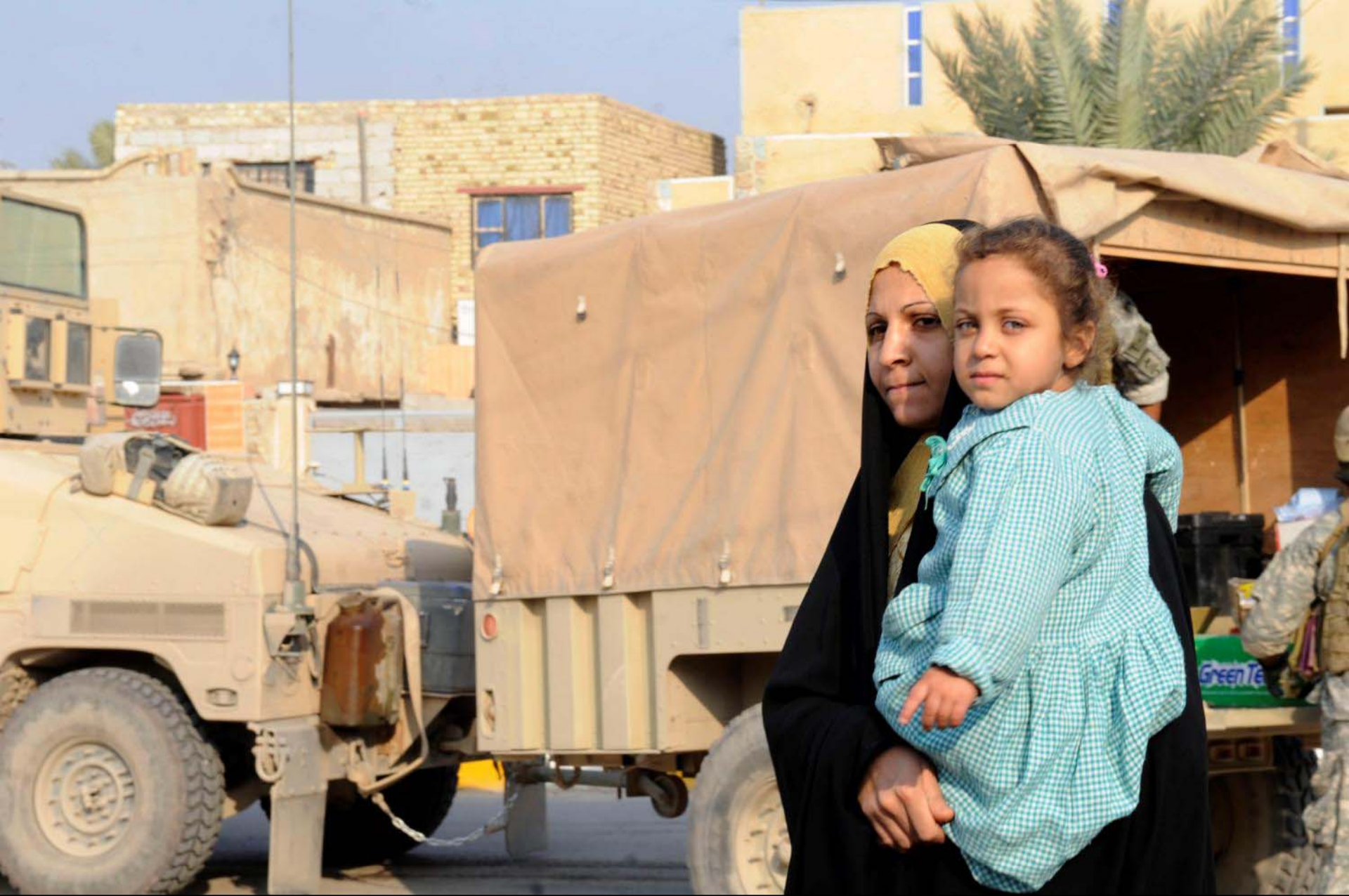
An Iraqi mother and her child wait as Iraqi soldiers set up inside the Al Salam Medical Clinic in Al Hayy, Iraq, on Nov. 24, 2008. The U.S. Army's 7th Special Forces Group and El Salvadoran medics hosted a MEDREADY mission treating over 200 patients here.