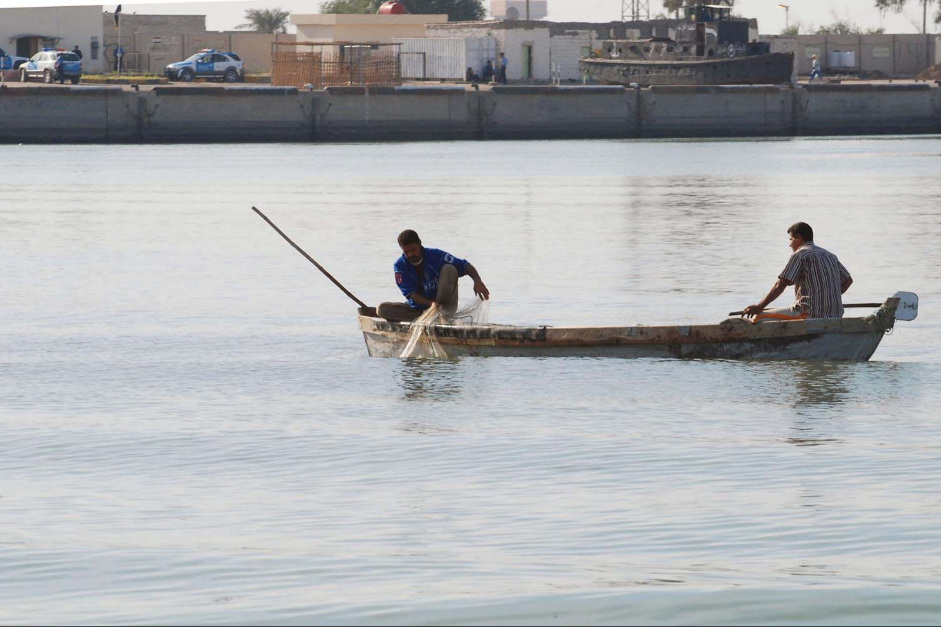
An Iraqi fishermen retrieves his fishing net, while his partner helps keep the boat stable, in the Shatt al' Arab River, in Basra, Iraq, on Nov. 19, 2008.

081119-A-68510-320