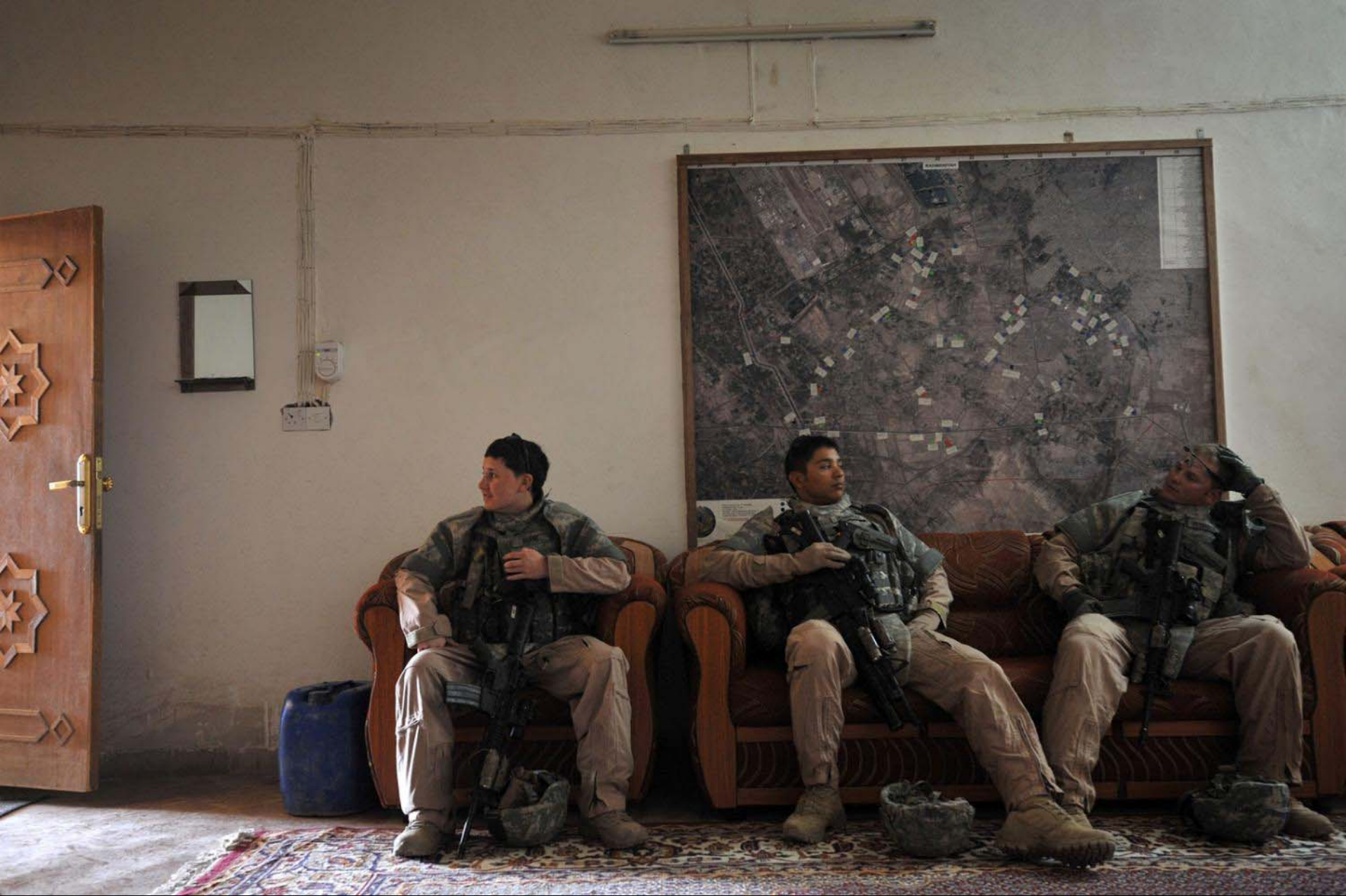
U.S. Airmen assigned to 11th Security Forces Squadron, Detachment 3, 732nd Expeditionary Security Forces Squadron, 1st Brigade Combat Team, 4th Infantry Division, take a break on couches located in the Al Radwanya Police Station located in southern Baghdad, Iraq, Nov. 19, 2008.

081119-N-1810F-174