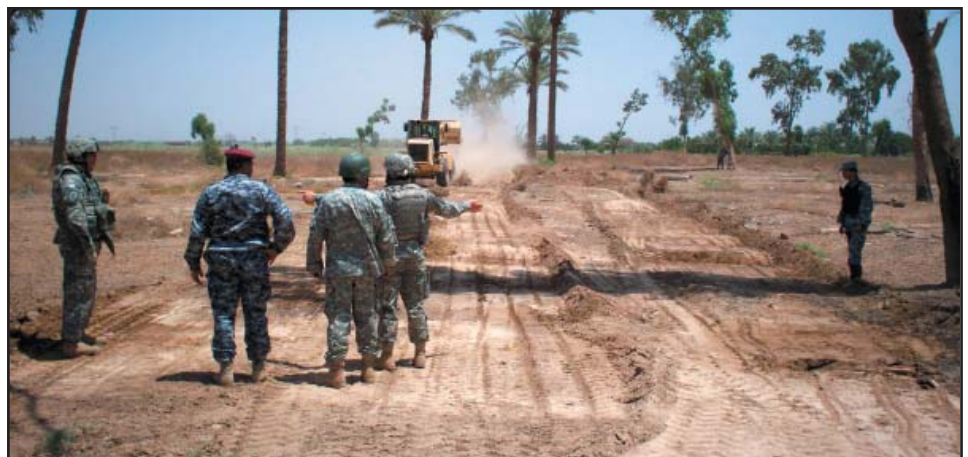
Spc. Ben Hutto

The National Guard unit is attached to See RANGE, Page 3