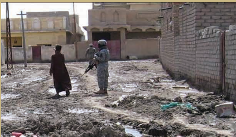
Below: A street in Al Batha before the recent grading and paving projects (left), an Al Batha street during the paving project.