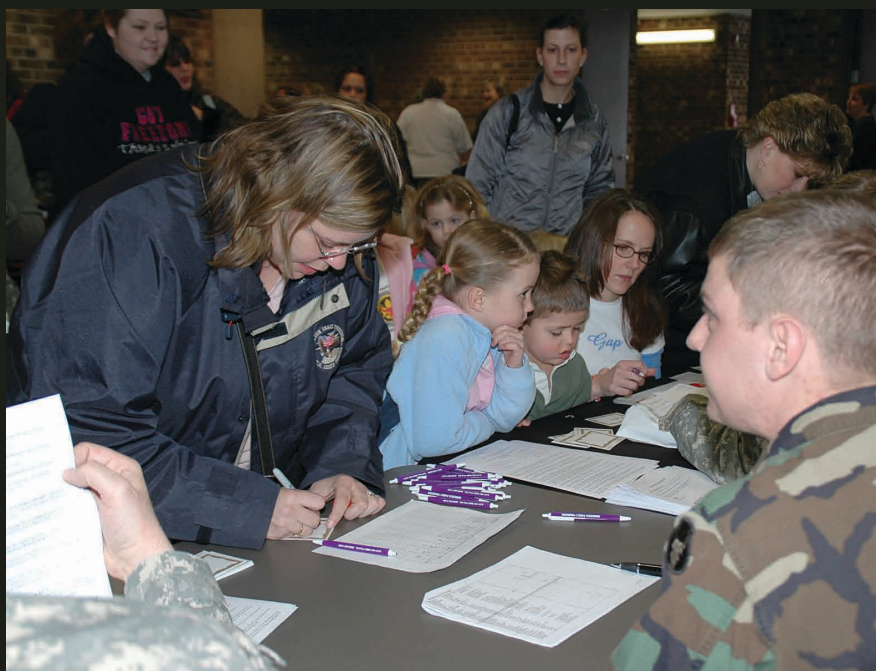
Families of 1/34 BCT Soldiers signing in at a family reintegration academy in Brooklyn Park, Minn.