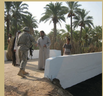
Above: The old Bahkan bridge (left), the newly constructed Bahkan bridge.